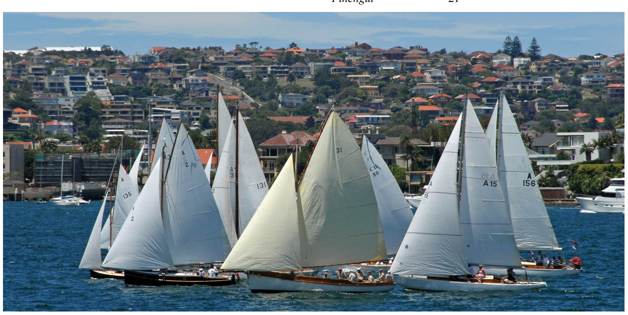
Close racing in the Australia Day Regatta with SASC yachts well represented