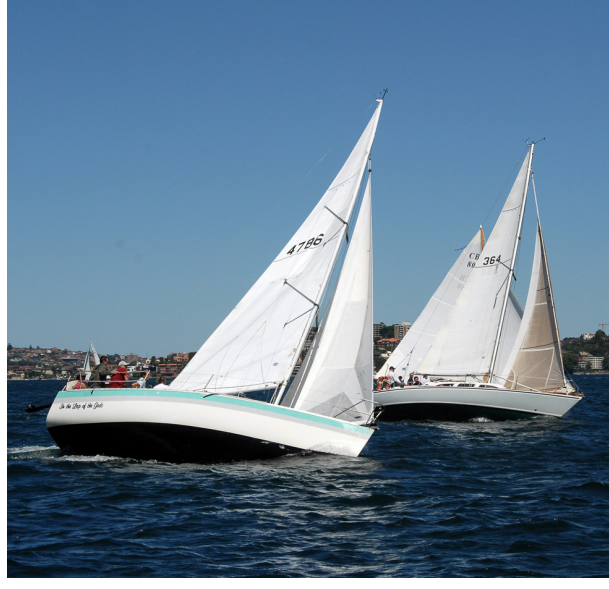
In the Lap of the Gods, Paper Moon and Sylvia beating to windward