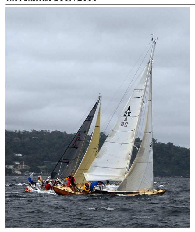
Clewless? and Celeste sailing in the Paul Slocombe Trophy series