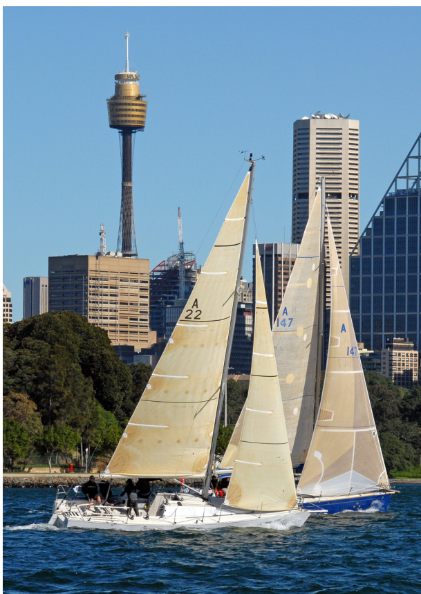
Torquil and Ticket of Leave