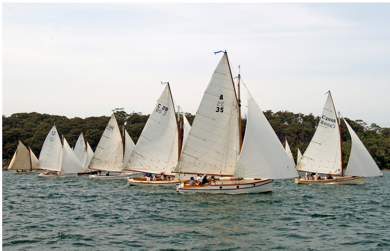
Gaffers Day 2011 — the start of the Rangers and Couta boats