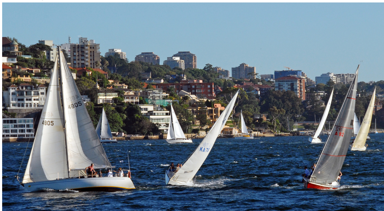
The SASC Friday Twilight fleet