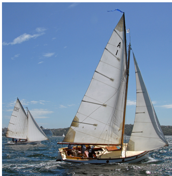
Rob Roy and Ranger