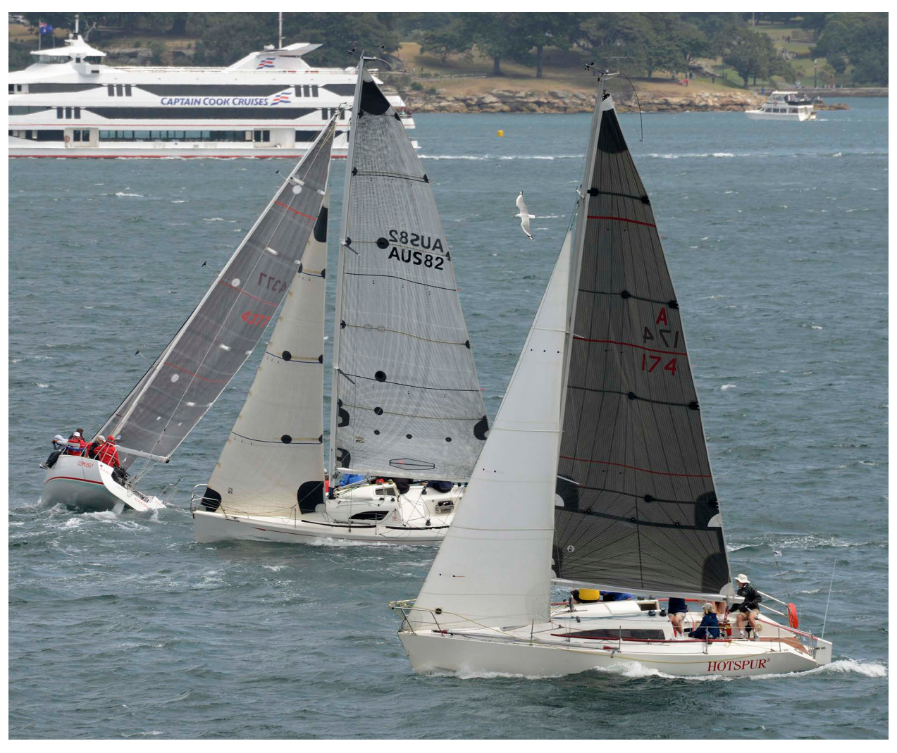
Clewless?, Tigger and Hotspur 2