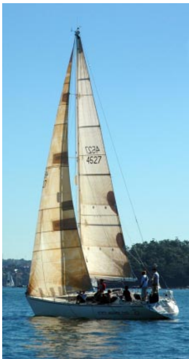
She's Apples Two (Max Prentice)