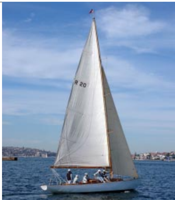
Antara (Ian Kortlang)