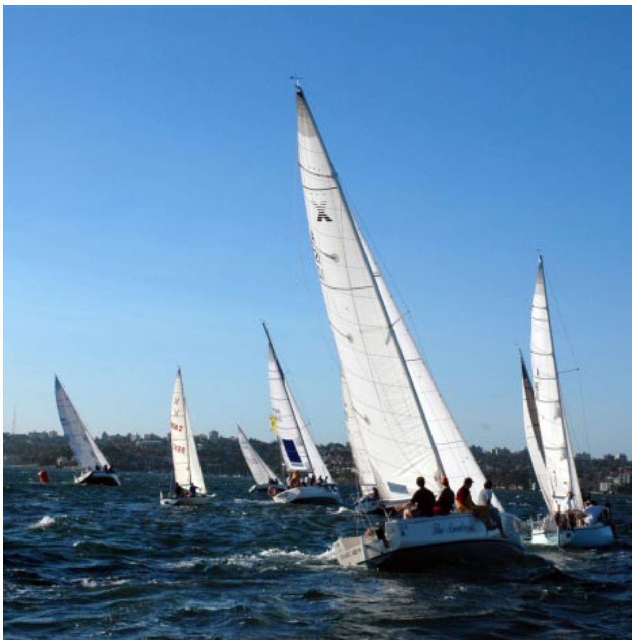
The Amateurs , winner of the Adams 10 National Championships held at Lake Macquarie in January 2005, starting in a race in the Paul Slocombe Trophy series