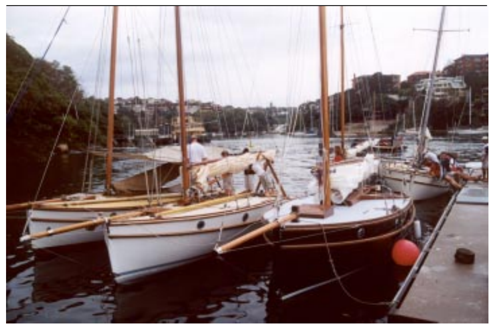
Rangers gathered at the SASC before the start of their World Championships. (above) Cherub approaching the finish. (below)