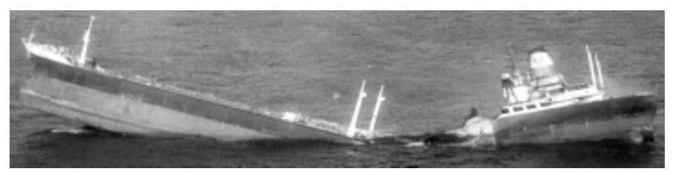
World Glory sinking in June 1968.

This phenomenon was probably responsible for one of the long-standing mysteries of the sea, the loss without trace of the Blue Anchor Line passenger ship Waratah. Built in 1908, Waratah was a cargo liner of 9,339 tons, and had 211 passengers and crew on board when she vanished between Capetown and Durban in July 1909. No wreckage or sign of the ship was found at the time. In 1997 a salvor claimed to have found the wreck lying in 113 m of water. Her bow section is extensively damaged and her mid section collapsed. The stern is more or less intact.