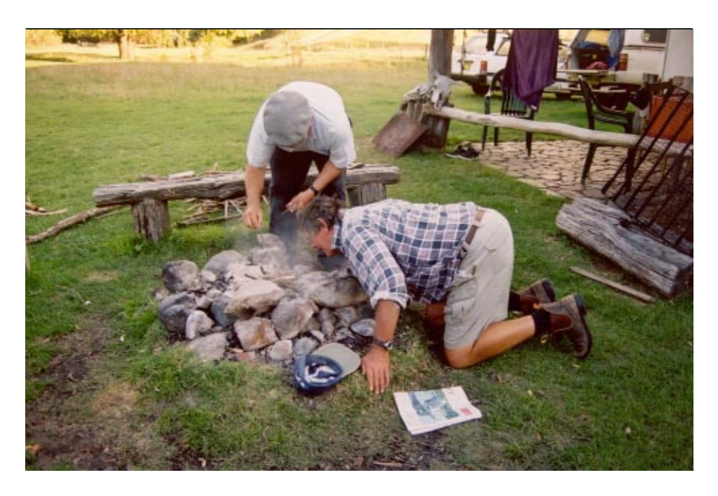
BLOW JOB ... Dal assumes the position in the fire-lighting competition (above)