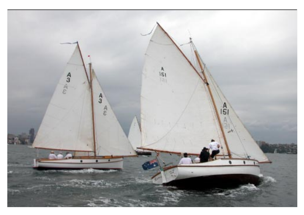
Kilkie and Retreat at the start of the Ranger World Championships on 17 March (above) Ranger leading Vanity and Cherub to the finish line (below)