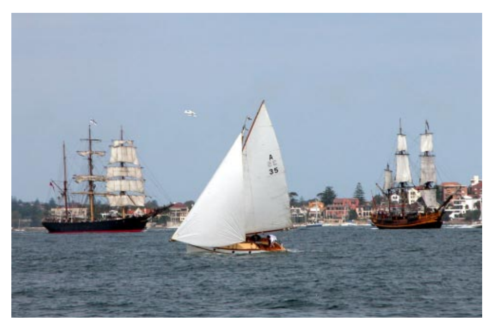
Etrenne helping James Craig and Bounty provide a spectacle of sail on Sydney Harbour