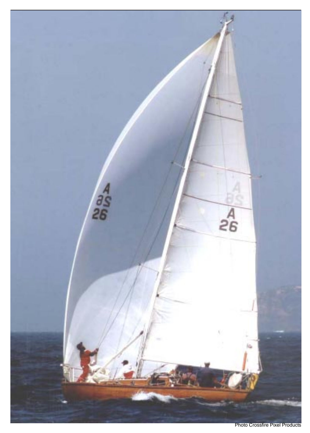
Celeste on the way to Batemans Bay