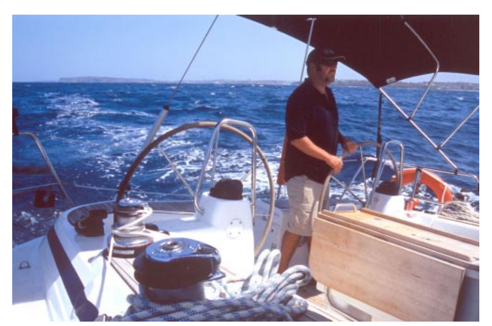
need a bit of spare light stuff." It was a simple act of seamanlike mateship. Just eighteen hours later that gesture would help save the boat.

About four miles off Woolongong at 0430 the off-watch stumbled up the companionway to the helmsman's shout of "All hands! All hands! We've got big trouble, fellas. No steering!" The twin wheels spun drunkenly as the boat turned slow circles in the 2-metre swell and a decidedly nasty crunching sound issued from somewhere inside the stern. We removed the access cover for the emergency tiller to discover the top of the rudder stock thrashing about at least six inches below deck level. Whatever locking nut or ring had held the big spade in place was nowhere to be seen. We wouldn't be solving this problem quickly.