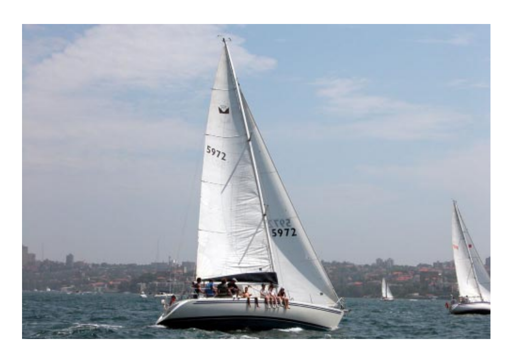
Mezzaluna (above) and Paper Moon and Quicksilver (below) during a Sunday race on Sydney Harbour.