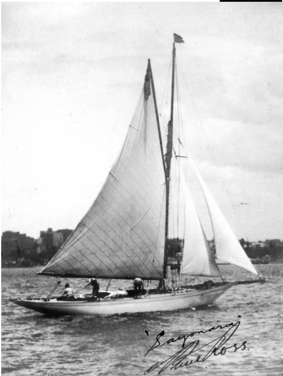
a photograph of Sayonara taken about 1930