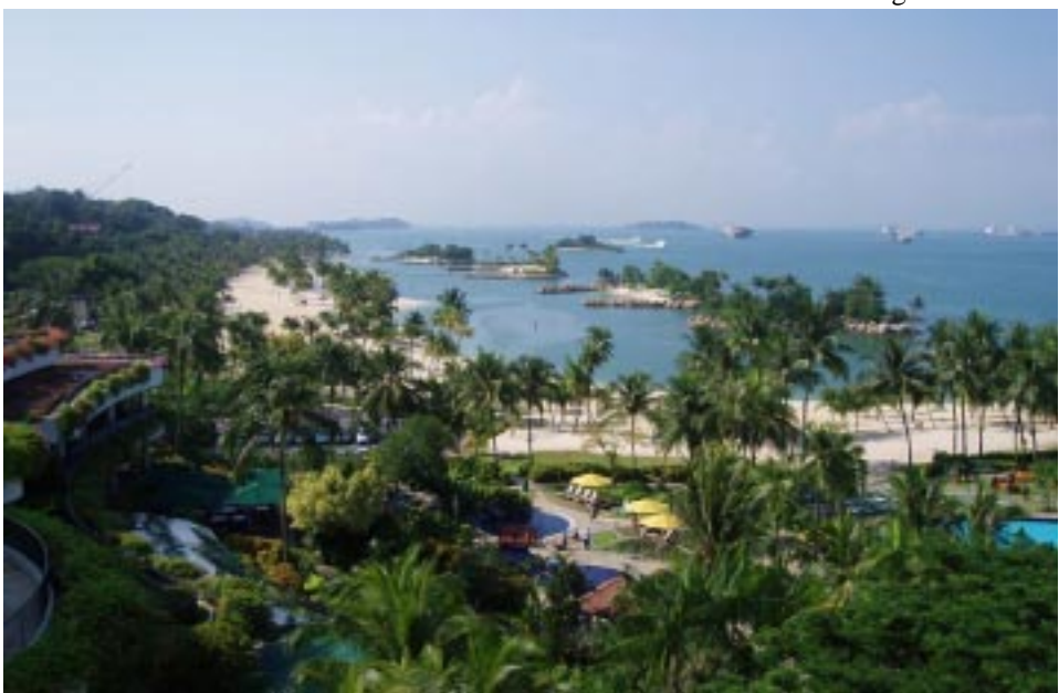
Sentosa Island Singapore

As a sailing destination Singapore itself has a huge amount to offer. With lovely warm waters and generally calm seas the area is packed with many islands and ports beckoning for visits. With this in mind it is clear that the Singaporean Tourism Board (STB) which is a major sponsor of the race are keen to promote the assets that Singapore has to offer to world sailors as well as business and tourists in general.