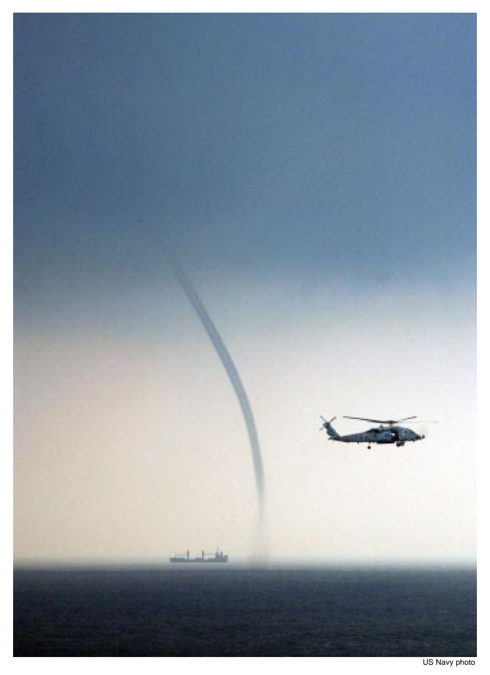
A Seahawk helicopter operating from the aircraft carrier USS John C Stennis keeps an eye on a nearby vessel while a waterspout takes form off the coast of Malaysia