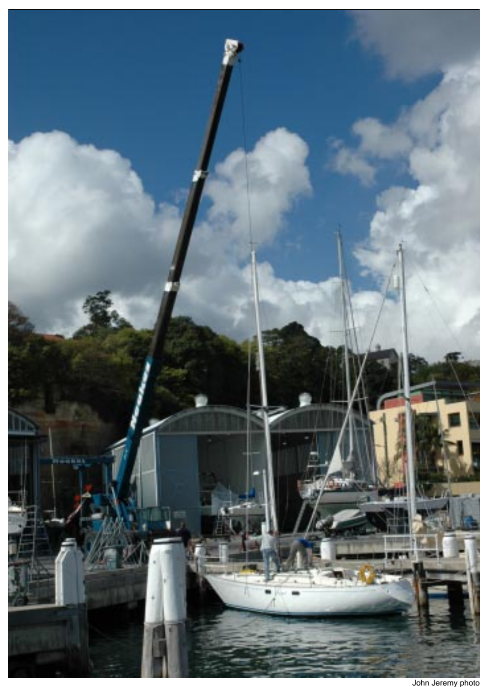
Also stimulating the economy at Noakes during August — Tingari having her mast removed for overhaul