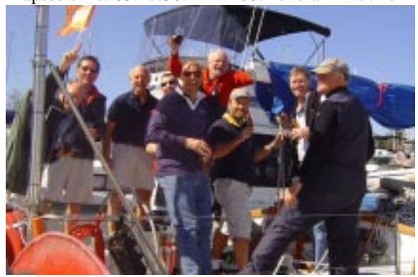
The crew from EZ Street and Bright Morning Star sharing their relief that they are not responsible for the on-board fur balls

Elapsed time: 03:17:36:24 — 60th overall — 7th on PHS