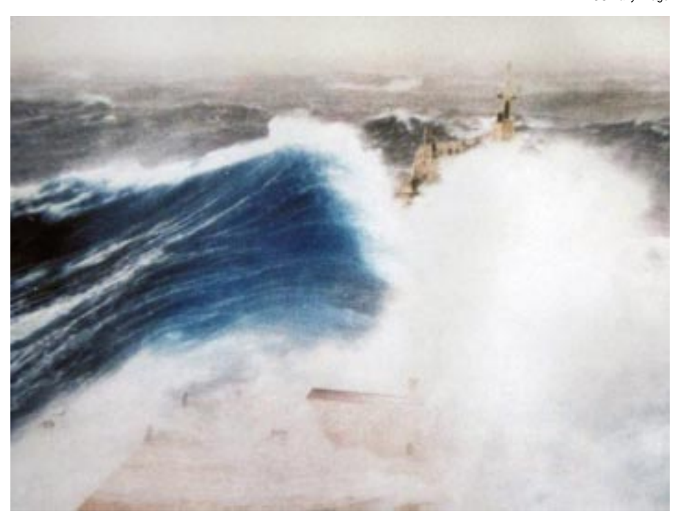
What could we possibly say about this encounter? Try to avoid being at sea in conditions like this!