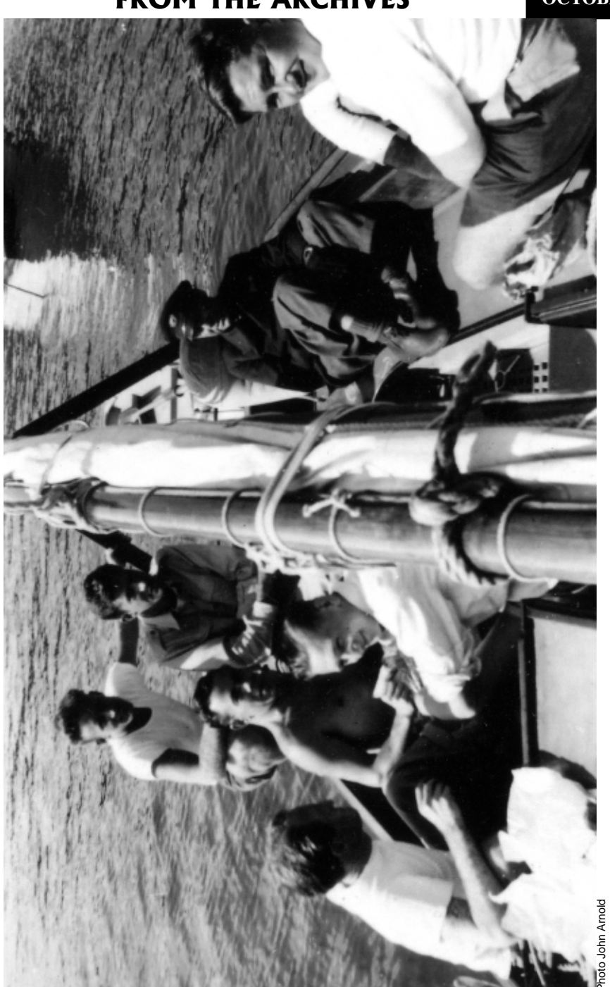
This photograph of the crew in the cockpit of Ranger was taken Store Beach in the 1952. Cliff Gale is sitting in the port quarter and the young man immediately to the left of the boom is none other than Bill Gale. Compared to today's photos of Ranger, the photograph is notable for another reason — there are no women on board!