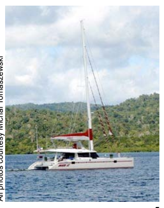
Blaze II under

Next day we moved the yacht to the "fuel wharf" which work comprised a pick-up truck with a few 44 gallon drums of diesel, 600 litres of which were then siphoned into Blaze II. That afternoon we moored a few miles north in front of the Aore Resort for that evening's weekly feast of barbequed seafood rice and crayfish. Entertained by a group of musicians and dancers from one of the distant Banks group of islands, we were served Kava by their village Chief — it was revolting — I mean the Kava!