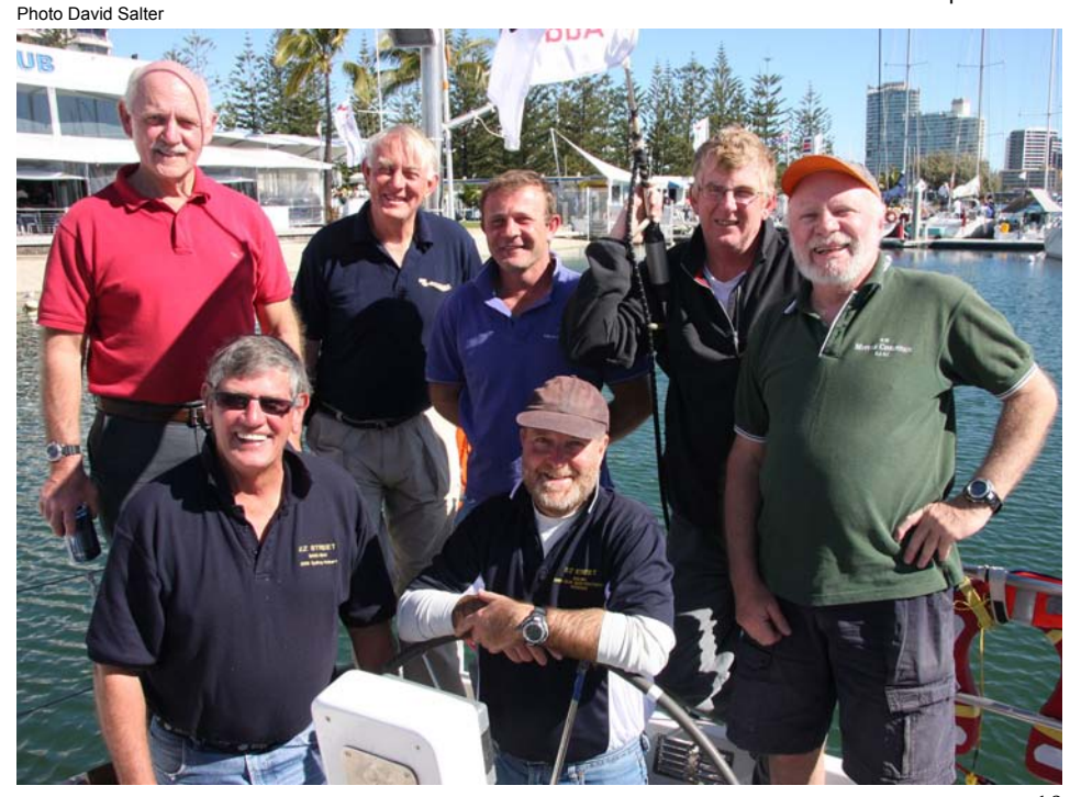
The happy EZ Street crew after confirmation of third place

And how pleasant it would have been to then savour that achievement by passing a relaxing few days sinking the odd XXXX on the sunny deck of the Southport Yacht Club. Instead, I had to scurry down to Coolangatta airport and get a flight back to Sydney to be in the office by first thing the following morning. It would be tempting to denounce all this unseemly haste as yet another example of how our sport is being distorted by the pressures of modern life, but I had only myself to blame. After all, where is it written that work is more important than sailing?