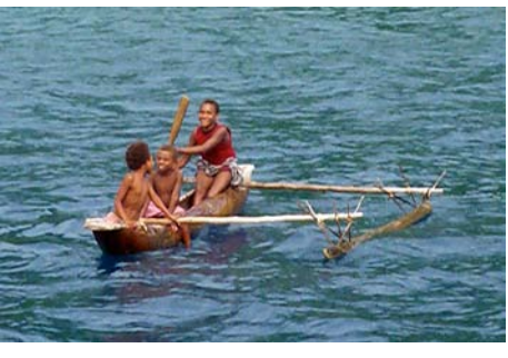
Local kids having a ball

Kareely, flanked by some village dignitaries, gave a formal speech of welcome which was followed by a welcoming song and only then were we invited into the hut proper to sample a feast of finger food prepared for the occasion. Of course we also had some presents for them in the form of some school aids, pencils, books and crayons etc.