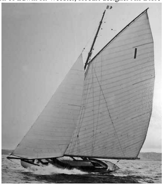
An early photo of Weenè

These boats were designed to be of a "knockabout" nature with 21 feet on the waterline, the construction to be "strong and durable". Under the instruction of Edwin H. Webster, Hobart designer Alf Blore modified