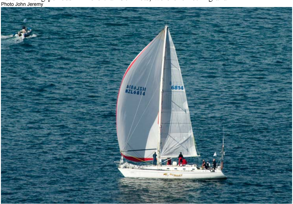
EZ Street on the way

EZ Street was the sole entrant in the fleet of more than 70 yachts racing to Southport this year to fly the Amateurs' burgee. I will spare you another meditation on the regrettable decline of offshore racing within the club, but what also struck me about our ship's company was that the majority of us also skippered our own boats on the SASC register. With boat ownership comes a more measured regard for preparation, safety and for preserving a yacht's rig, sails and equipment. No doubt that collective prudence helped account for the fact that despite racing hard for long periods in more than 30 knots, we broke nothing and