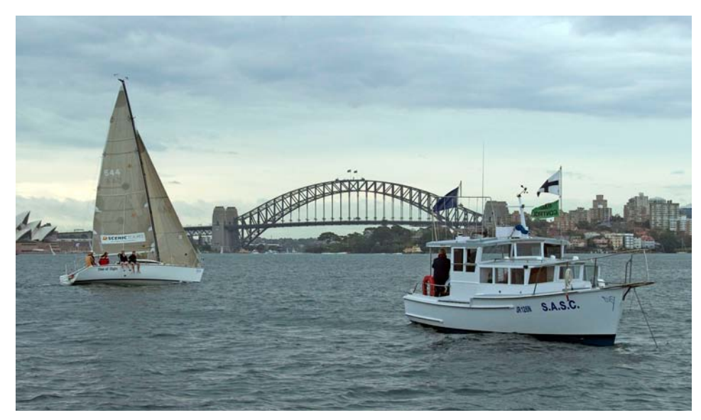
The weather for the SASC Opening Regatta for the 2010-11 season was not particularly enticing. Nevertheless 21 boats started in the race which was won by Nocturne . The photos show the second boat, Out of Sight , crossing the finish line (above) and Magic and Hickup approaching the finish (below)