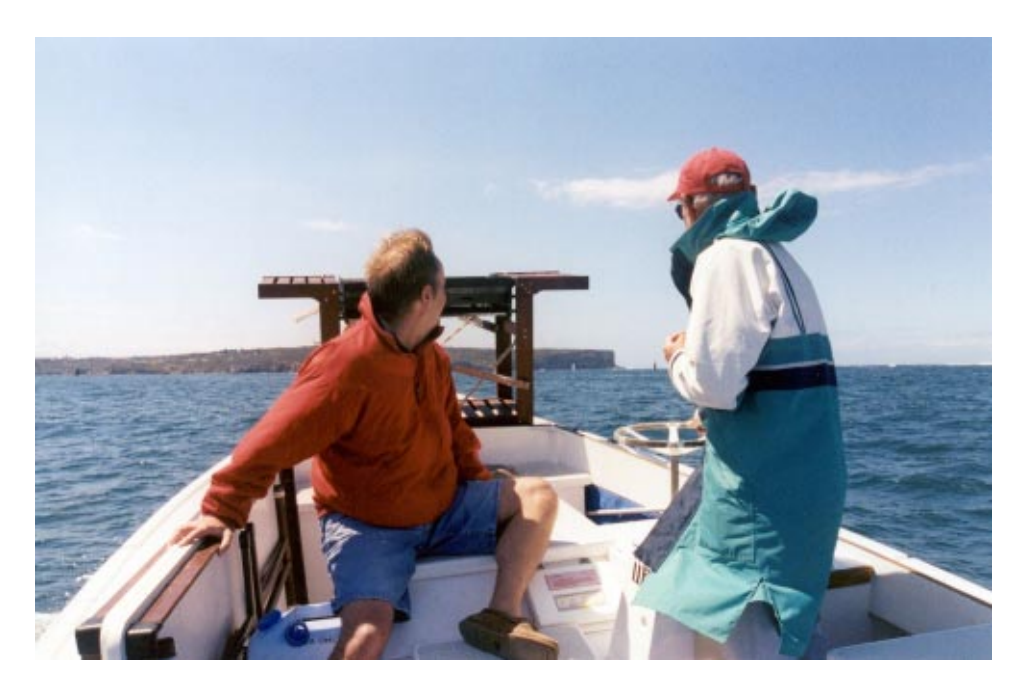
The foredeck ornament safely crosses the Heads

A crystal day for the traditional Store Beach gathering