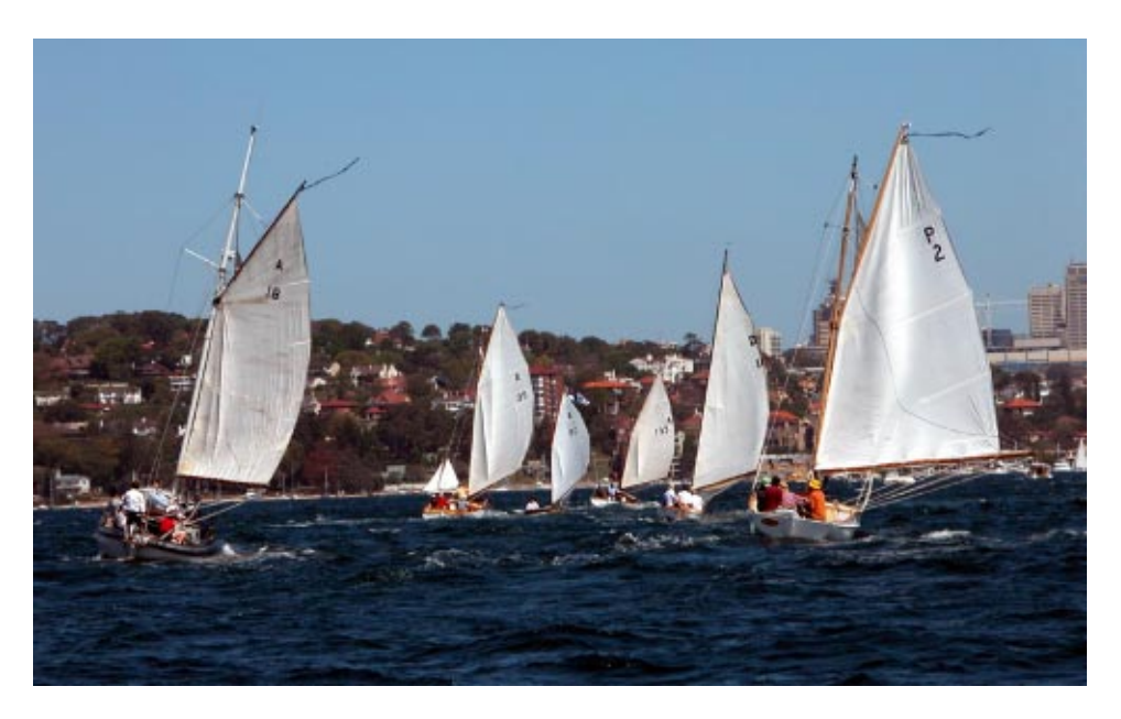
Fidelis charging towards the start (left). Her crew appear intent on the task at hand, except for the two right aft who are deep in conversation about something important.

Gaffers approaching Clark Island in ideal conditions (above) and two historic skiffs set out (below)