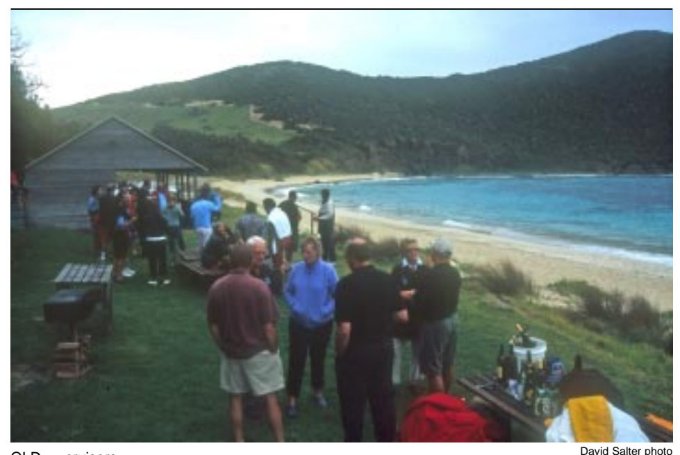
QLD — cruisers assemble for the endurance BBQ at Ned's Beach

settling our various mooring fees and visitor levies.