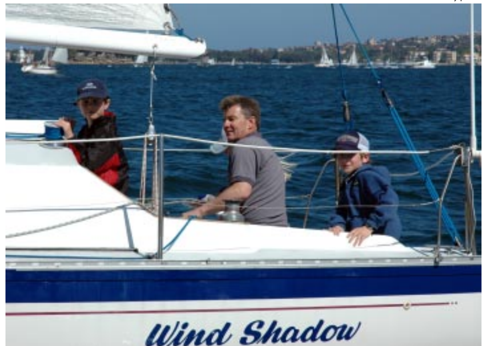
Redlands sailing is not just about racing or boats; it is also about history, heritage and assisting youngsters to grow into fine adults. As such, the school is delighted to be able to enjoy so much contact, and subsequent wisdom from members such as the OK dinghy sailors. We would really welcome the presence of, and extend an open invitation to, any SASC member to visit us either on a Thursday afternoon or Saturday morning, to share with us the pursuit and sheer fun of "just messing about in boats".

The young crew in Wind Shadow concentrating on the finish in a recent Division 6 Sunday race