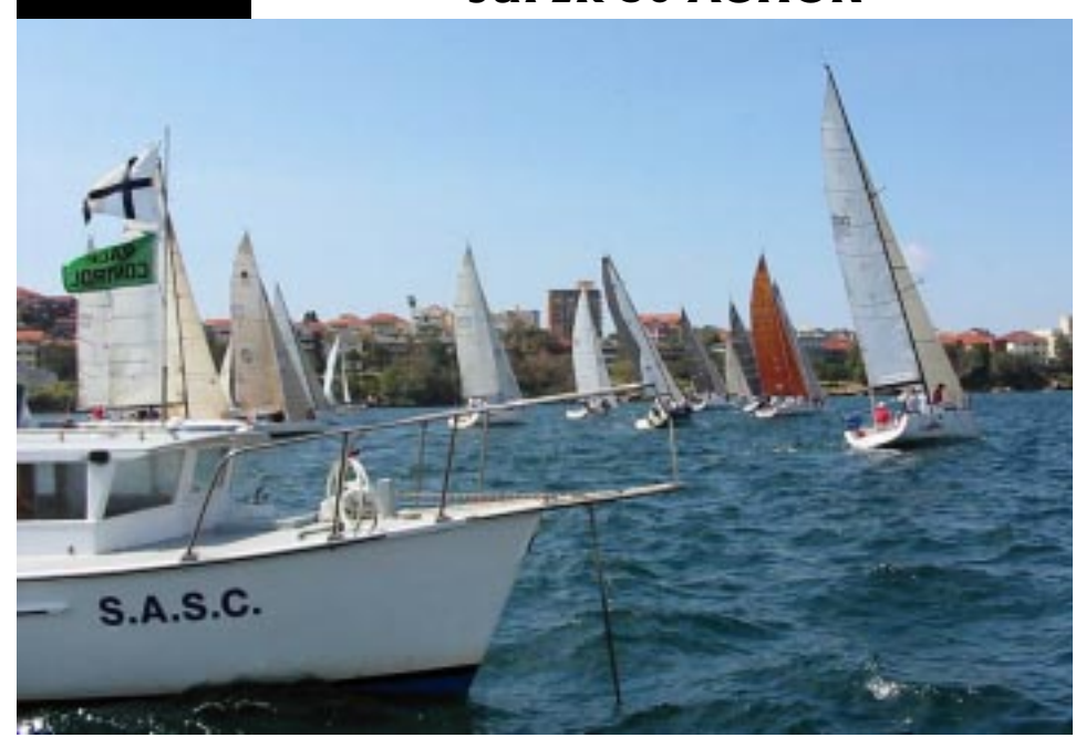
A race in the Super 30 Division gets underway in a light south easterly (above) *Martini* beats to windward (below)