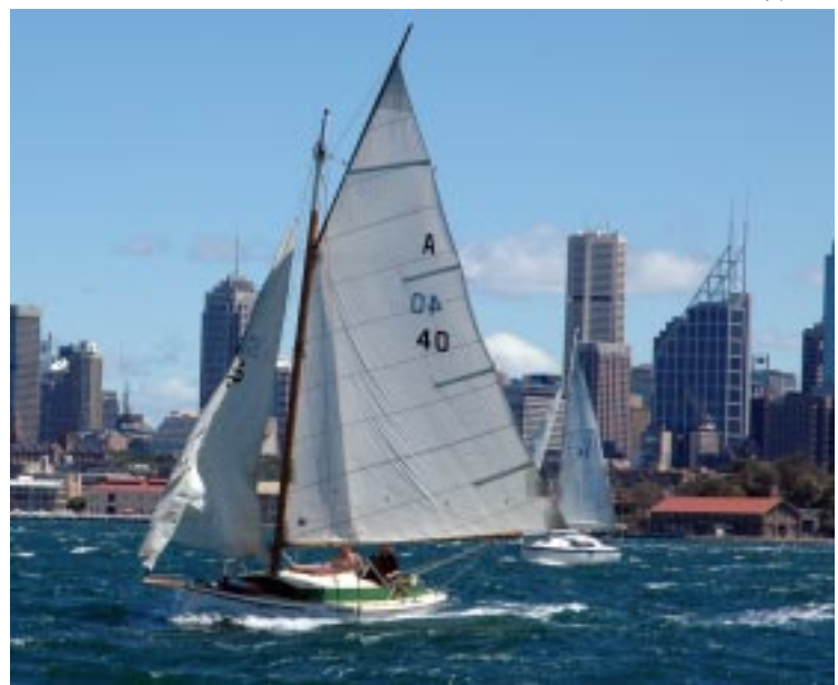
Gumnut and Wind Shadow on the run before a fresh westerly (right)

Ranger recovering from an eager start (above)