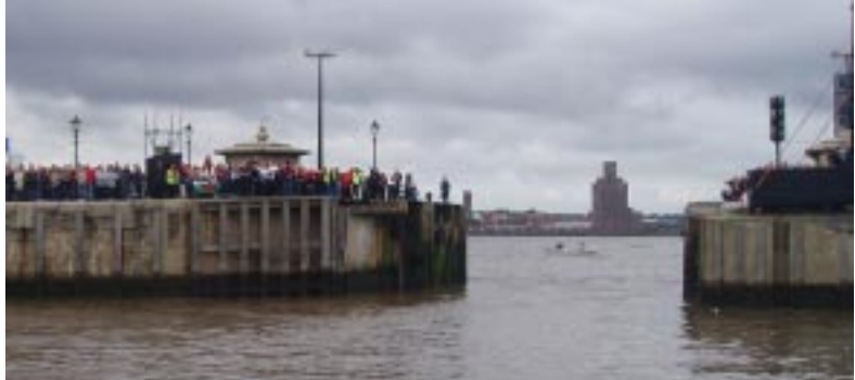
The lock gates open and its time to enter the Mersey

Stay tuned for the next edition in which I will update you on the outcome.