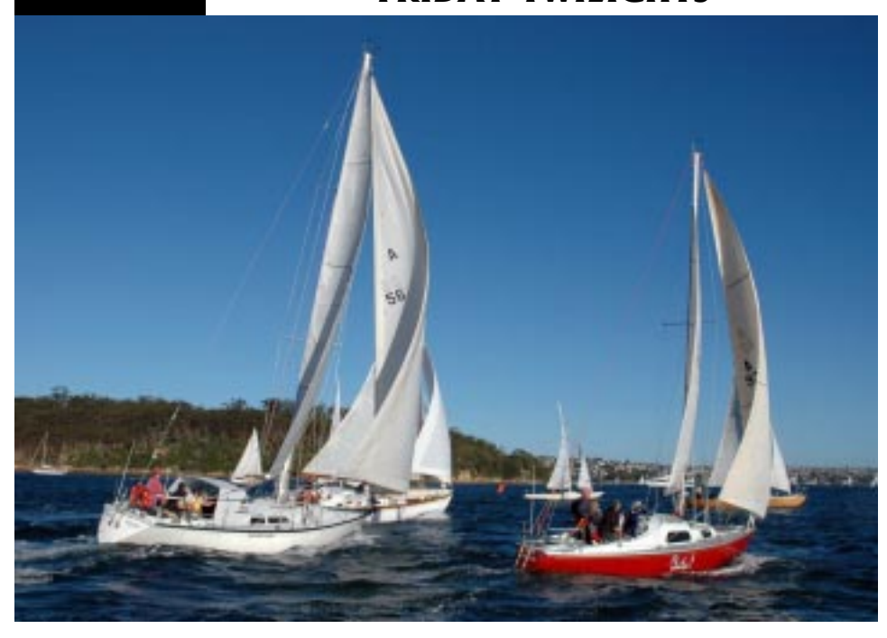
The start of Division B in a recent twilight race — Taylor Maid and Clewless? in the foreground (above) and Mezzaluna, Chilly Bin, Paper Moon and U2 after the Division A start (below)