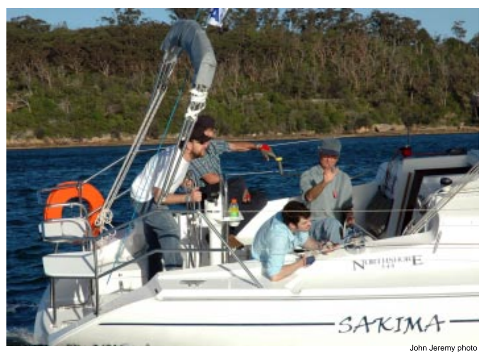
Two of the crew in Sakima seemed to be travelling at least one knot faster than the boat during a recent twilight race