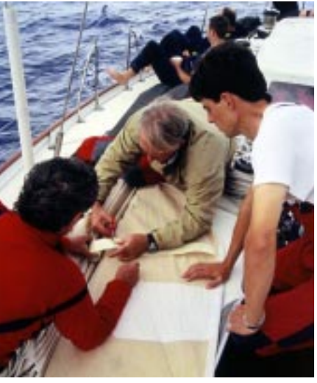
Stickyback moment... dealing with chafe is part of long-distance racing (above)

mour these scrofulous curmudgeons we dragged up the kite and got it setting for at least 10 minutes. Then the wind duly clocked forward, strengthened and the damned spinnaker went back into the bag where it belonged. From there it was a splendid 4-hour work to the line beneath the spectacular cliffs of Mount Lidgbird and Mount Gower. Can there be a more beautiful landfall anywhere in the world?