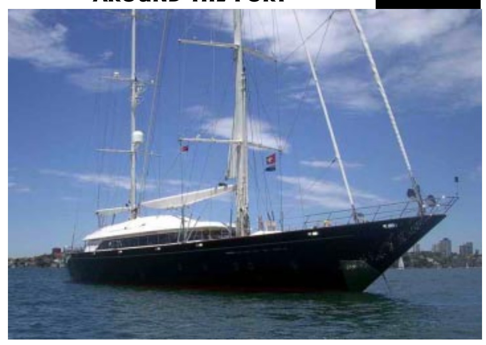
The luxury yacht Phryne graced Athol Bay recently and displayed topsides as they should be — although Vanity (seen in reflection below) can compete well in the gleaming department