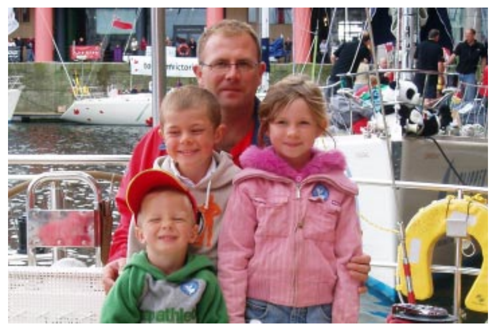
The Falk kids on a pre-departure inspection

With food on board for 16 for a month it has been necessary to devise a storage plan with all lockers on the boat numbered and a corresponding spreadsheet to outline what is in each locker. This also applies to the myriad of spare parts that we carry. Thirty rolls of duct tape, 15 tubes of Sikaflex and 60 hose clamps along with 7 kgs of assorted nuts and bolts and almost a kilometre of spare halyards and sheets that I have managed to squirrel away over recent months. My biggest issue is where to hide all my spares so that they are not stolen by other crews whilst we are in ports!