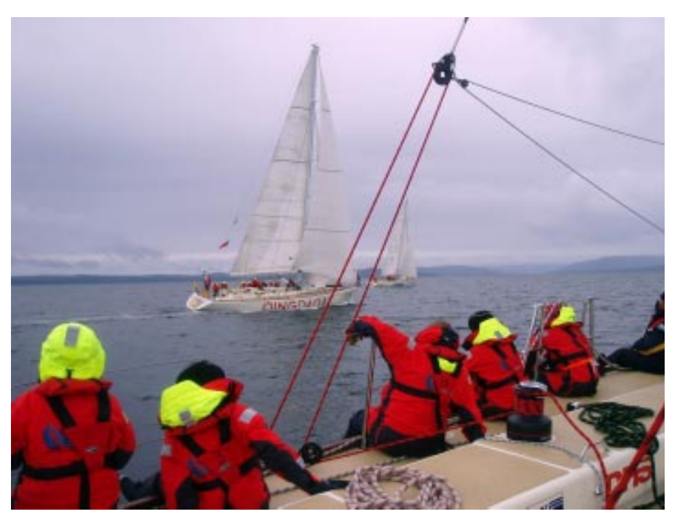
Pre-race training in Scotland (above) The fleet in Liverpool (below)