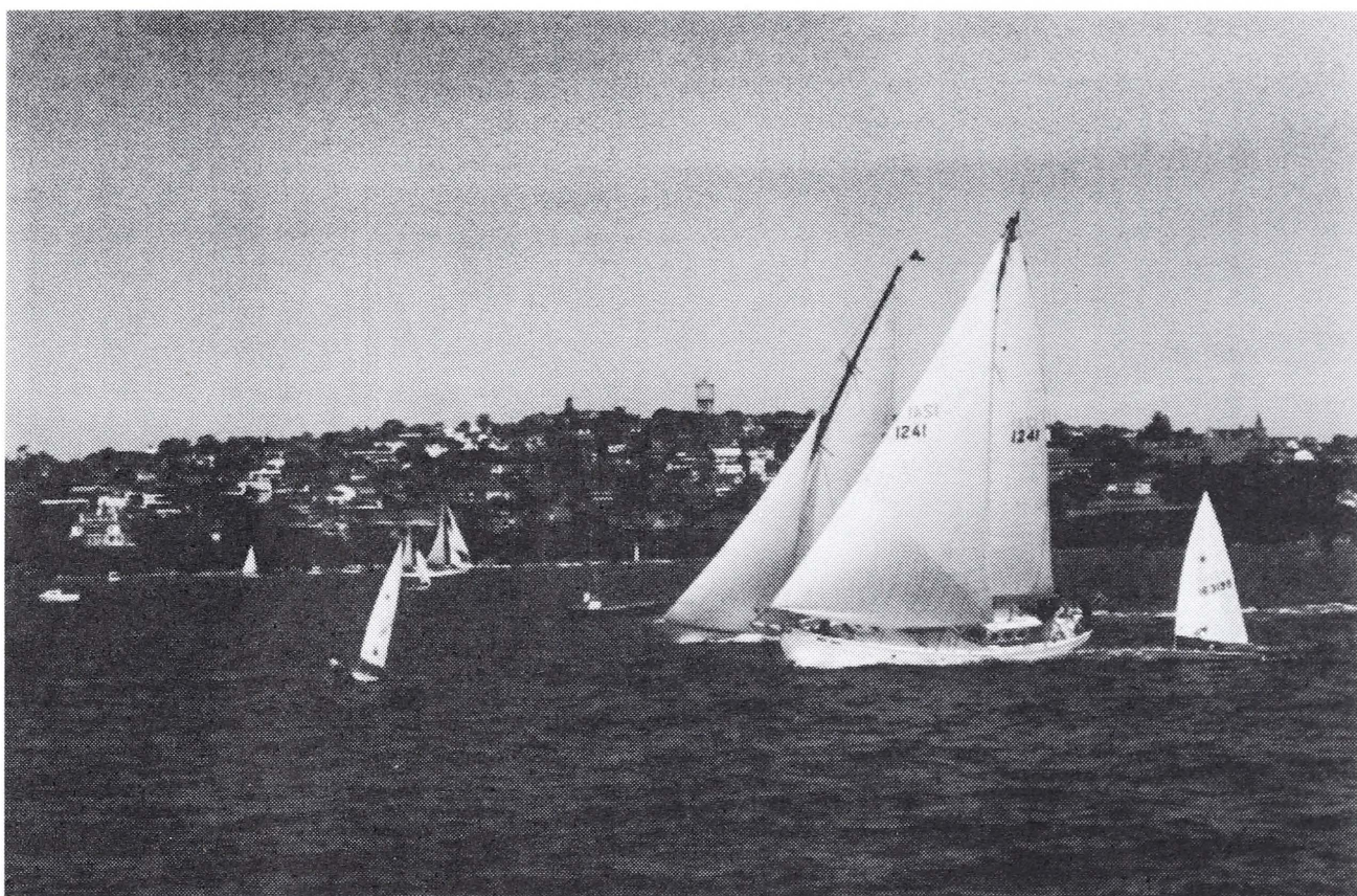
Vintage yachts showing their form. 1241 "Wild Wave" nearest the camera.