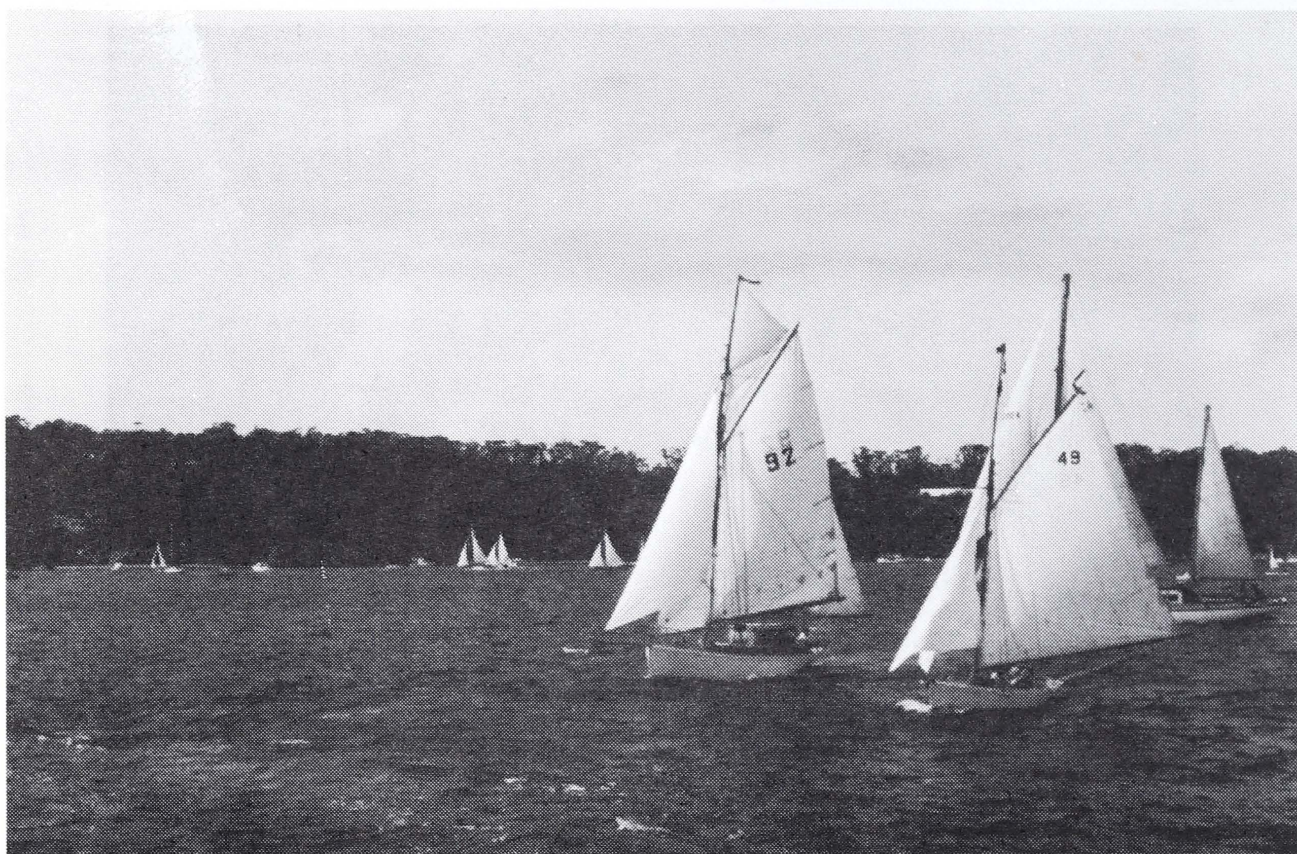
S.A.S.C. National Gaffers Regatta yachts 92 - "Soliloquy" and 49 - "Jenny Wren"