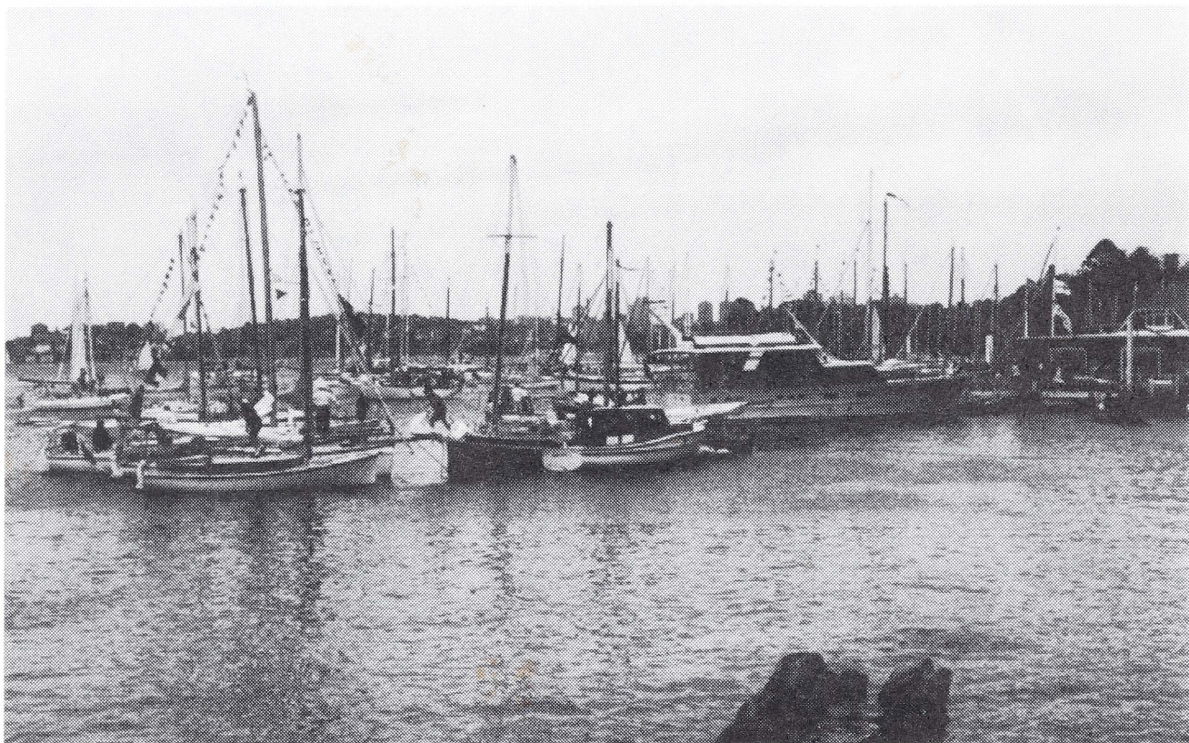
Section of the yachts moored at and around the Club with the official vessel "Silver Cloud 11" at the pontoon.