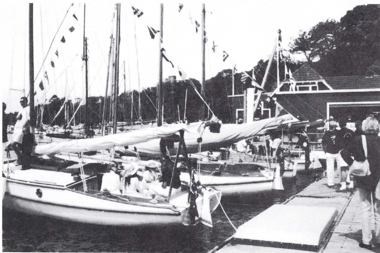
Decorated yachts at the Club.