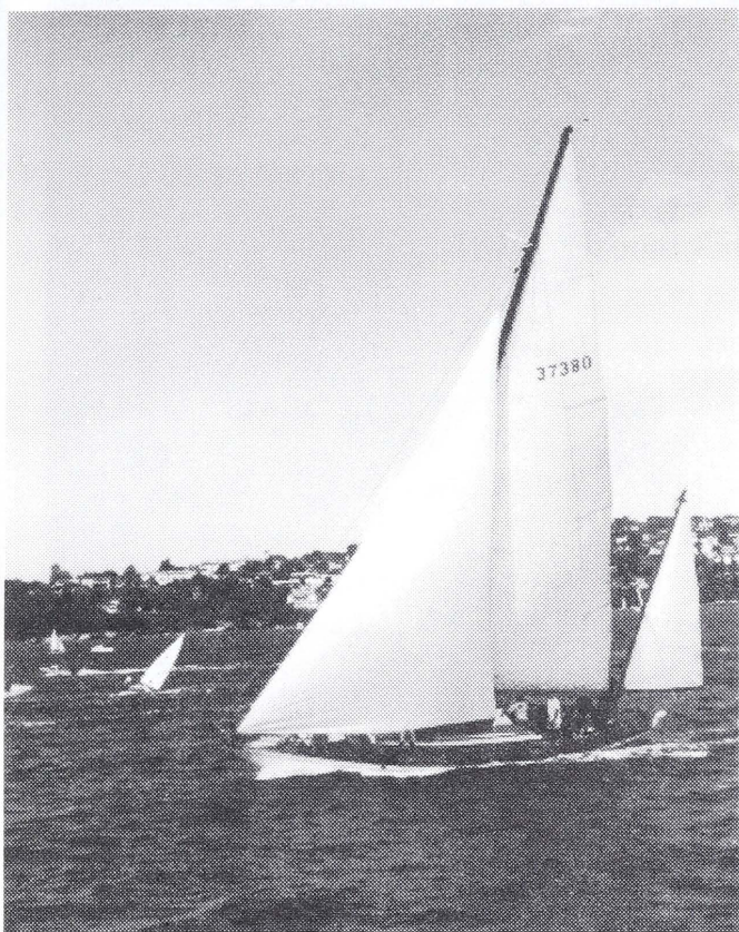
Vintage yacht 37380 "Egret" in full sail.