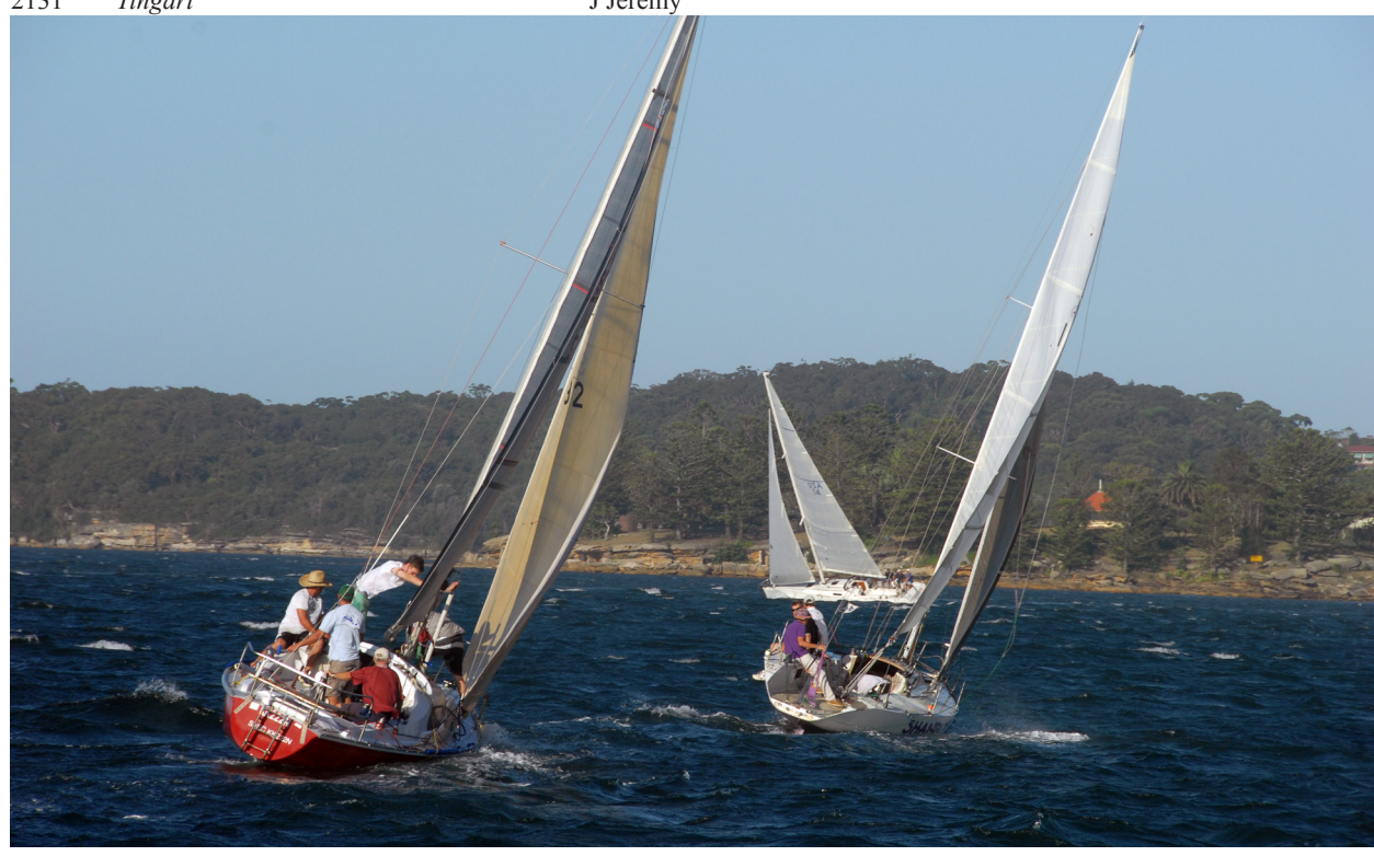
Clewless? and Shambles beating to windward during a Paul Slocombe Trophy Race