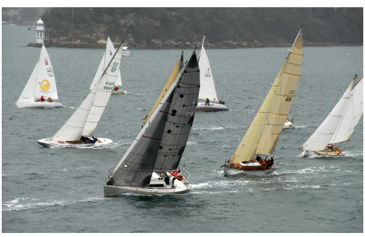
The Club Championship fleet underway at the conclusion of the 2010–2011 season