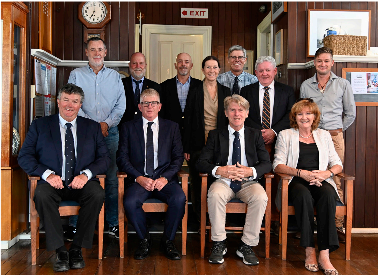
Directors of the Sydney Amateur Sailing Club 2020–2021

Front Cover: Zara leading Shambles after the start of Division 1 in the Twilight race on 26 February 2021