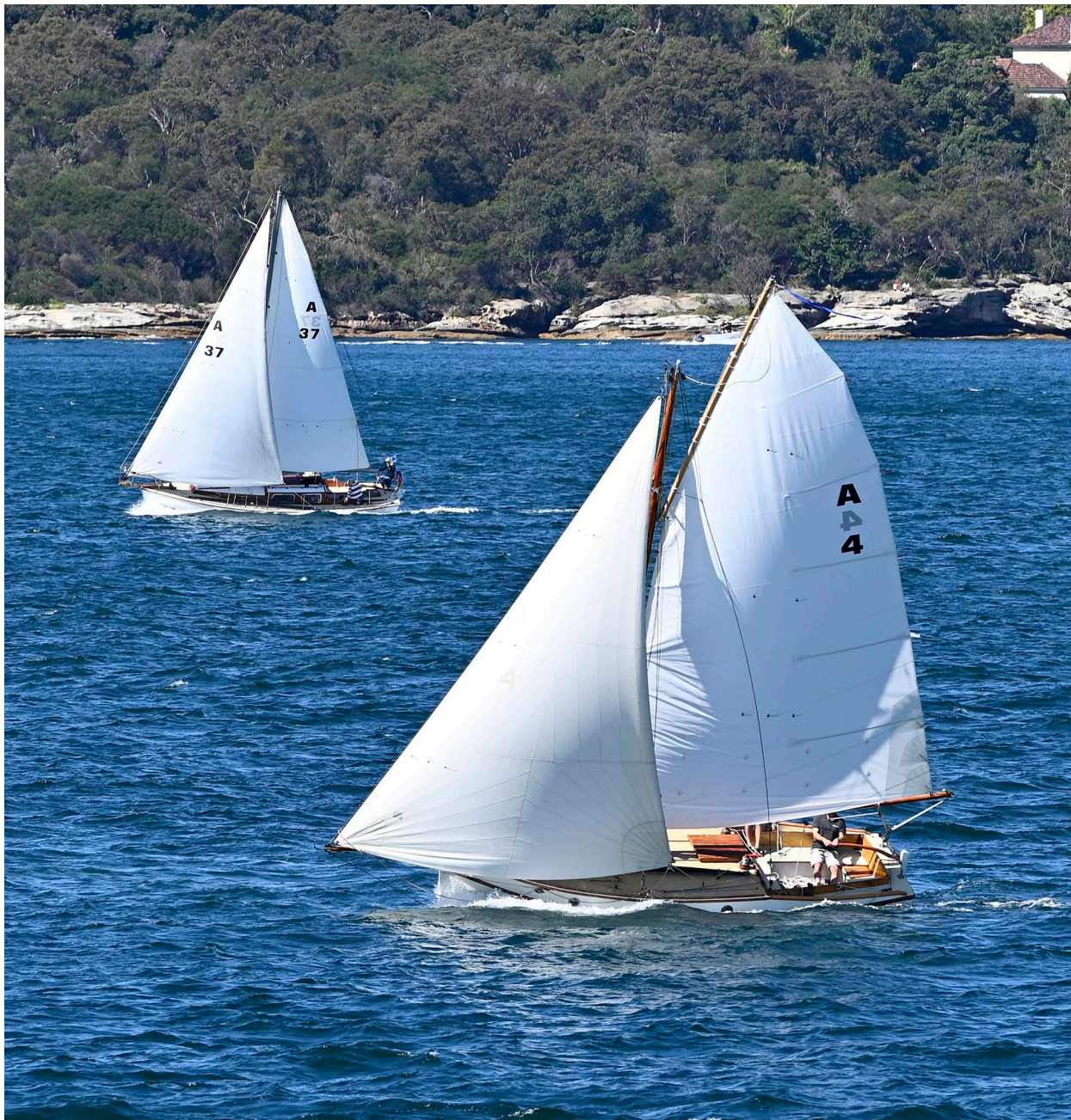
Warana (A37) and Cherub (A4) enjoying a Sydney north-easterly breeze