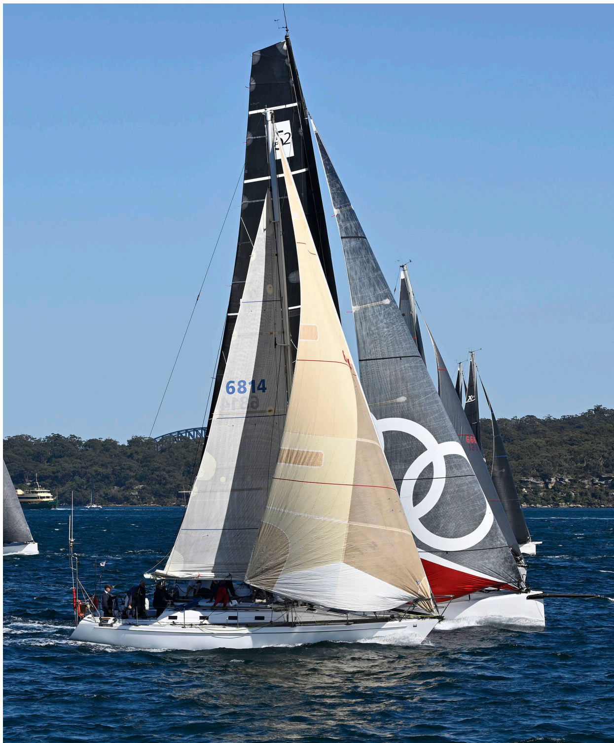
A dramatic start in the 2021 Lion Island Race