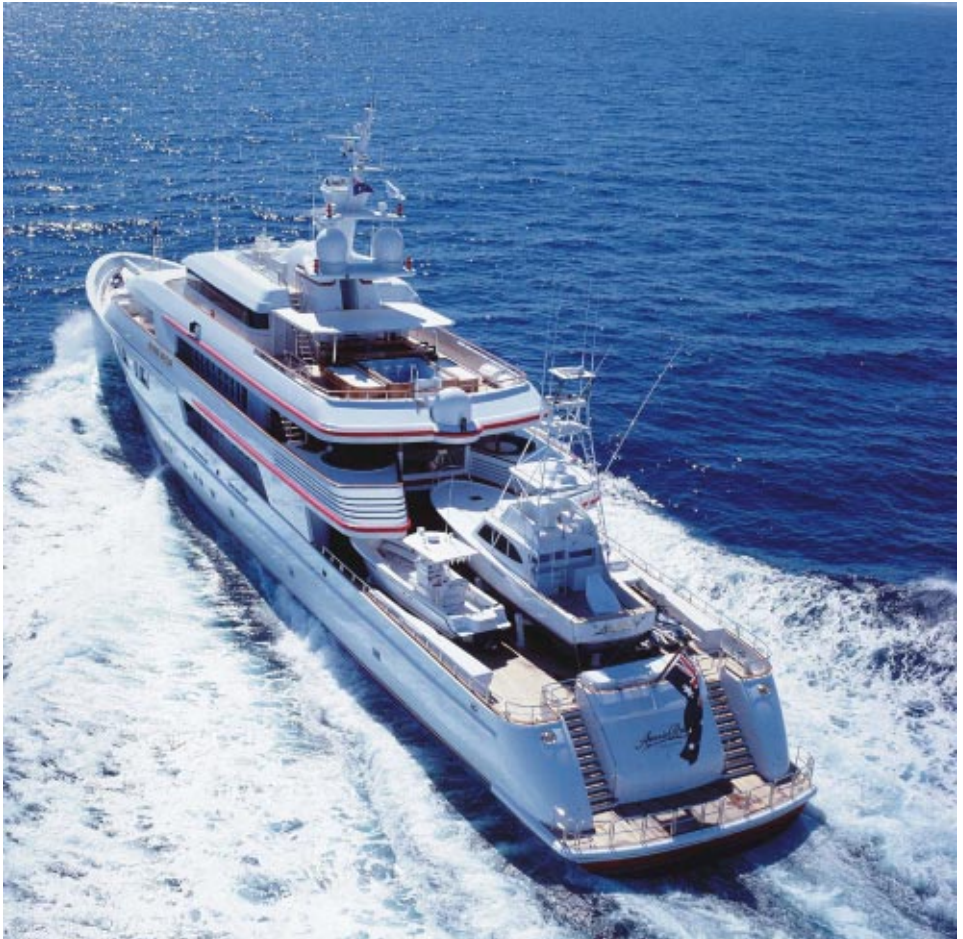
Aussie Rules on sea trials