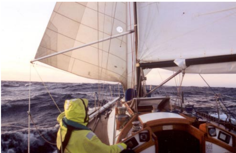
STRAPPED DOWN... rigged and ready for a hard night's running