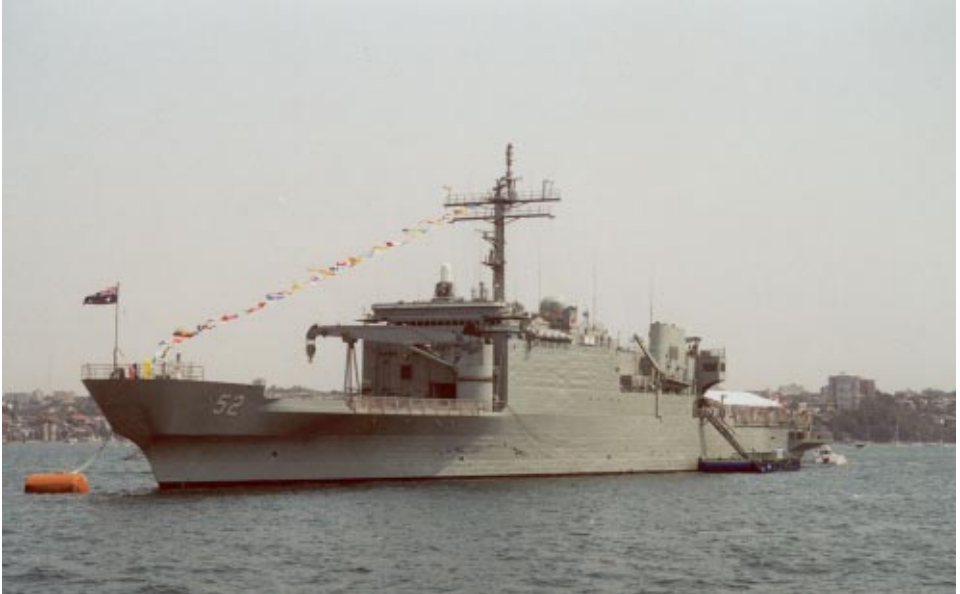
HMAS Manoora , flagship of the 167th Australia Day Regatta, 26 January 2003.

It used to be called a race — but is now more of a stately procession. The Ferrython, now a controlled parade of ferries, underway off Bradleys Head on Australia Day.