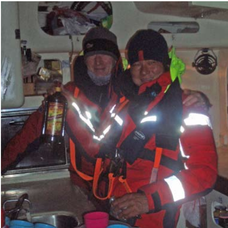
A nip of rum as we crossed the international date line was in order

We set off into a headwind (again) of about 25 knots and beat into that for the next five days or so. Crossing the line mid fleet and falling back to 8th we then elected, once clear of our turning mark, to head off on a starboard tack while the rest of the fleet headed off on the port tack.