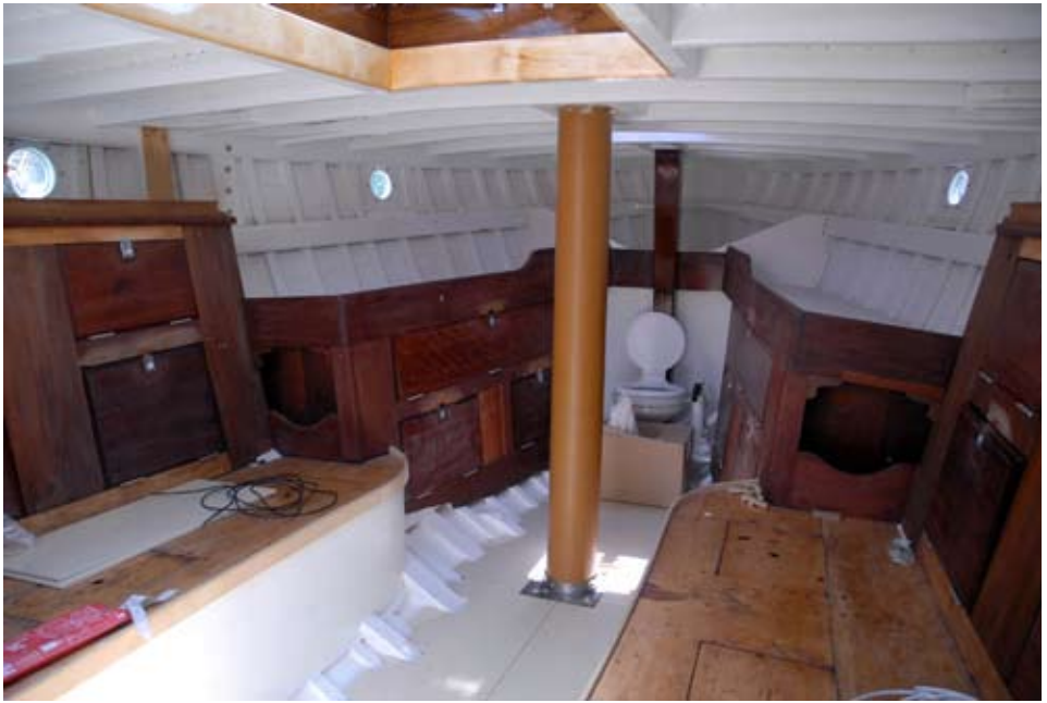
Maluka is quite roomy down below. There was still quite a bit of work to do when these photos were taken on 11 December