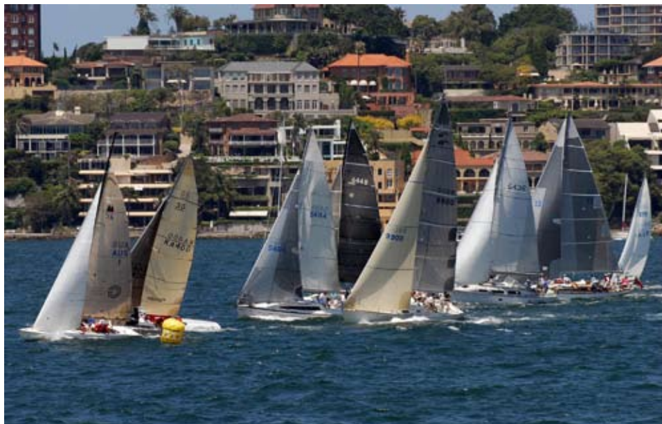
A fine fleet of 86 boats started in the 171st Australia Day Regatta on a perfect Sydney Summer day. Division 2 boats cross the start line (above)

Shortly after the Classic Division start, Sylvia , Reverie , Redpa and Gumleaf (A40, Orion Alderton — the winner in the division) beat to windward (below)