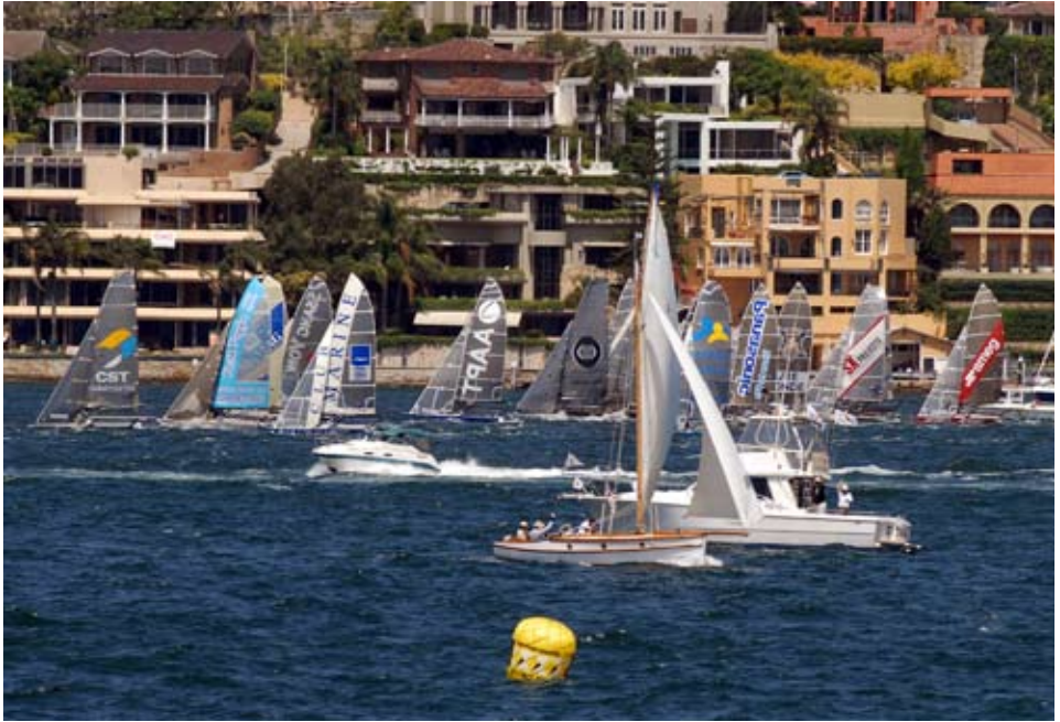
Ranger crossing the finish line as the modern 18-footers start in the background (above)

Duyfken (below), South Passage , James Craig and Endeavour (right) were a spectacular sight in the Tall Ships race as the north easterly gusted in a 20 knots