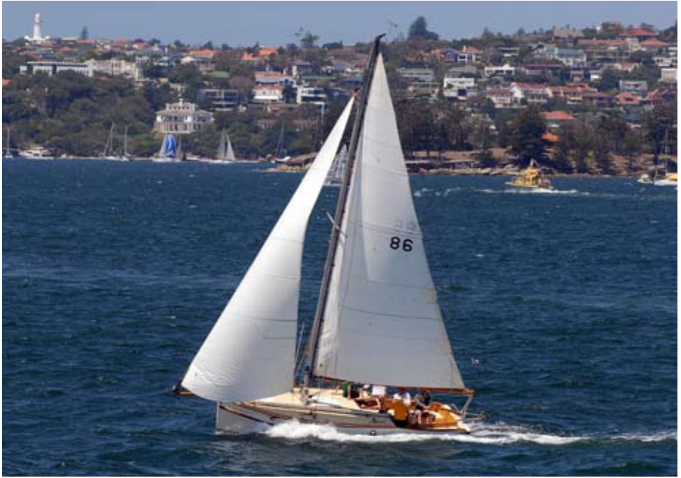
Cherub (Peter Scott) enjoying the north easterly on Australia Day (above)

Some water for the cockpit for Lolita as she passes the Flagship on Australia Day (below)