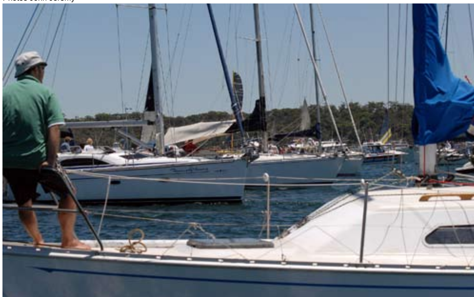
The spectator fleet lined up expectantly (below)