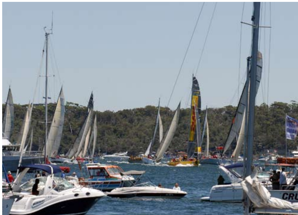
The Start — the big boats cross the line as the gun goes off. Maximus (before her mast became minimus , right) made a fine sight as she tore down the Harbour (above)