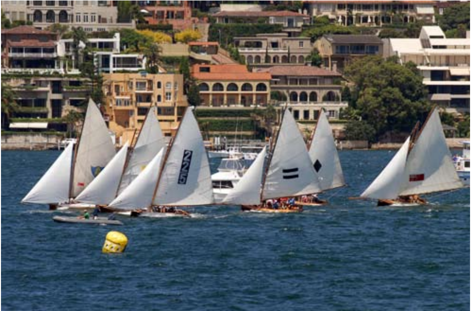
As usual, the historic skiffs made a fine sight during the Regatta, and all finished except Australia , which capsized near the flagship HMAS Manoora and attracted the attention of some very capable Water Police (below)