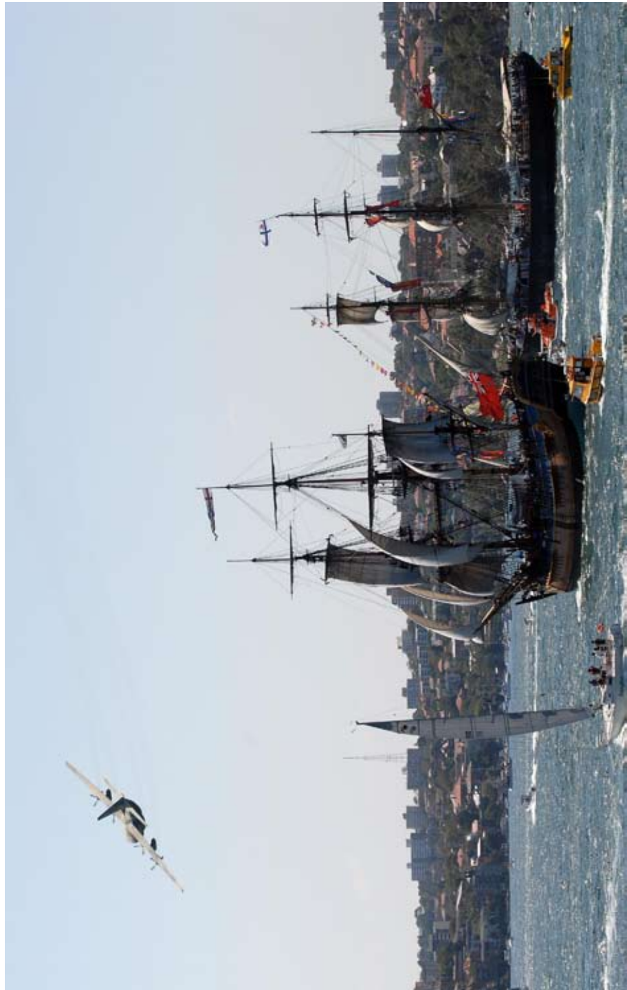
The RAAF displays were very well received by everyone around the harbour on Australia Day. Having dropped the Red Berets into Sydney Cove, the Hercules made a low pass over the Tall Ships — seen here with Endeavour and James Craig