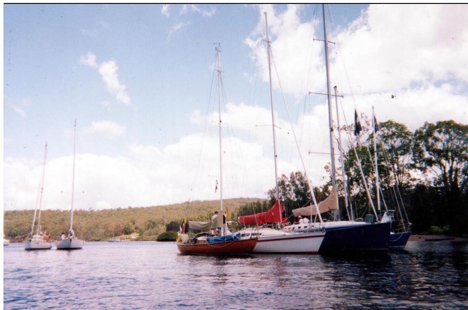
The raft up at Nelligen — Celeste , Farr Horizons and others

Bate Bay with the wind a bit fresher and Celeste back to sixth. Day three, the passage race, a glorious nor'easter and, like last year, a run down the coast to Jarvis Bay, the mandatory storm, and (this year) a westerly reach to Batemans Bay. Seventeen hours for the course. The trip was so comfortable that one of our crew managed to sleep for eight hours! We had to wake him so he could see the finish. Again sixth on PHS.