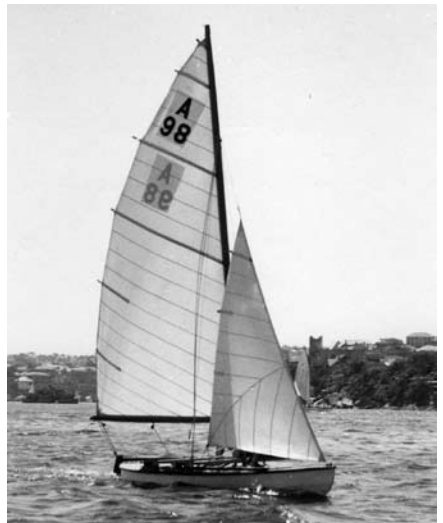
A Payne-Mortlock canoe sailing with the SASC. The yacht in the background is Ranger