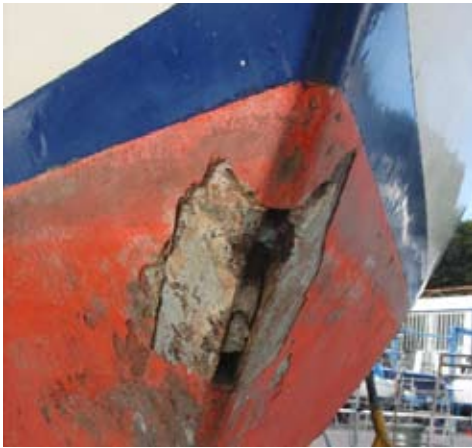
Nerida filled through the damaged stem plate (below)

All it needs to sink even the most well-found boat is a sequence of bad luck. Not until the yacht was drained and propped up on the hardstand did a thorough inspection reveal the cause of the disaster.