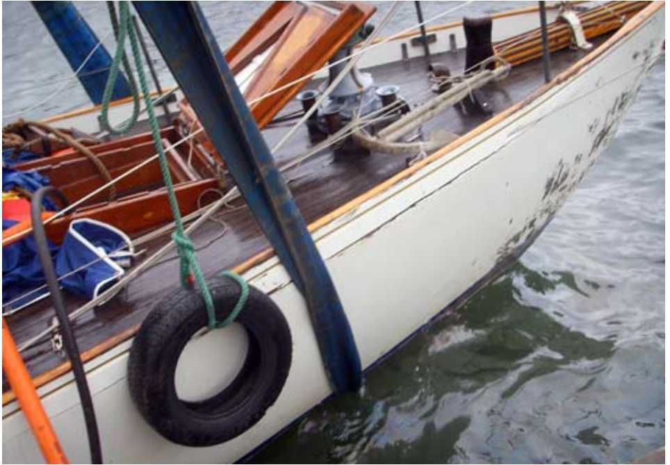
Lifting force cracked the bulwarks (above)