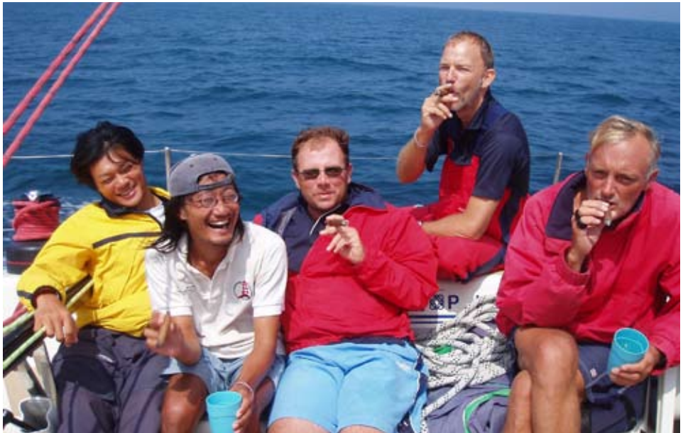
Tying the Knot

The race start was again overcast, wet and cursed with light winds. This was definitely becoming a recurring theme. Our race this time was a short one taking us north west from the Channel Islands, around Lands End on the south western end of England before heading northwards up the Irish Sea and into the port of Holyhead in Wales. We coaxed our boats through the challenging tidal conditions of the Channel Islands before once again heading into the western section of the English Channel and making for Lands End.