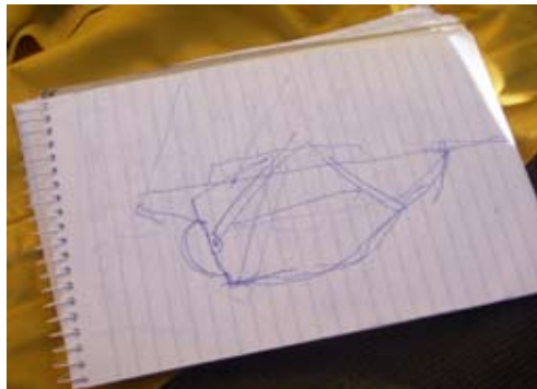
The author’s sketched recovery plan

With the whole rig in position the crane driver slowly took up the slack while we waited for the diver to report from below on how Nerida was ‘hanging’. The news wasn’t good. The slings were compressing the upper topside strakes and threatened to crack the bulwarks at the deck join once the crane lifted the hull clear of the bottom. The obvious solution was to reconfigure the rig with athwartships spacer bars. There were only two difficulties with that approach.