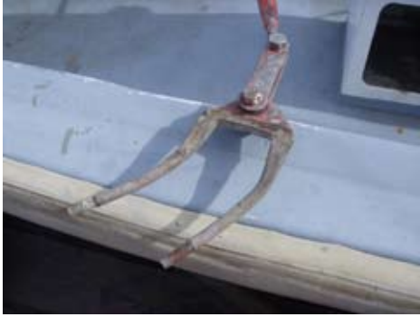
Lower bobstay bolts pulled out (above)