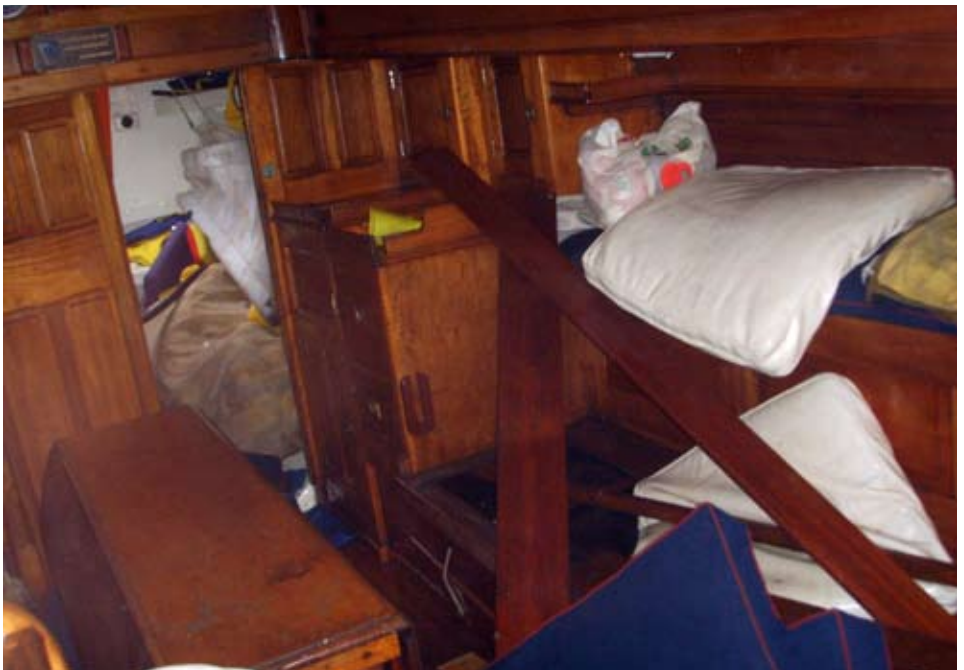
The slimy, foul-smelling chaos below (below)