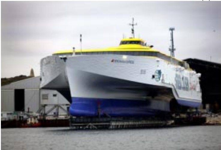
The large trimaran ferry Benchijigua Express ready for launching in Western Australia (left and opposite)