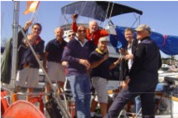
The crew from EZ Street and Bright Morning Star sharing their relief that they are not responsible for the on-board fur balls

Elapsed time: 03:17:36:24 — 60th overall — 7th on PHS