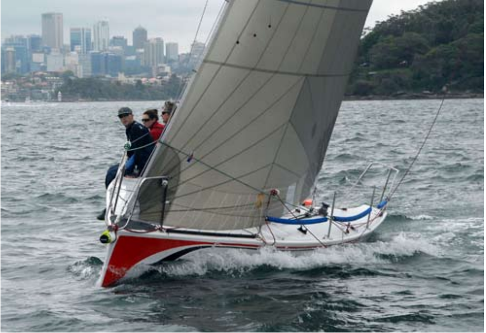
Crews keeping a sharp lookout in Diana (above) and Arrow Voice and Data (below)