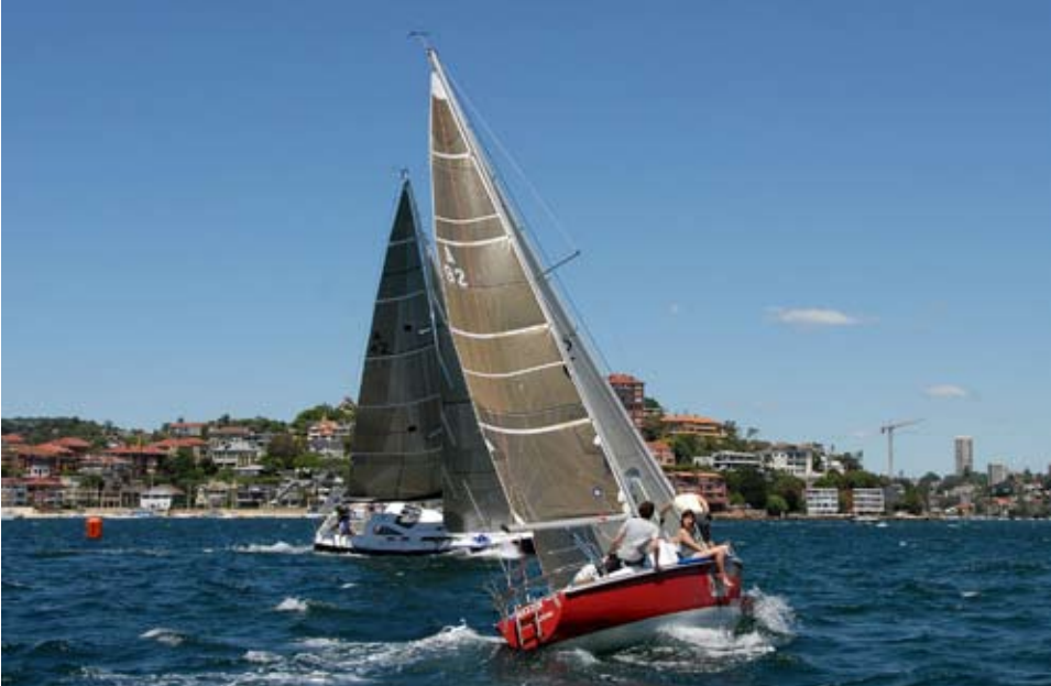
Port tack starts — Degrees of Freedom crosses Clewless? in the Division 6 start (above)