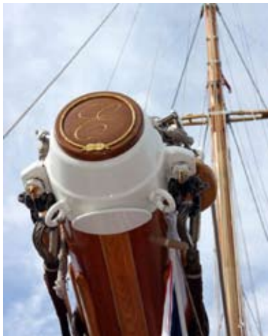
Attention to detail on Eleonora main boom

Each yacht is an unspoken seminar on the power of unified design, and tangible proof that the overall impact of true excellence will always be greater than the sum of its individual parts.