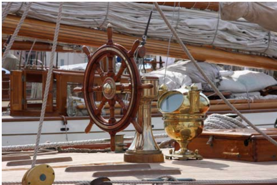
Helming position invokes sense of command