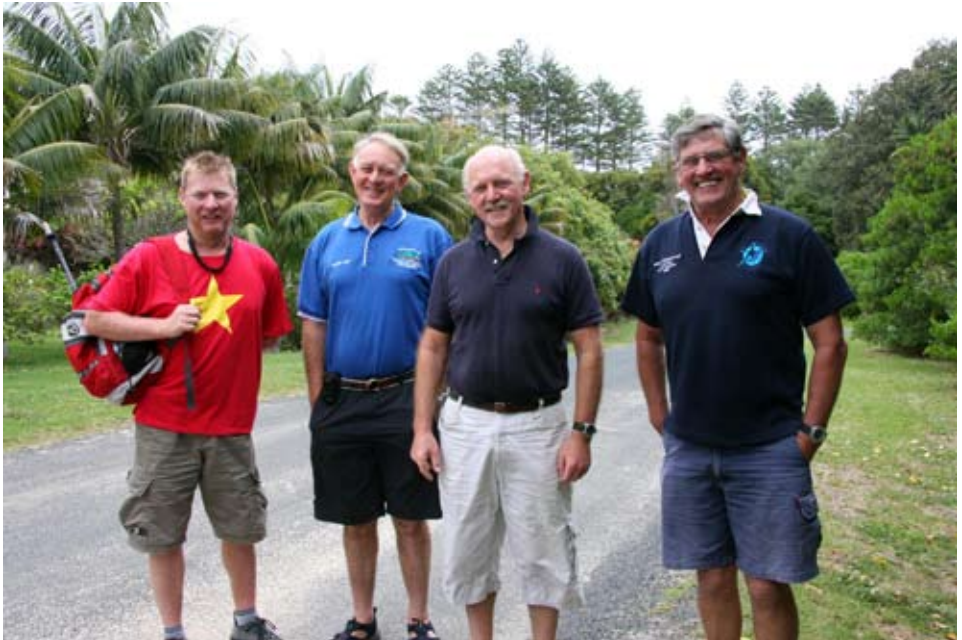
Assorted Azzurons meander back from an island breakfast