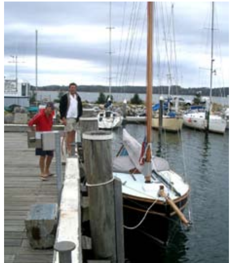
Vanity in Batemans Bay