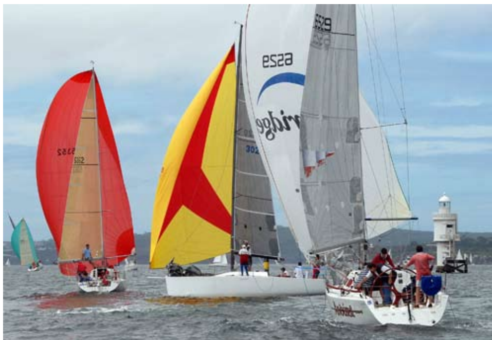
On the run — Buck , Hickup and Anduril (above), Very Tasty (below)