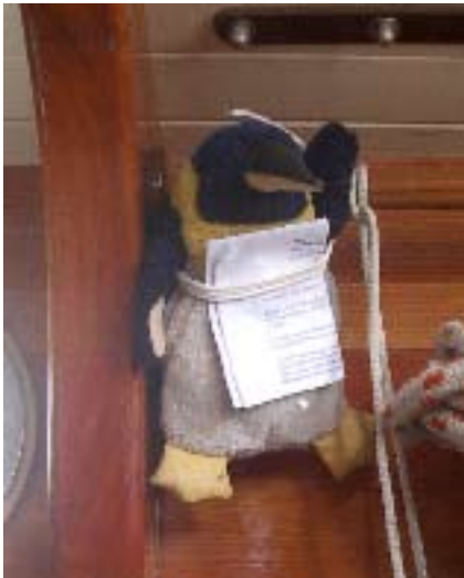
Ajax, the Very Important Penguin, on duty