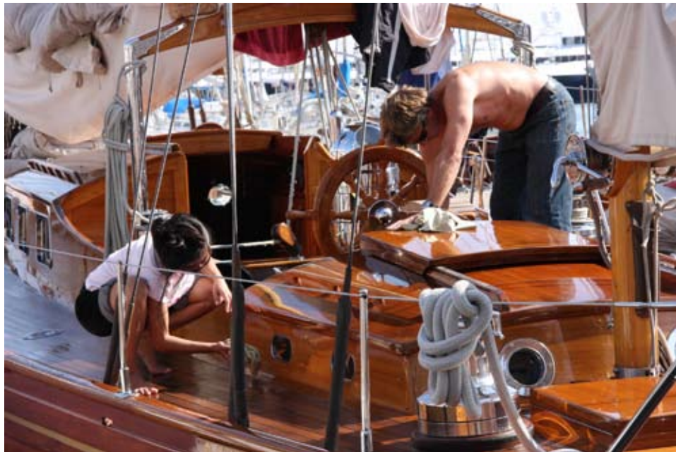
Polishing duties never end