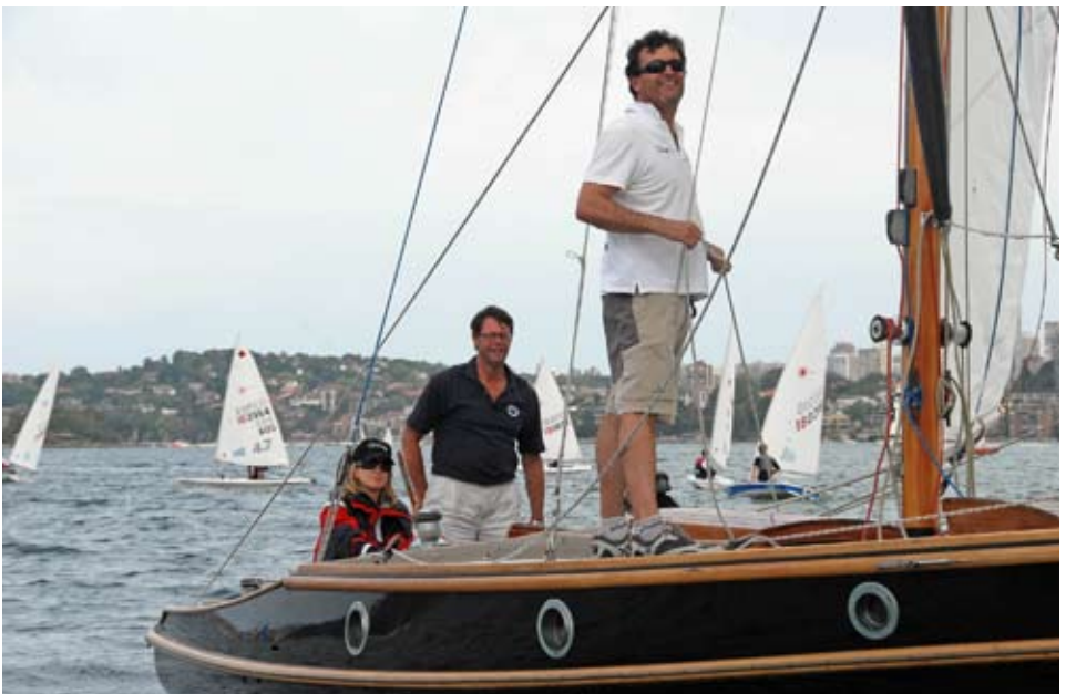
Ahh! That's better! The happy faces at the finish are further proof, if we need it, that we should all go sailing more often