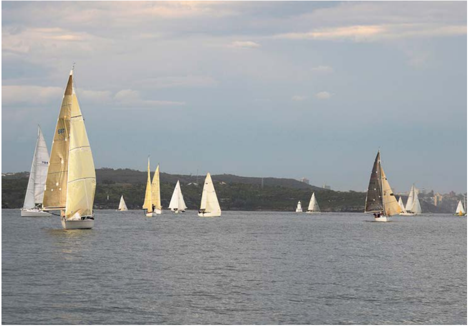
Because of the dying wind, the course was shortened at Shark Island (above)