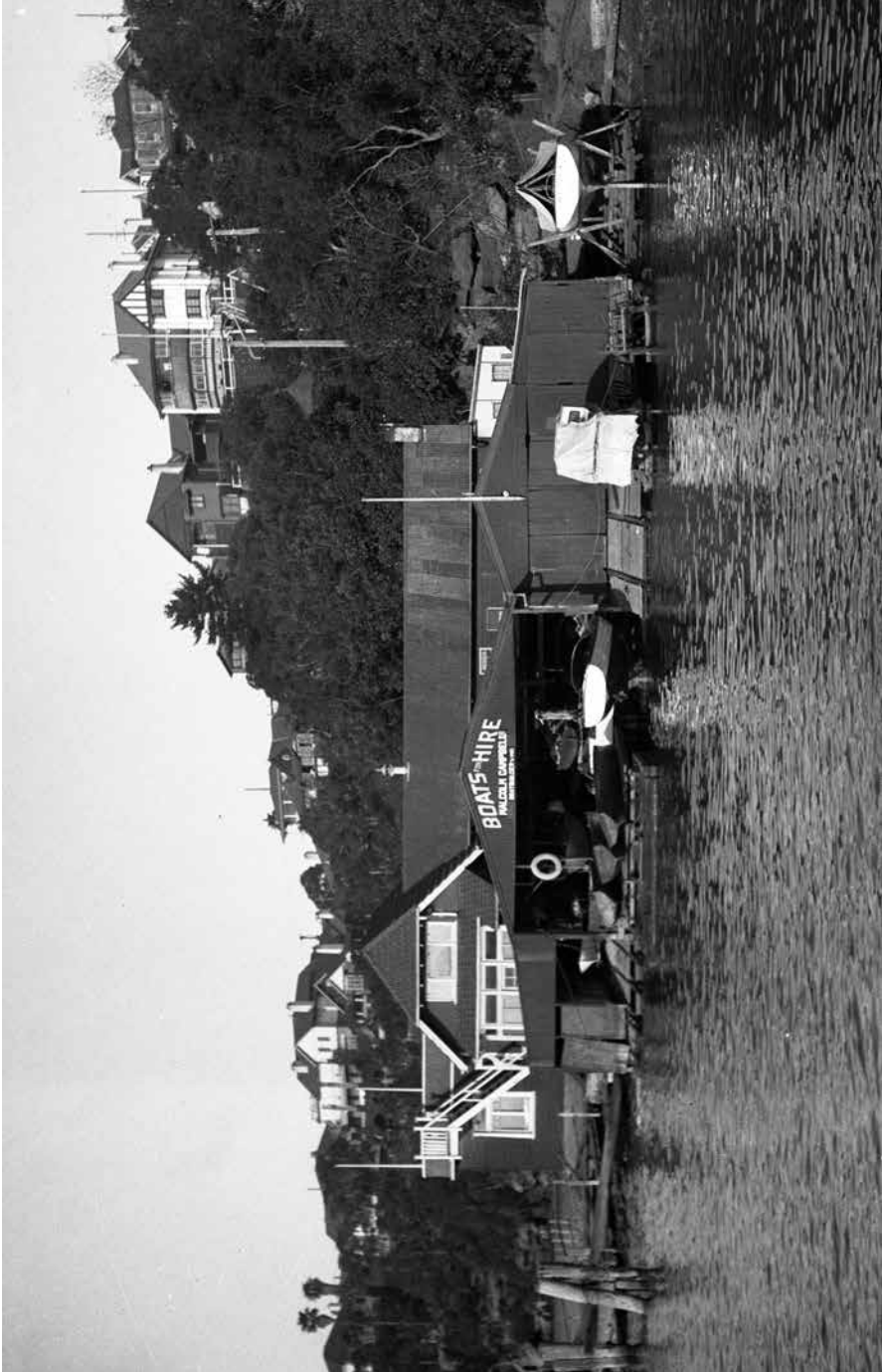
Royal Australian Historical Society