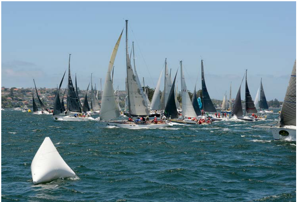
Start line 3 at the starting gun (below)