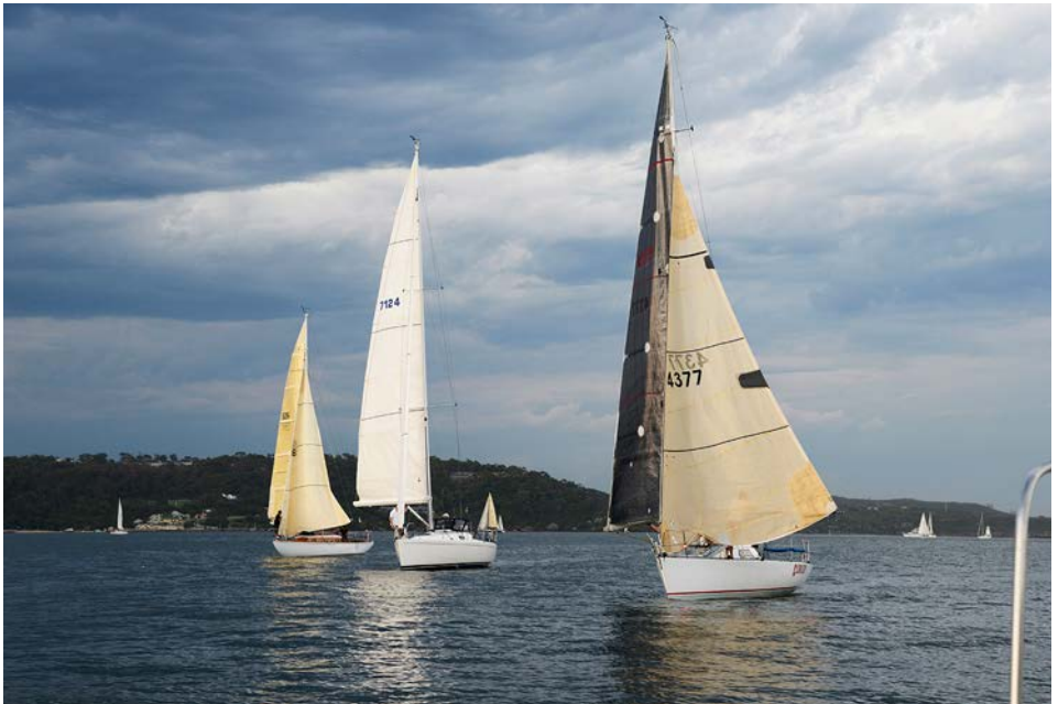
Tanami , As You Do and Clewless? drifting to the finish (below)