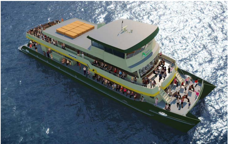
An impression of Sydney's new ferries

The ferries will service all inner harbour routes, from Watsons Bay in the east to Cockatoo Island in the west, and will use new wharves such as Barangaroo which is expected to be completed in 2016. They will also be used to replace some older vessels in the fleet.