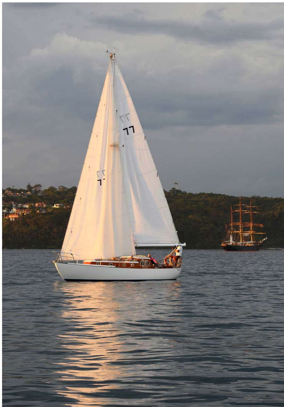
Anitra V had more help from the tide than the wind as she crept to the finish on 5 December