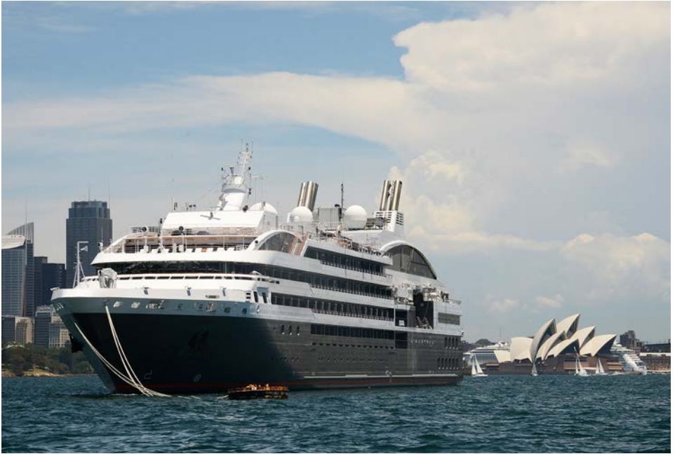
The small cruise liner L'Austral visited the Athol mooring on 4 January

The super yacht Secret , owned by the heiress of the Walmart fortune, was a visitor to Sydney over the Christmas/New Year holiday period. She was built in 2013