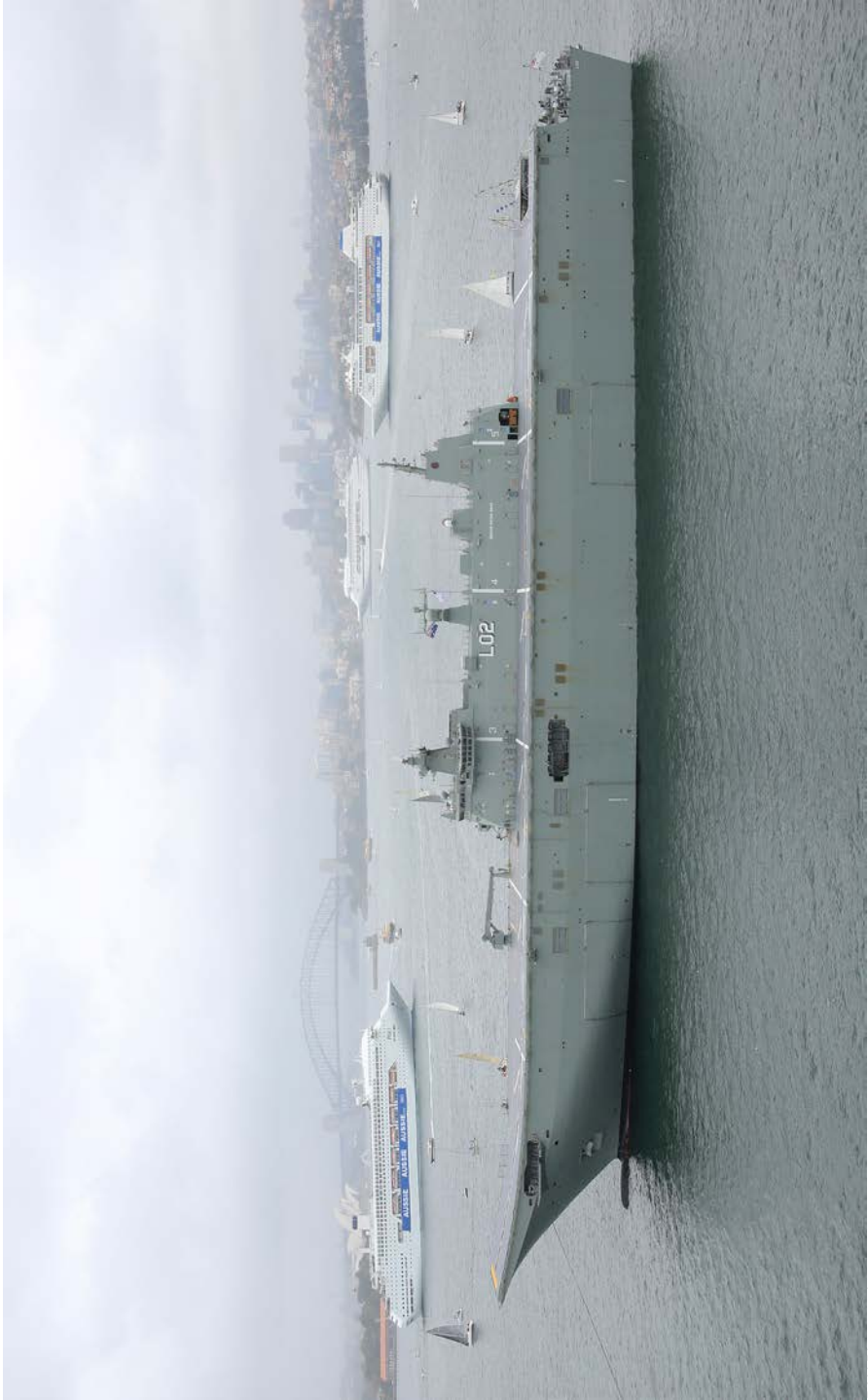
HMAS Canberra secured to the Point Piper mooring as Flagship of the 179th Australia Day Regatta