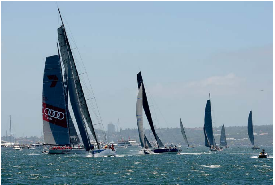
The big boats manoeuvring near start line 1 as the start time approached (above)