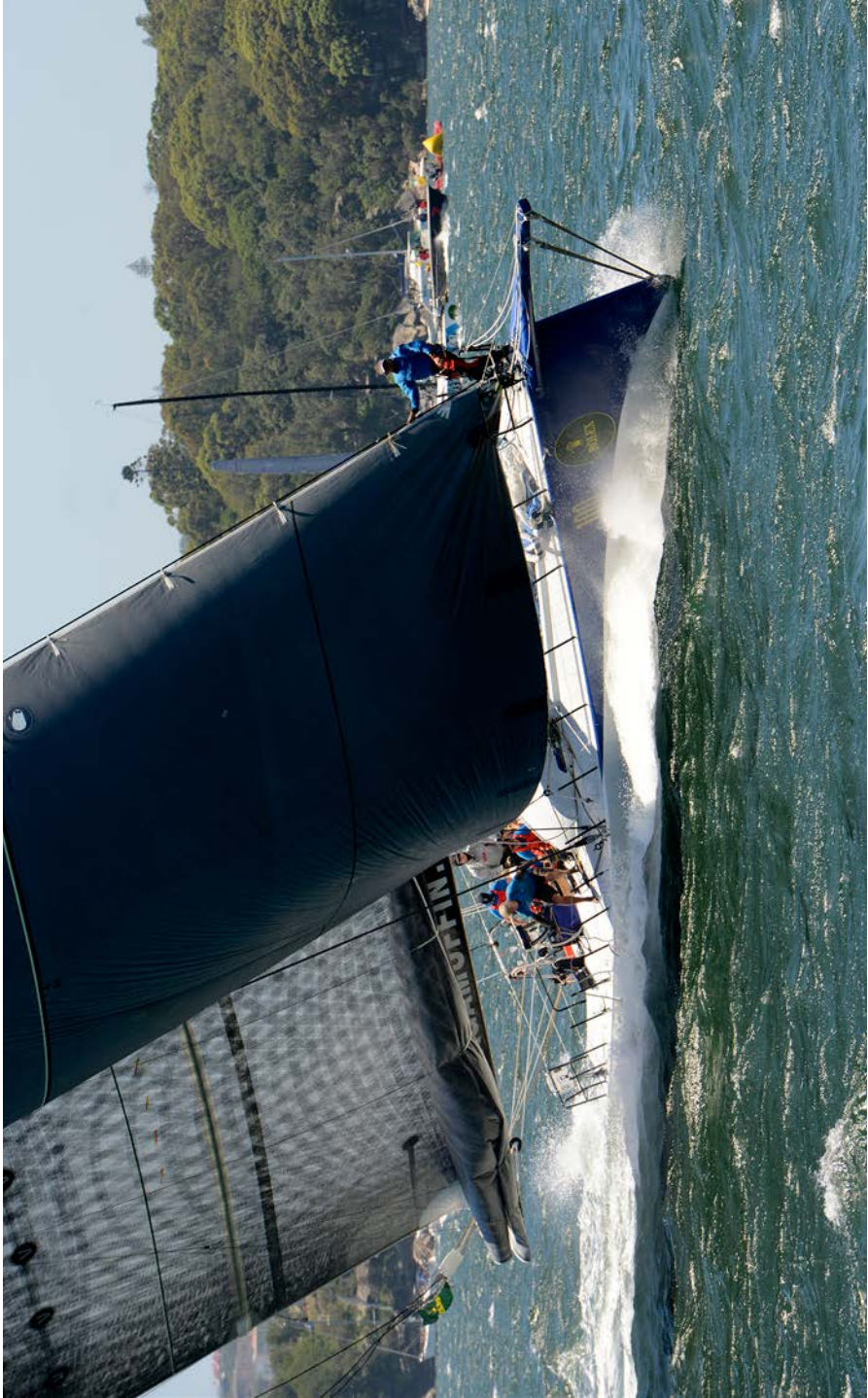
Ragamuffin 100 showing off her power and speed before the start of the 2014 Rolex Sydney to Hobart Yacht Race