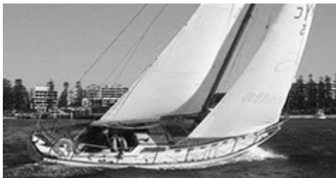
Laurent Giles 33' - $35,900