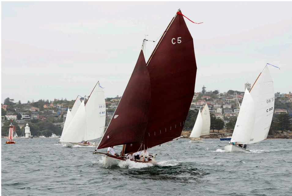
Tio Hia showing Couta boats the way to the finish