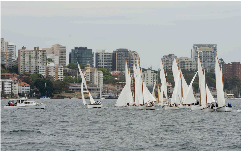
The start of the Couta boat division