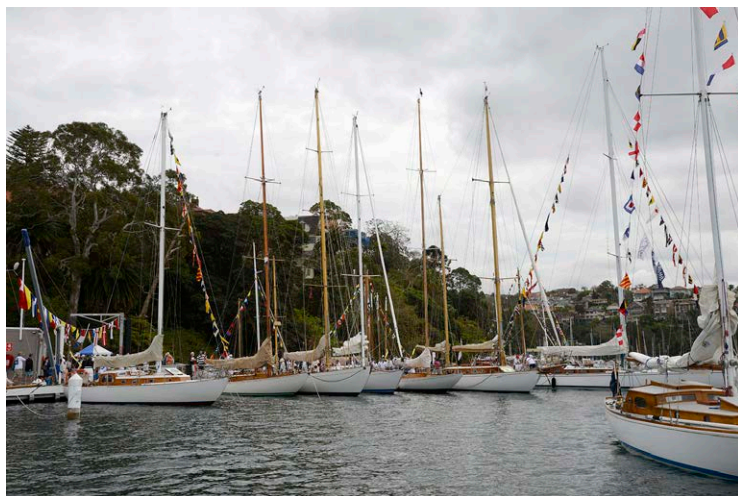
A forest of classic masts at the pontoon