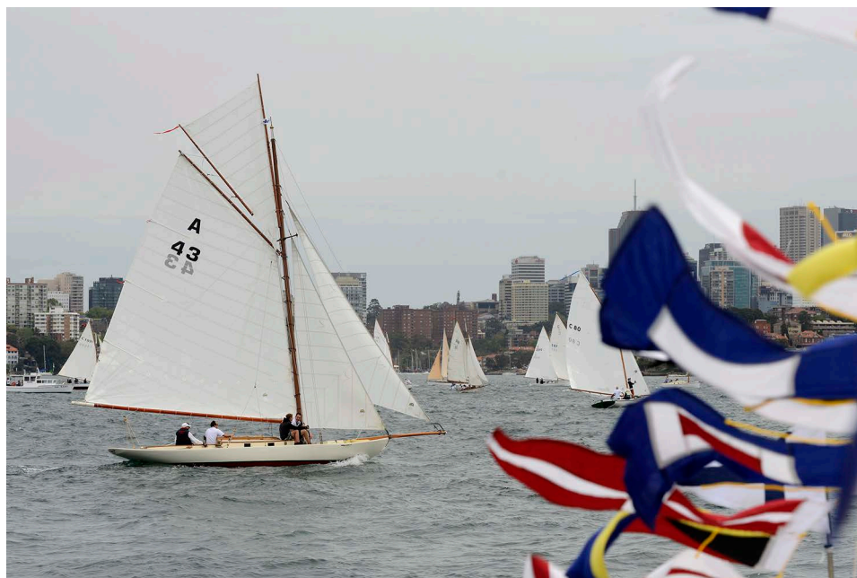
Caprice before the start