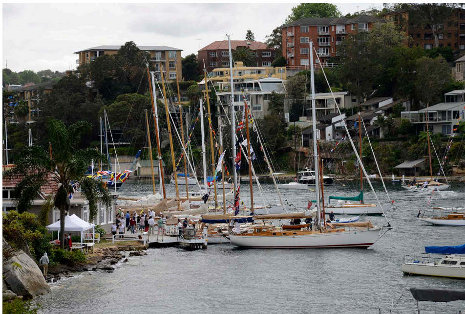
A spectacle of classic yachts in Mosman Bay as the boats arrived at the SASC