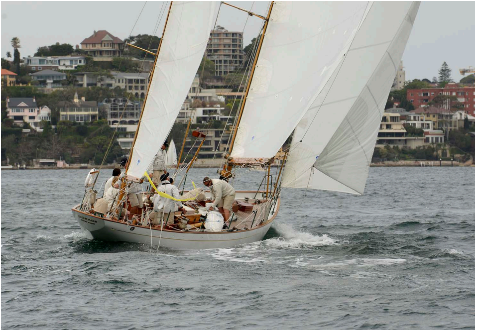
Dorade reaching to Clark Island