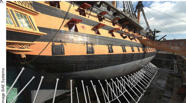
An impression of HMS Victory 's new hull supports

HMS Victory is the oldest warship in the Royal Navy's fleet and is the flagship of the First Sea Lord, Admiral Sir Philip Jones KCB ADC. The restoration project is due to be completed in 2018.