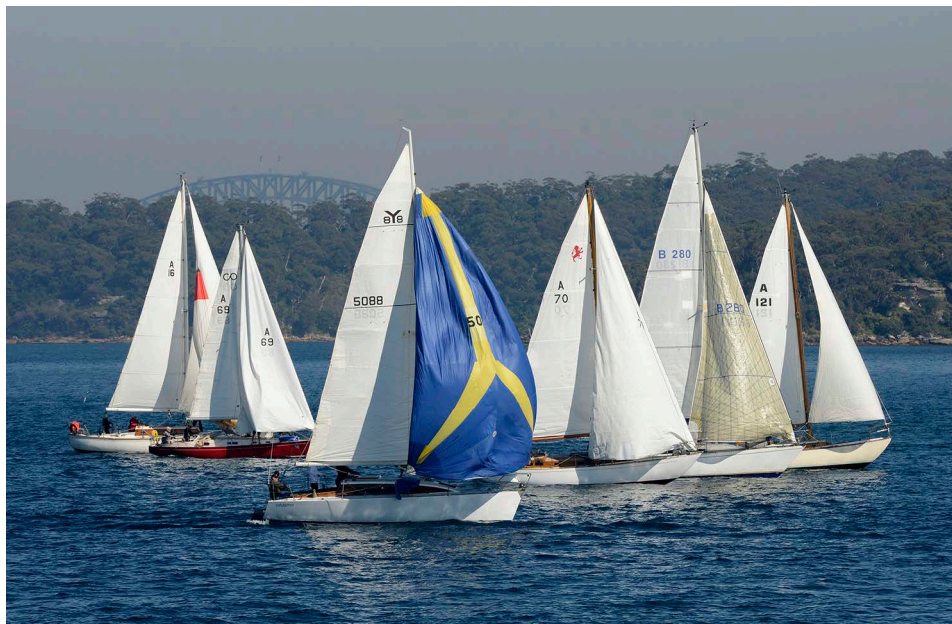
Mister Christian, Lunacy, Indulgence, Malohi, Spindrift and Lahara shortly after the Division 2 start