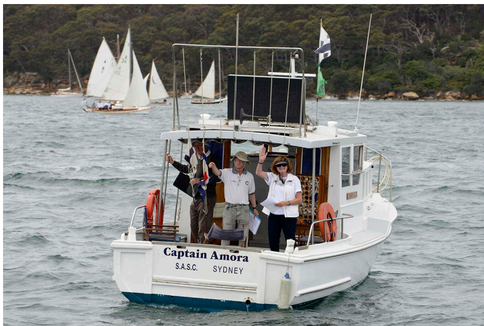
Captain Amora and crew ready for action