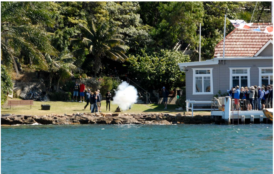
The usual retort and cloud of smoke from the Les Arduin Trophy cannon set the new season well and truly in motion