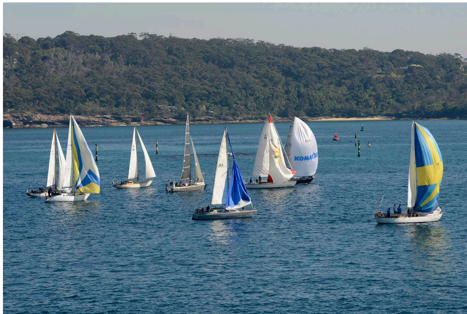
Competitors struggling to get to reach the Heads in the very light conditions. Fortunately the wind improved at sea