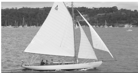
Windward - $65,000