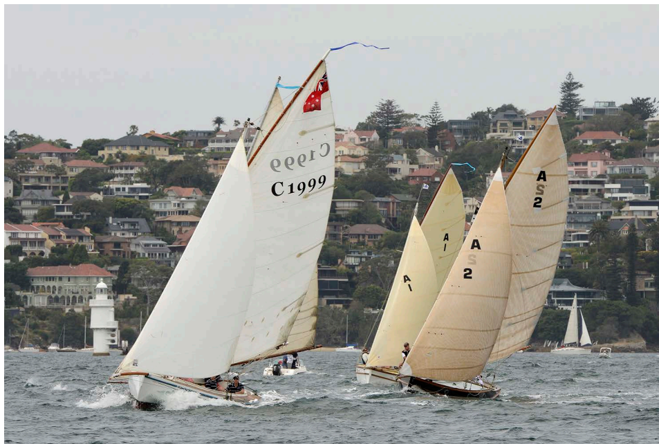
Rob Roy, Ranger and Vanity