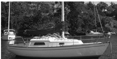
Swanson 27 - $25,900