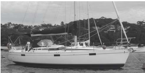
Beneteau Oceanis 390 - $99,000