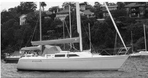
Northshore 310 - $69,000