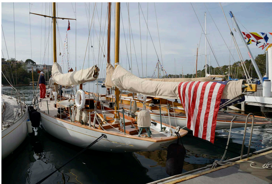
Dorade at the pontoon