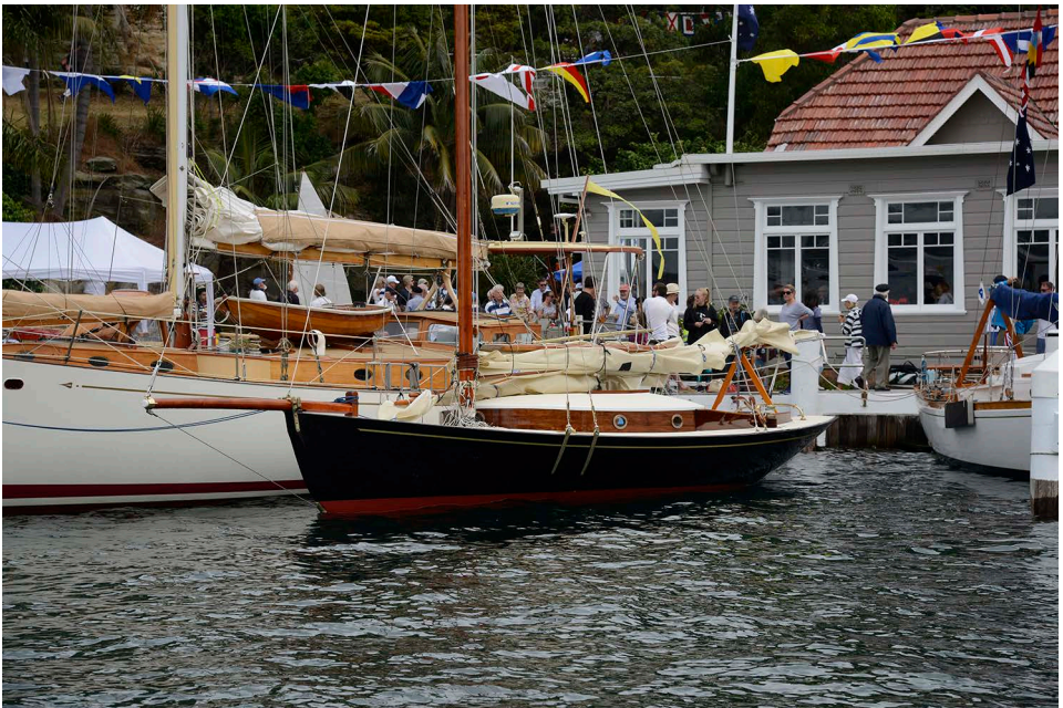
The beautifully restored Rana