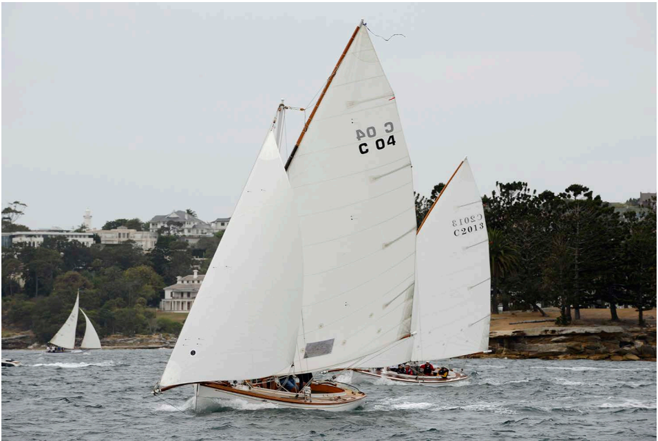
Tenacity and Barra