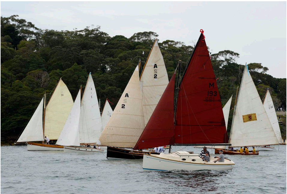
Becalmed inside Bradleys Head