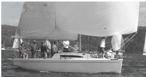
Northshore 369 - $124,900