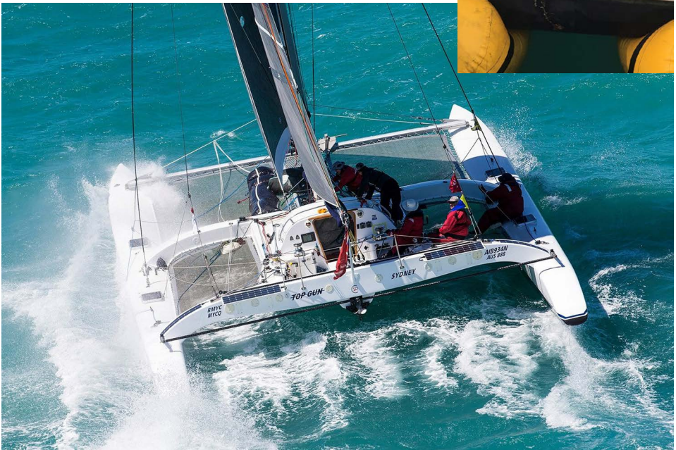
Top Gun at speed