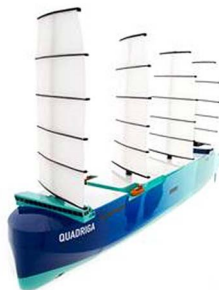
A model of the Quadriga design for the world's largest sailing cargo ship

[Clearly we yachties have been right all along — Ed.]