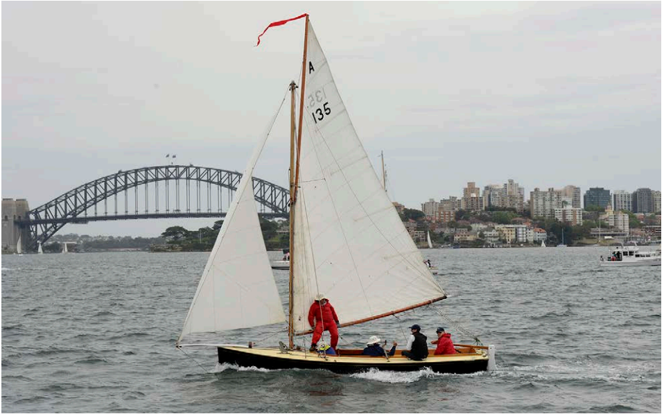
Yeromais V , one of the smaller boats in the fleet