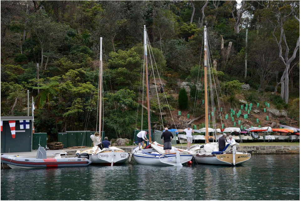
Visiting Couta boats Wattle , Couta Tah and Cariad preparing to get underway from the Green Shed