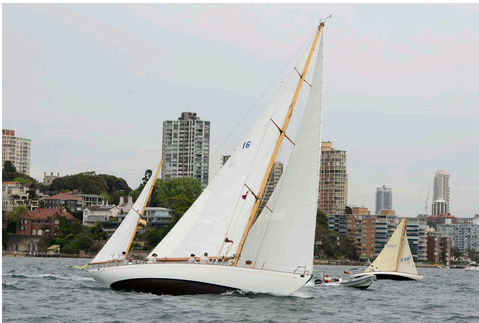
Dorade, with escort, rather overshadowing Lady Luck