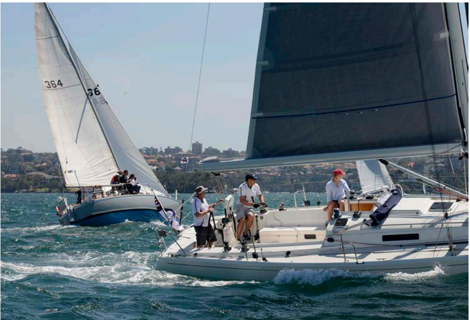
Paper Moon and As You Do beating to the first mark