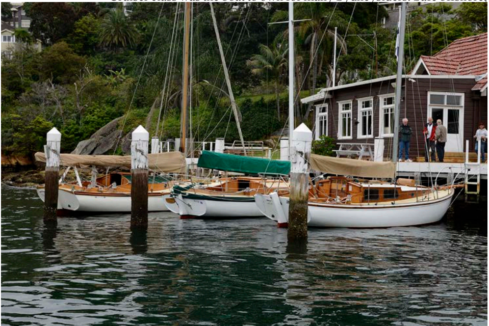
Monsoon, Idle Hour and Warana

Sydney's best designers, builders and racing helmsmen (often the same person) tweaked the lines from the quickest of the open boats and skiffs, putting a lid on top and the necessary creature comforts below. They built them light using the finest local timbers, then they put a lot of canvas on them with overhanging booms and long bowsprits. This was before spinnakers, so a man was content to carry a bit too much rag uphill because it would be needed on the way down. The Amateurs' tradition of powerful boats that were a 'handful' on the racetrack lived on and even some of the open-boat racers eventually succumbed to their charms. However these Jekyll and Hyde boats became immediately docile with a reef in the main when the family was on board. Generous internal volumes and plenty of deck space came with the beamy designs, giving the ordinary working family the ability to enjoy a summer holiday away at the Basin with a berth for everyone. Large cockpits to lounge in and dine al-fresco were a feature. A reliable engine to get the kids back to school on time at the bitter end topped off the package. The Cruiser class was the boat to own for many Sydneysiders. Safe offshore,