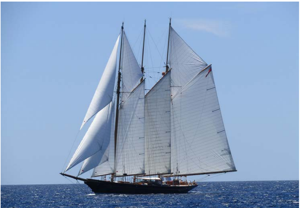
Shenandoah of Sark