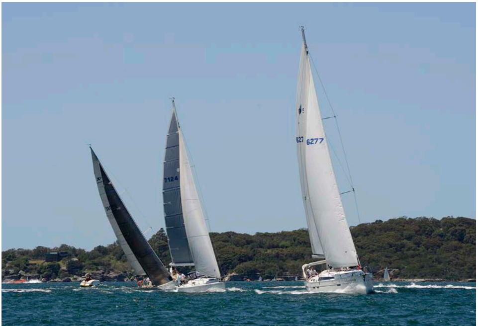
Very welcome RSYS competitors in our Sunday races, Limelight and Solveig II with As You Do approaching the finish on 6 November