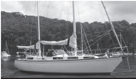
Martzcraft 35' – $65,000