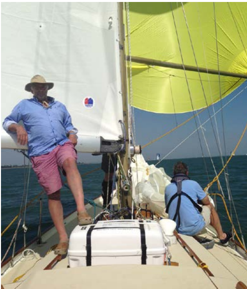
Perfect sailing weather on the Solent