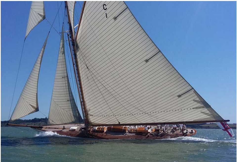
Mariquita sailing on the Solent

The race programme started on the first Sunday with an afternoon race on the Solent, followed on Monday by a 54 n mile race around the Isle of Wight — in the old traditional clockwise direction by going east through the Forts and back into the Solent through the Needles. Further races on the Solent were conducted each day from Tuesday to Friday with two events one day to make up seven races for the week. We had good breezes on all days except one when the race was abandoned due to lack of wind, and one strong wind day when the International 6 and 8 Metre class races were cancelled but the other divisions raced. The weather was sunshine and clear most of the week — pleasantly unusual for southern England! The Brits said that we Aussies must have brought the good weather which started only on the Friday before the regatta. As those who have sailed in the Solent will know contending with the tidal currents is a major part of race strategy on the Solent. We learned fast but were no match for those with local knowledge.