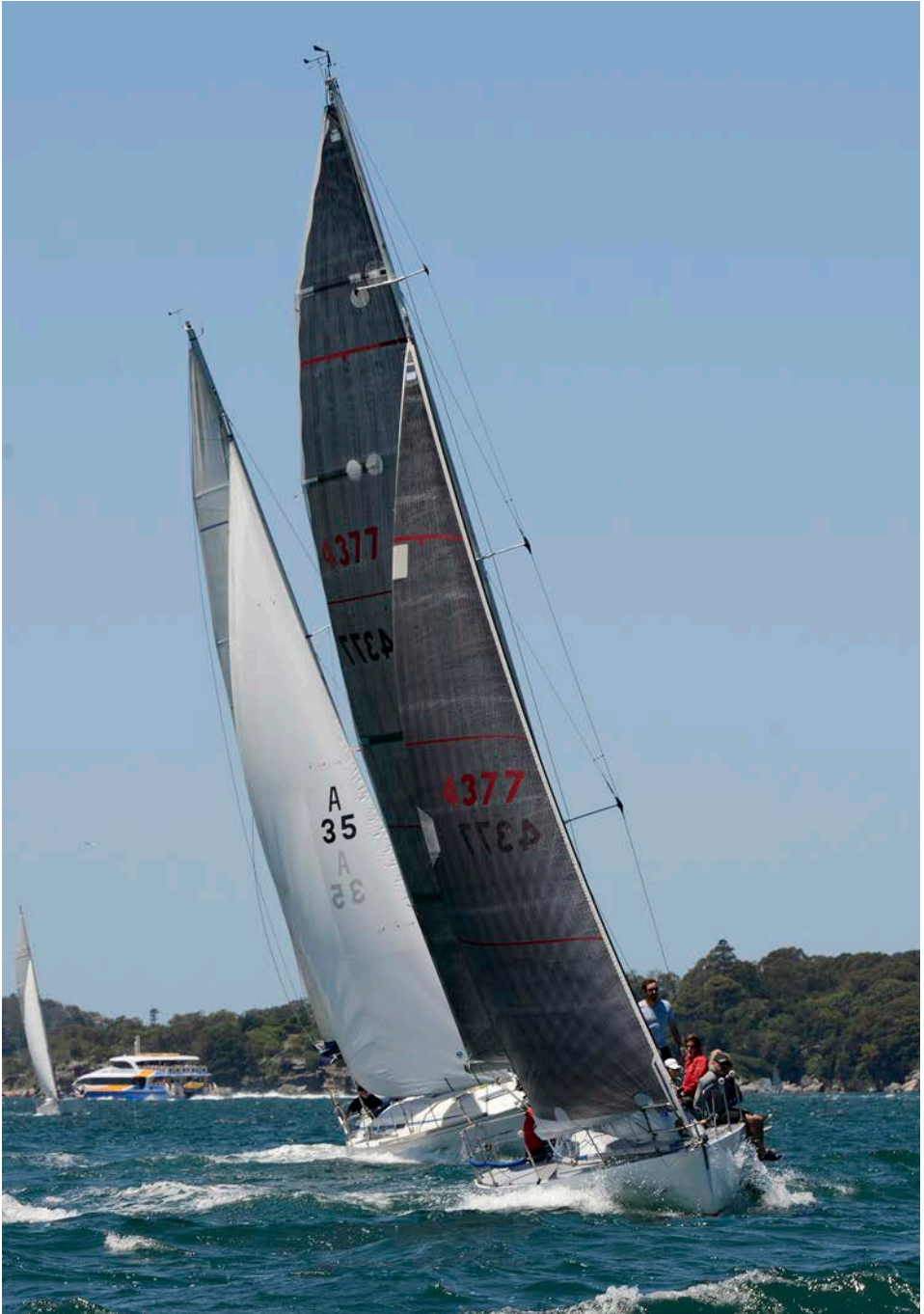
Clewless? and Running Away heading for a close finish on 6 November