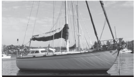
Swanson 38' – $89,000