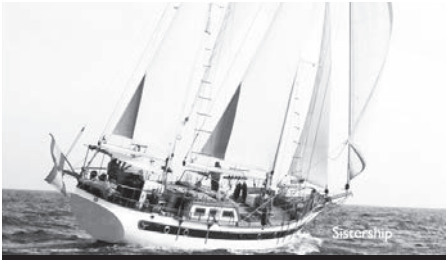
Formosa 51' – $169,000