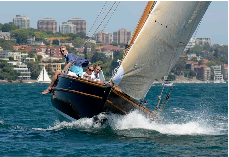
Vanity aiming for the camera