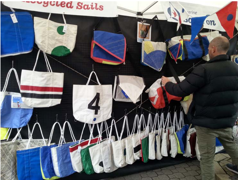
A new use for old sails