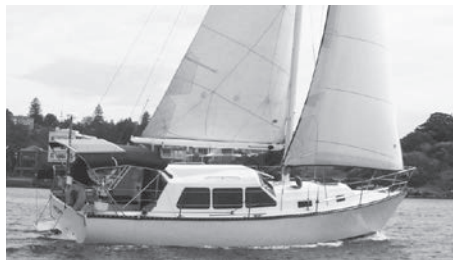
Huon 33' – $110,000