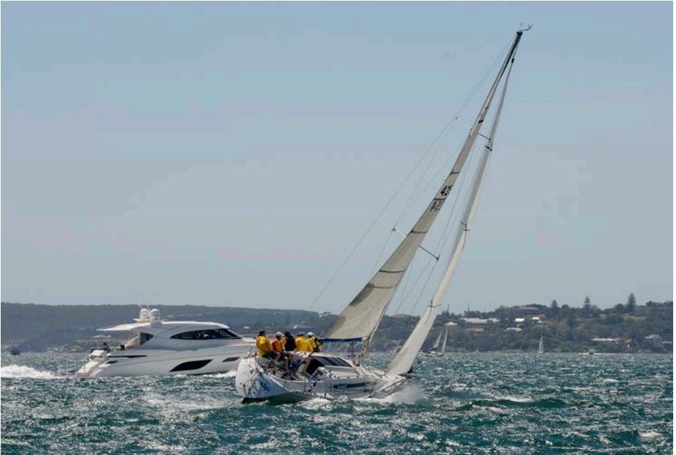
Magic competing for space with one of the many hot-water boats which can be found on the harbour on a sunny Sunday