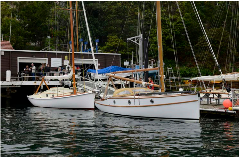
Waitangi and Maluka

The Sydney Amateur Sailing Club was formed in 1872 to cater for a group of non-professional sailors who regularly raced their boats home after a day of fishing at the Blackwall near the Spit. Neither they nor their craft conformed to the Squadron’s toffee-nosed decrees and they took a ‘fair go for all’ larrikin pride in that fact. Our Club’s proud tradition of providing an affordable sailing home for all people from all walks of life and its particular history of fostering and preserving our homegrown Sydney Harbour design classics, springs from our founders’ quintessential disdain for forelock tugging of any variety. In