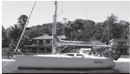
Delphia 40' – $195,000