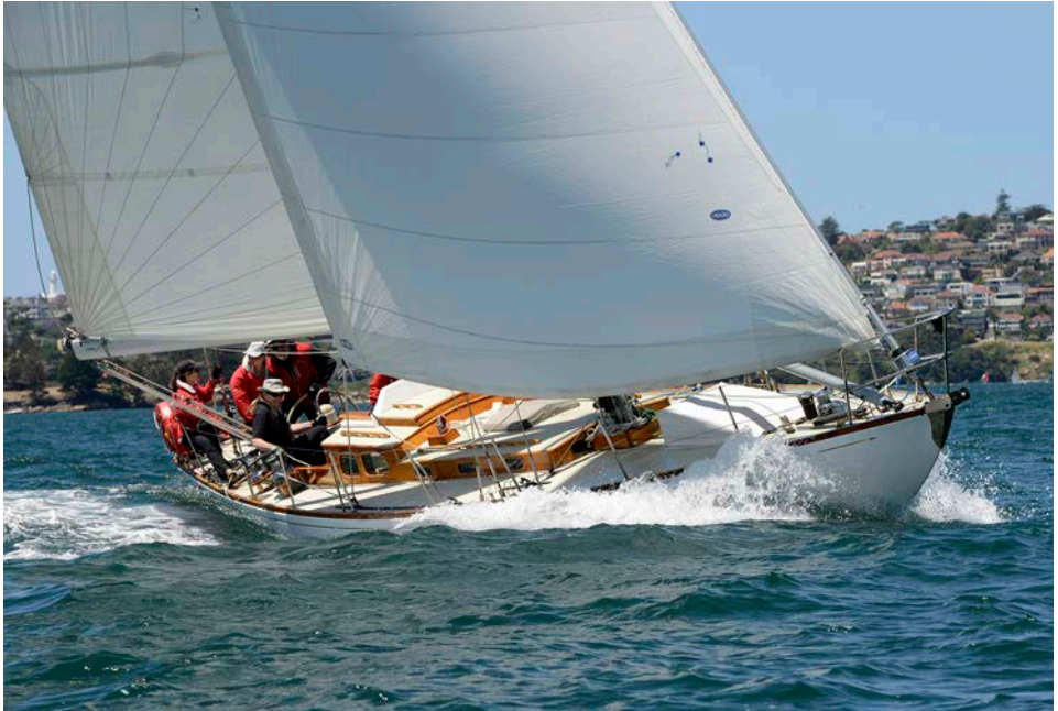
Caprice of Huon revelling in a beautiful breeze