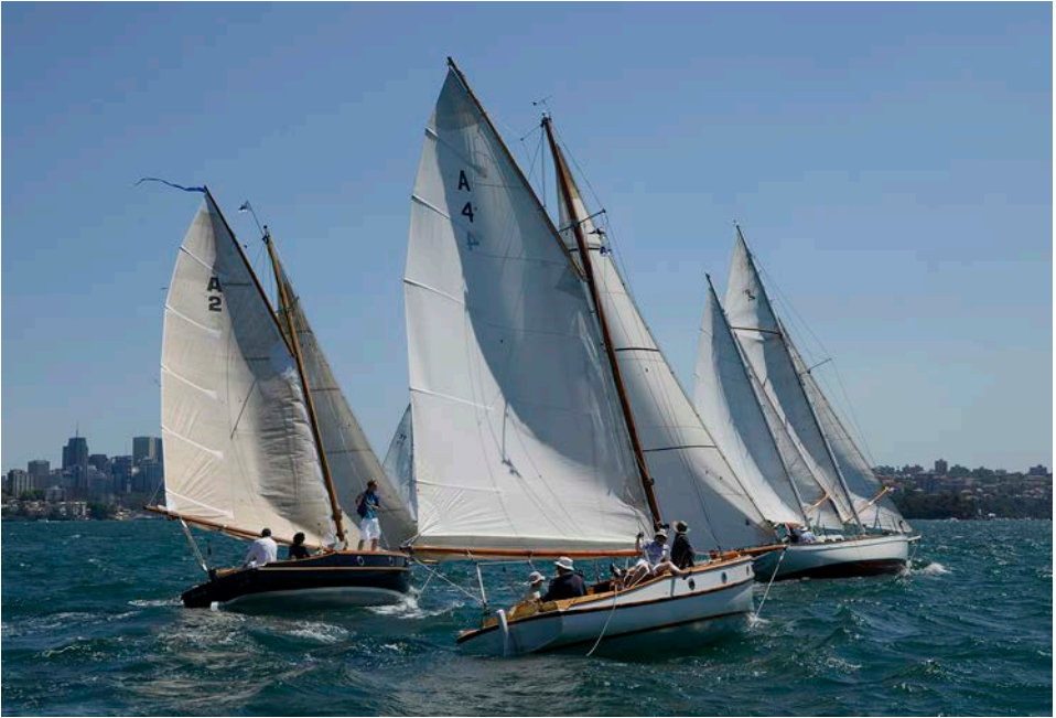
Vanity, Cherub and Sana after the start on Sunday 18 October