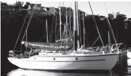
Alan Payne 34' – $49,000