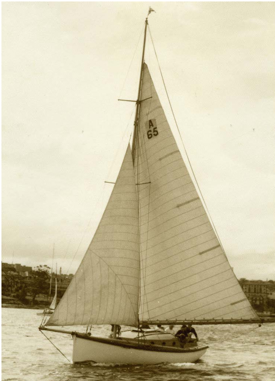
Waitangi , then owned by Walter Wearne, in the 1950s