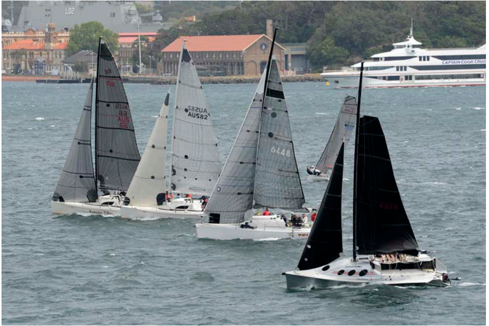
Balmain Tiger, Tigger, Carats and Mr Mojo heading for the first mark