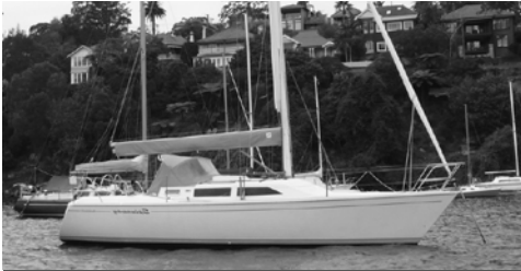
Northshore 310 - $59,000