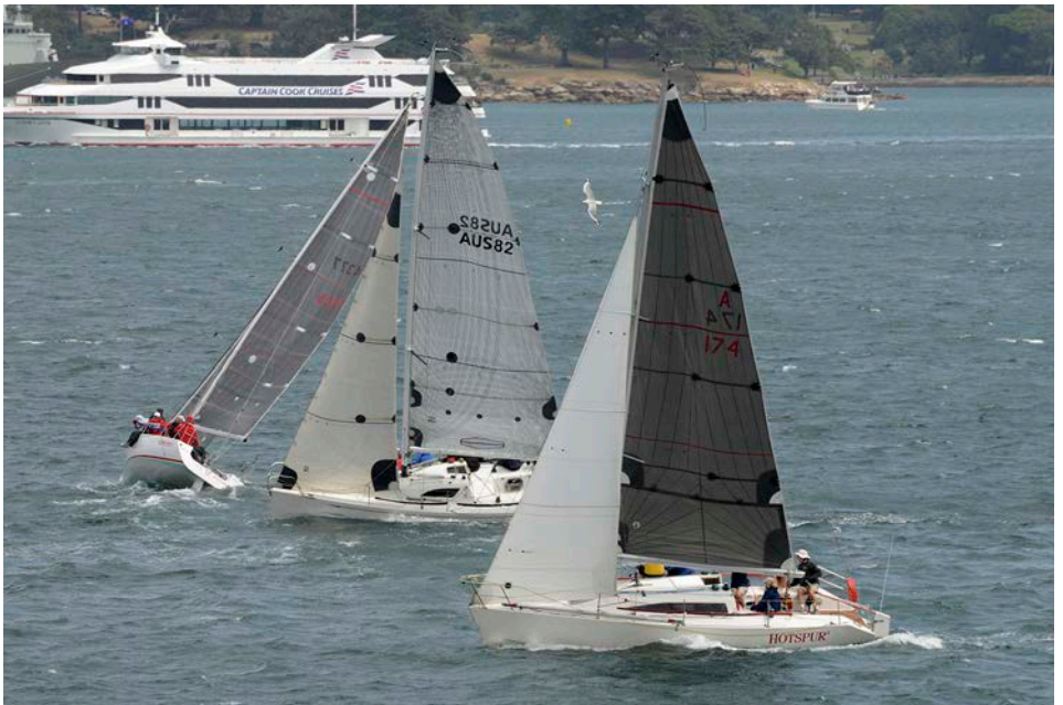
Clewless?, Tigger and Hotspur2