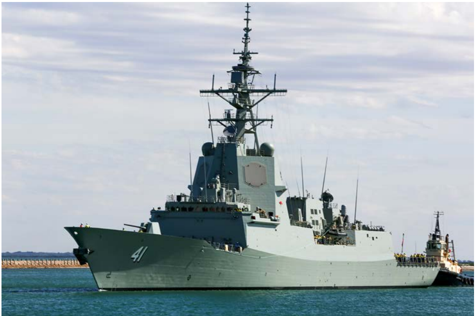
The second of our new destroyers, Brisbane , recently began her sea trials operating from her builder's yard in Adelaide