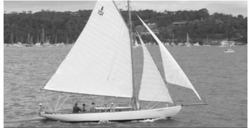
Windward - $45,000