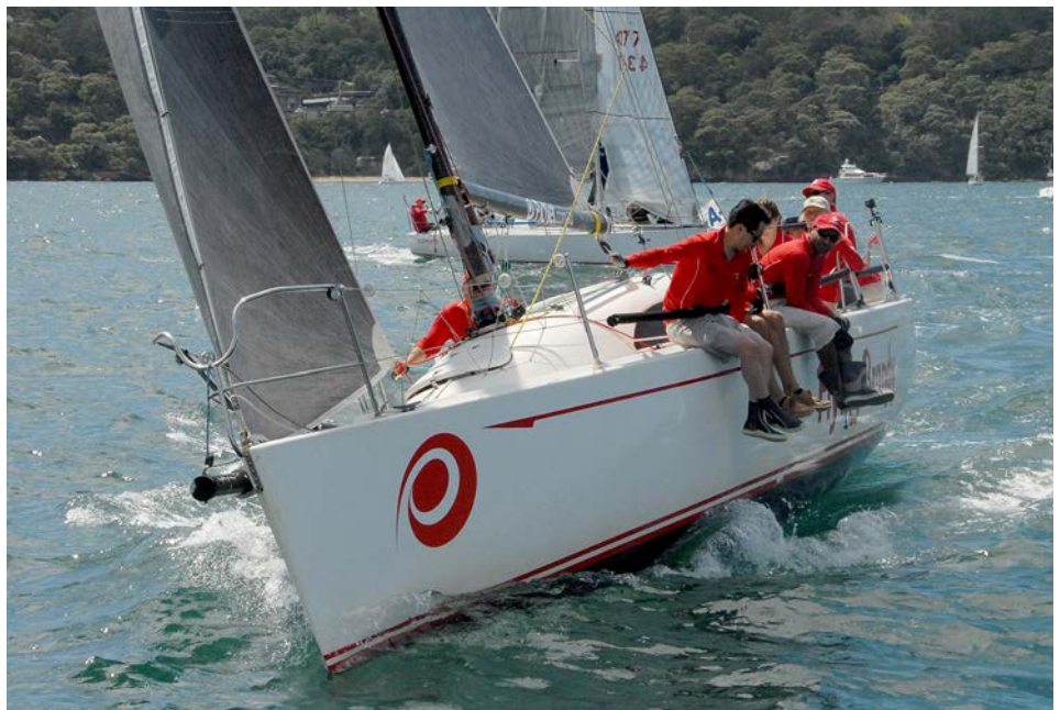
Crew at work in Flying Brandy

This may prove to be a historic and rare photo — Clewless? without her ?