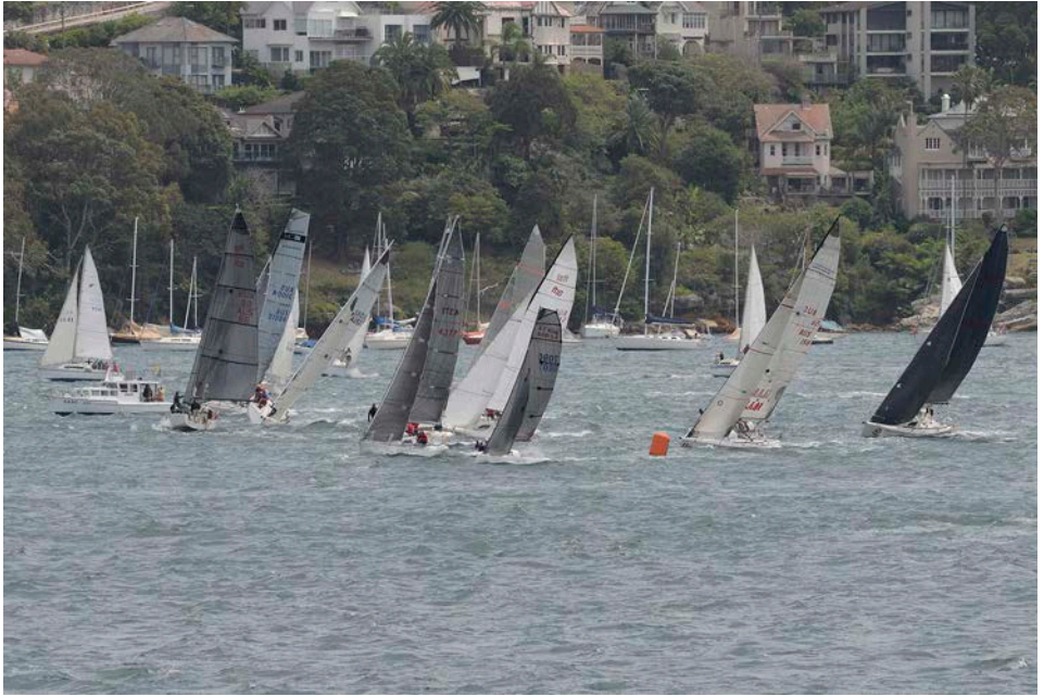
Trafalgar Day start — the Super 30s underway on 21 October