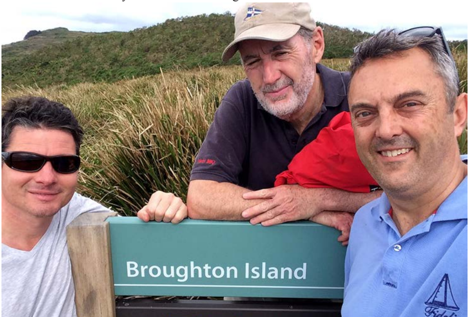
The Lunacy crew on Broughton Island