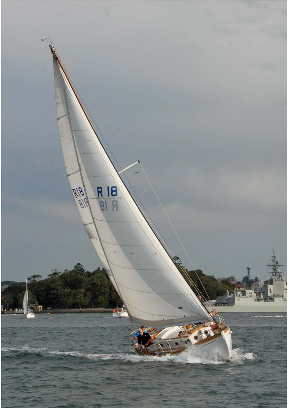
Ariel about to finish