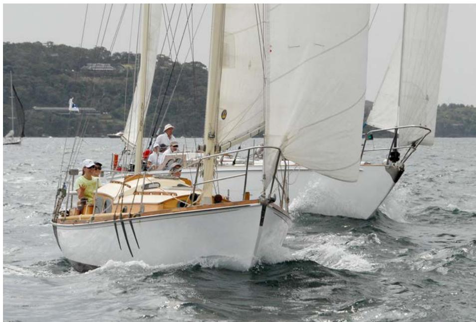
A Sunday start — Woodwind and Fidelis