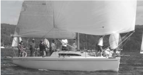
Northshore 369 - $124,900