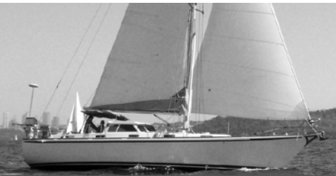
Savage Oceanic 43 - $198,000