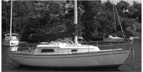
Swanson 27 - $25,900