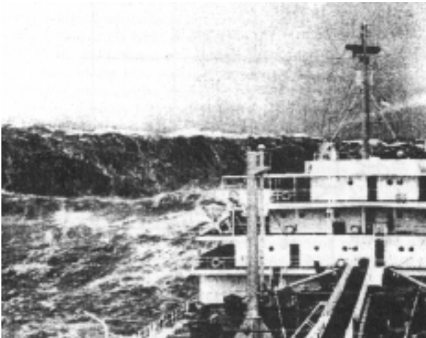
A ship encountering a very large steep sea. [1]

When rowing one's dinghy to windward in Mosmans Bay in a strong southerly, a wave 0.5 m high can seem quite large enough. Actually, it is very easy to overestimate the size of waves. It is also very difficult to measure wave height from the deck of a ship with any precision because of the lack of accurate levels and reference points. How big do ocean waves get? The simple answer is — very large!