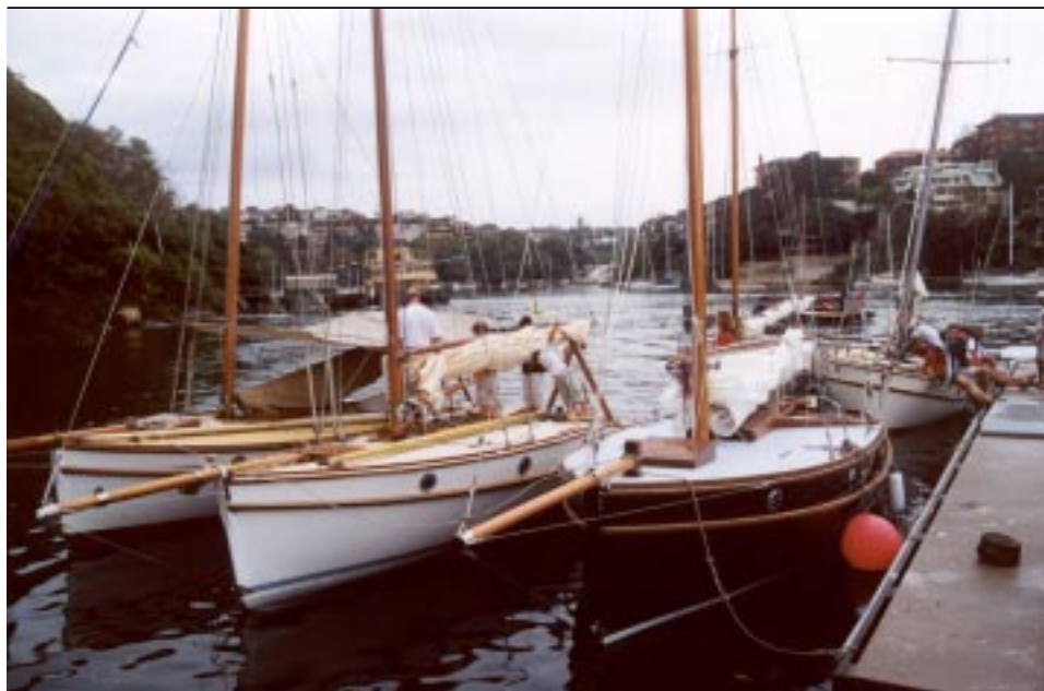
Rangers gathered at the SASC before the start of their World Championships. (above)