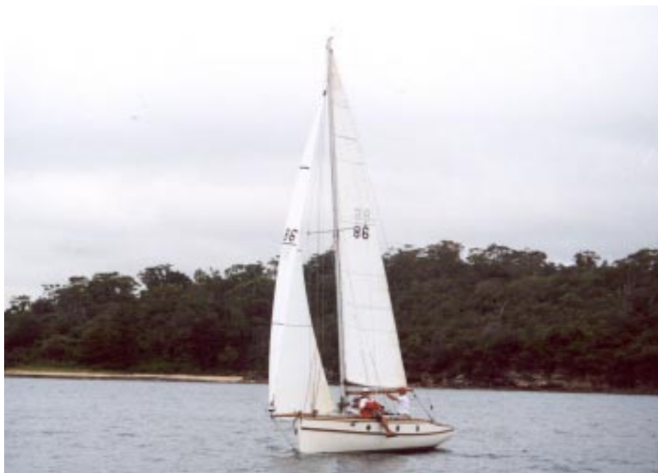
Cherub approaching the finish. (below)