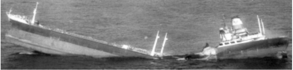
World Glory sinking in June 1968.

This phenomenon was probably responsible for one of the long-standing mysteries of the sea, the loss without trace of the Blue Anchor Line passenger ship Waratah . Built in 1908, Waratah was a cargo liner of 9,339 tons, and had 211 passengers and crew on board when she vanished between Capetown and Durban in July 1909. No wreckage or sign of the ship was found at the time. In 1997 a salvor claimed to have found the wreck lying in 113 m of water. Her bow section is extensively damaged and her mid section collapsed. The stern is more or less intact.