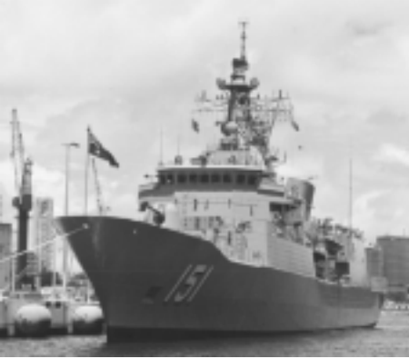
The new HMAS Arunta at the Oil Wharf at Garden Island on 24 January 1999.

The Royal Australian Navy's newest warship, the frigate HMAS Arunta , visited Sydney for the first time during January. Built by Tenix Shipbuilding in Victoria and handed over on 30 October last year, Arunta is the second RAN Anzac class ship. She has a full load displacement of 3,600 tonnes, and is 118 metres (387 feet) long overall. Two MTU diesels and one GE LM2500 gas turbine drive two shafts for a maximum speed of 27 knots. Arunta is armed with a 127 mm (5") gun, eight Sea Sparrow surface to air missiles in vertical launchers, two triple torpedo tubes and a helicopter. During