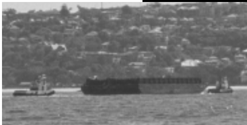
The barge (scow or lighter) used to carry spoil from the Northern Sewage Tunnel excavation to White Bay.

Simple question, you might say. Well, we all know that a barge is ' a boat of a long, slight, and spacious construction, generally carvel built, double banked, for the use of admirals and captains of ships of war '. It is also an early man-of-war, of about 100 tons, and, more appropriately in this case, a flat-bottomed vessel of burden, used on rivers for conveying goods from one place to another, and loading and unloading ships. Barges of this latter type may be propelled by sails or power, or they may be 'dumb' barges that need the help of a tug.