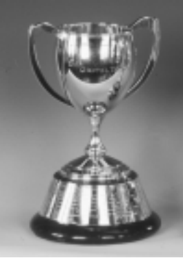
The Gretel Trophy.

As mentioned in previous News the Gretel Trophy was misplaced and the Colonial State bank had funded the reproduction of a replica.