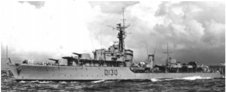
The first Arunta departing Sydney in 1955 towards the end of her operational career.

Whilst the new Arunta has cost several hundred million dollars, the first cost just £683,817 ($1,367,614).