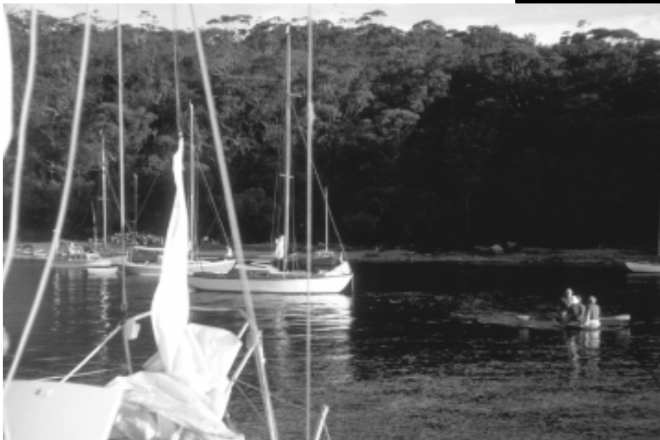
Back in 1965 yachts towed dinghies in the Idle Hour race to Store Beach. In the photo above Mac Shannon (member from 1963 to 1989) is returning to Chione (A90) with some of his crew. The traditional gathering is still going strong on the beach and if you look closely you can see the starter's boat secured alongside a yacht that looks suspiciously like Idle Hour .