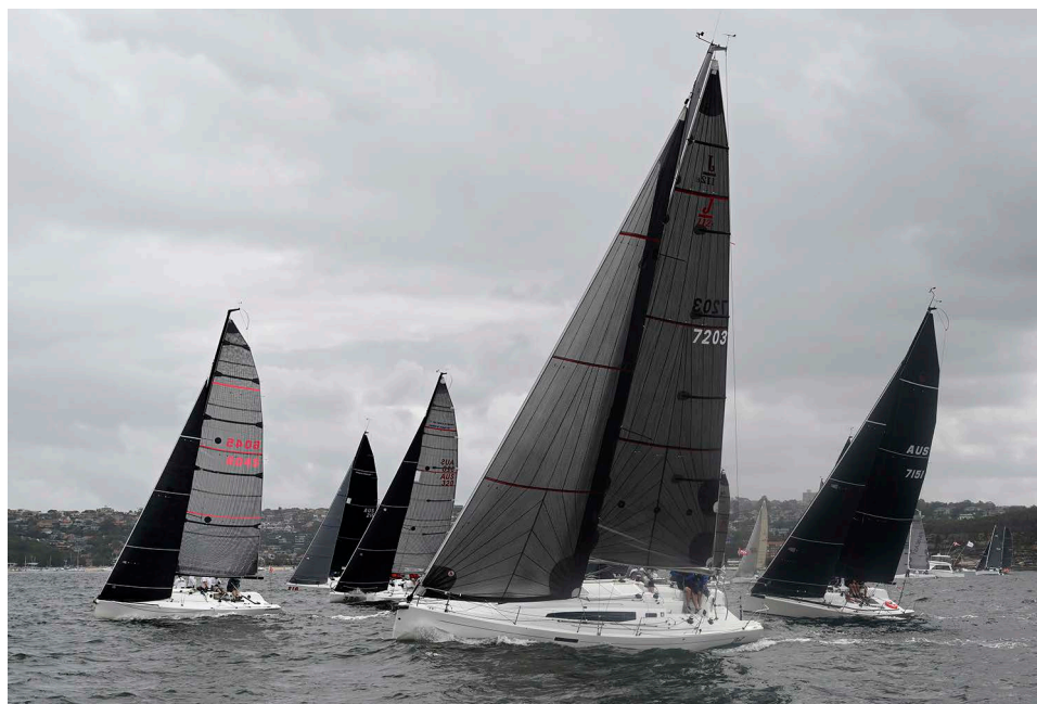
A Super 30 start on Sunday 8 March with Very Tasty , Zest and Optimum nearest the camera