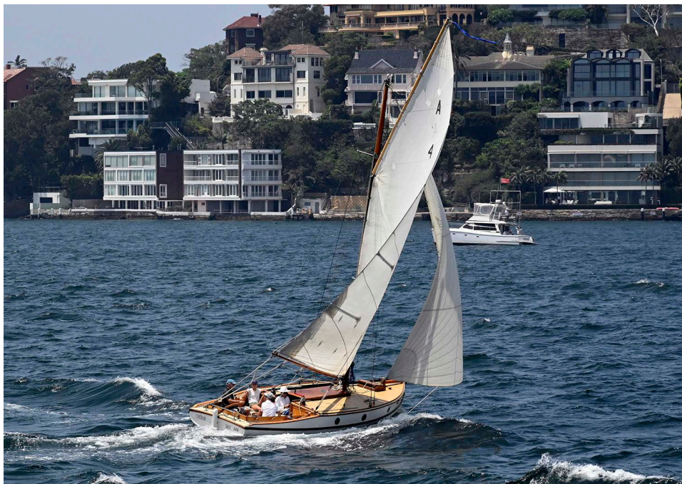
Cherub arriving at the starting area for the 184th Australia Day Regatta