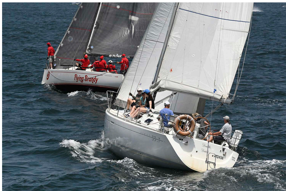
Double Dutch and Flying Brandy were both competitors in the Australia Day Regatta