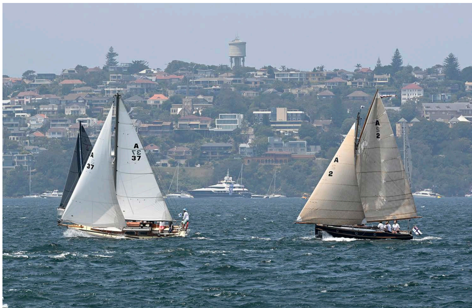
Warana and Vanity on the way after the start