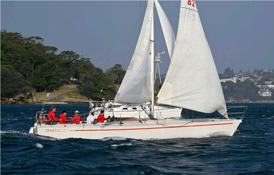
There was some great sailing weather during the Summer Friday twilights, which were cut short by the viral troubles. The wind was fresh on 10 January, here Spartacus sets off at the start