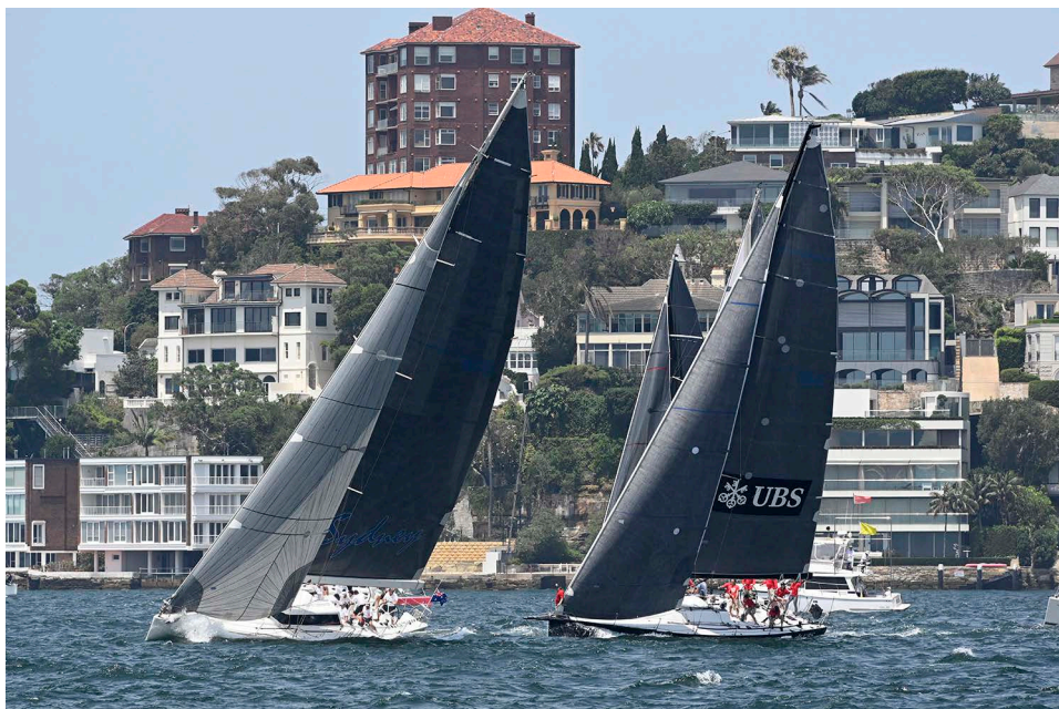
The start of Division 1 in the Regatta was the usual spectacle with the larger yachts like Sydney and UBS Wild Thing in the division