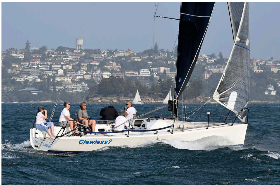
Clewless? was first to finish in Division 1 and took third place on handicap