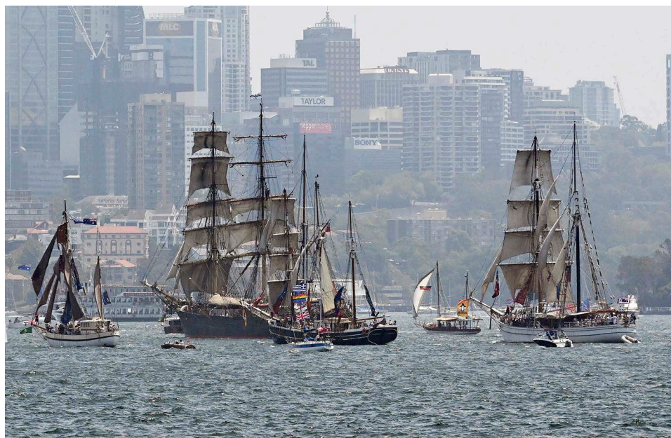
Despite the light wind the Tall Ships Race provided the usual spectacle of traditional sail on Sydney Harbour