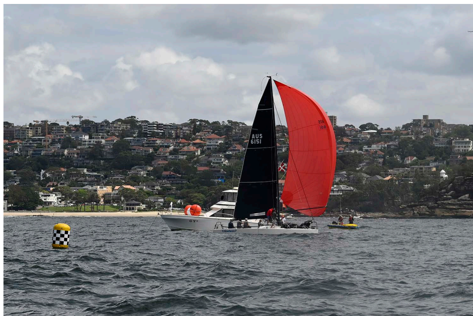
Clewless? finishing a Super 30 race on Course Area E during the Sydney Harbour Regatta on Sunday 8 March