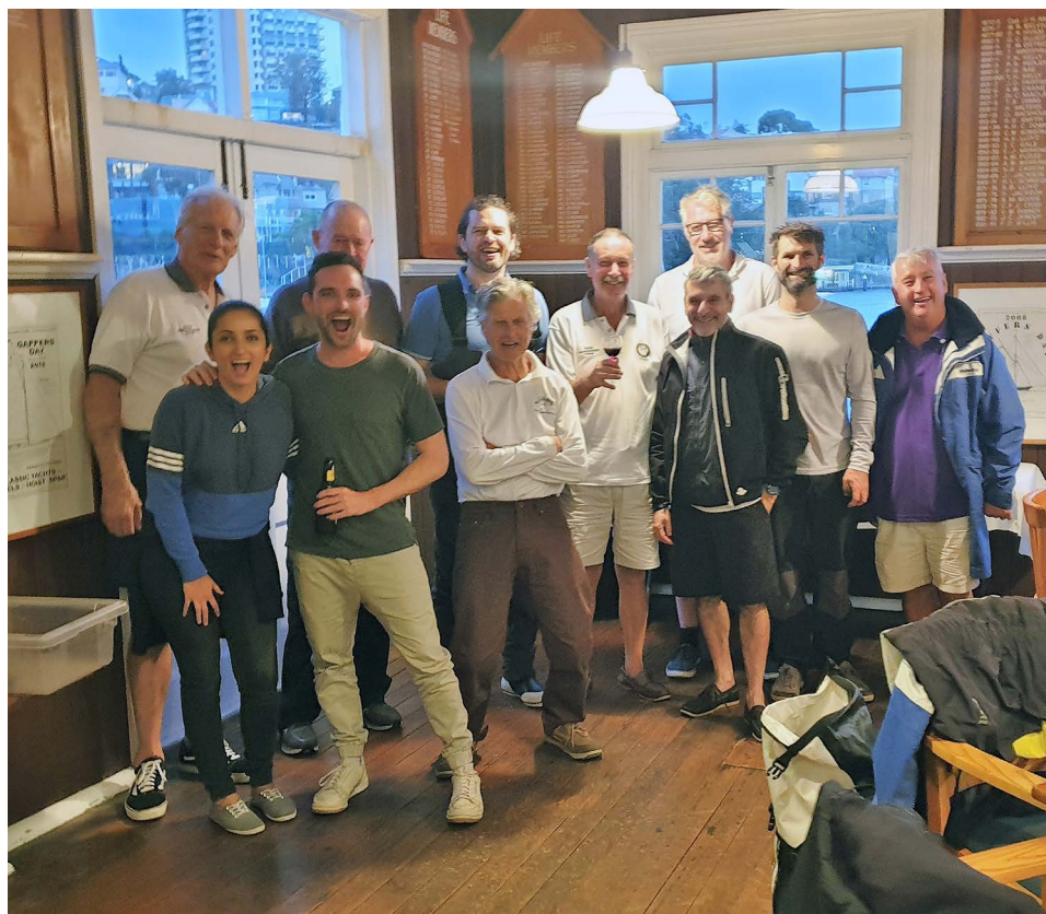
The Friday evening stalwarts after the race on 7 February