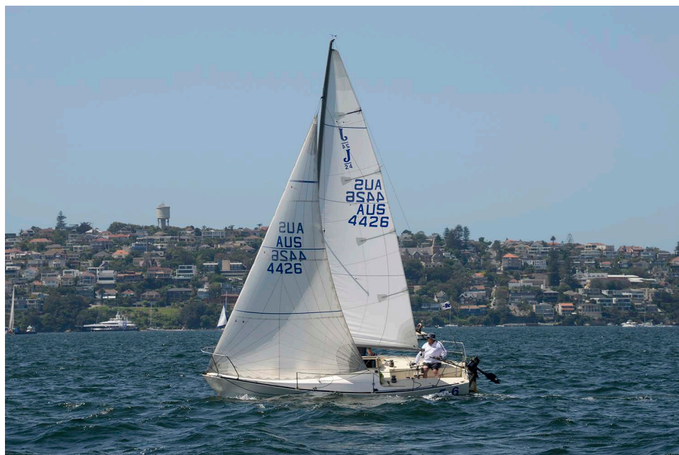
5 to 6 was sailed by guest skipper Captain Chris Manion on 1 March