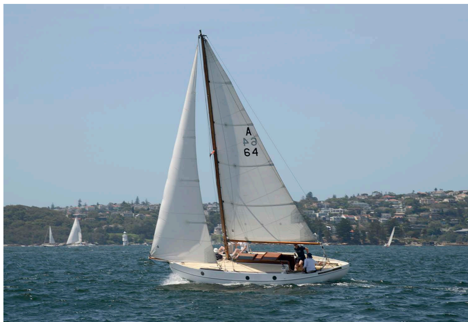
Tamaris enjoying the beautiful Sydney north-easterly breeze