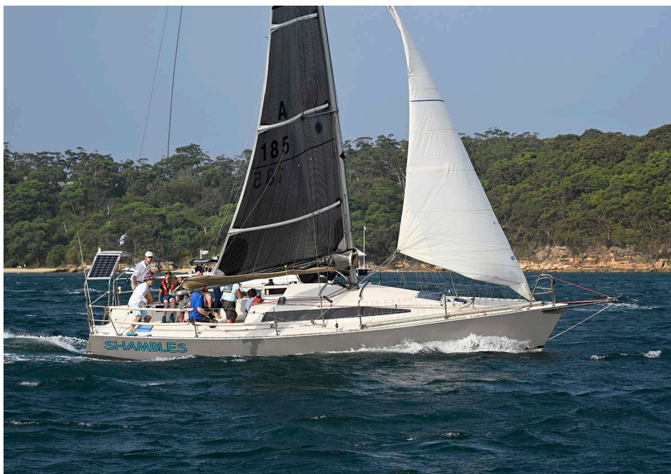
With sails set for the conditions, Shambles speeds across the starting line