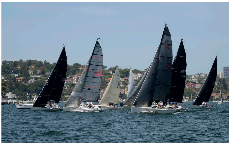
The Super 30 start on Sunday 1 March

With SailGP occupying the harbour on Saturday 29 February, the usual Saturday races were sailed on Sunday 1 March. Captain Amora set course A for the day