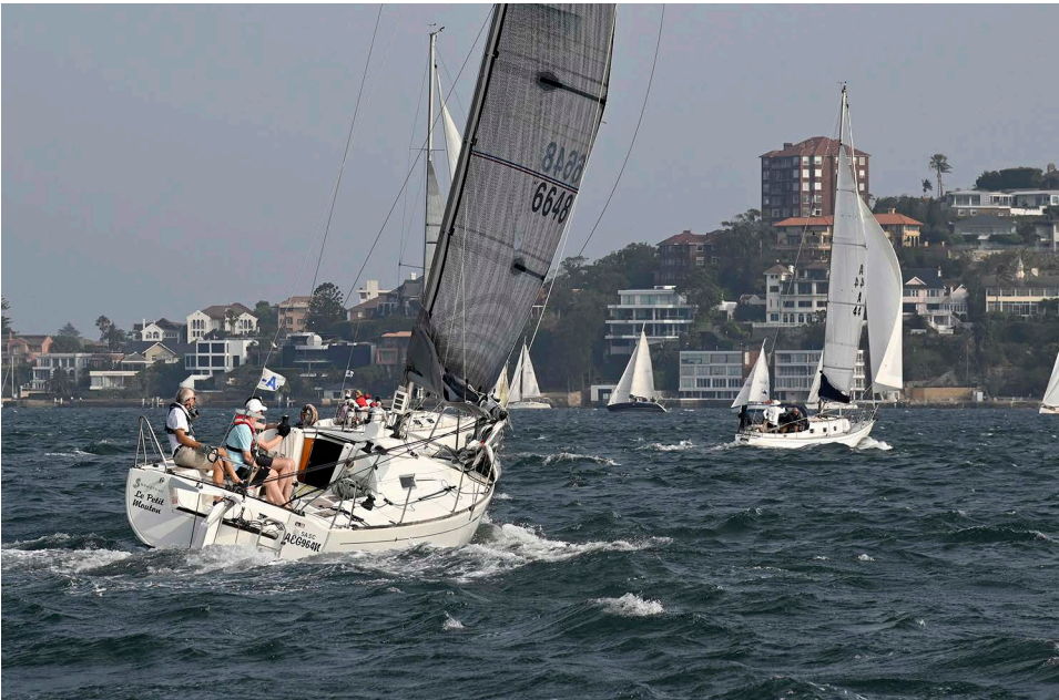
Le Petit Mouton and Morning Light head for the first mark