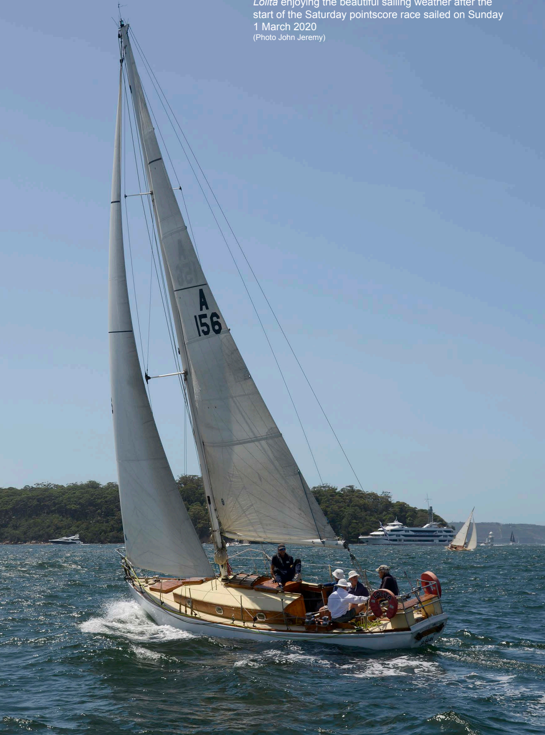
Lolita enjoying the beautiful sailing weather after the start of the Saturday pointscore race sailed on Sunday 1 March 2020