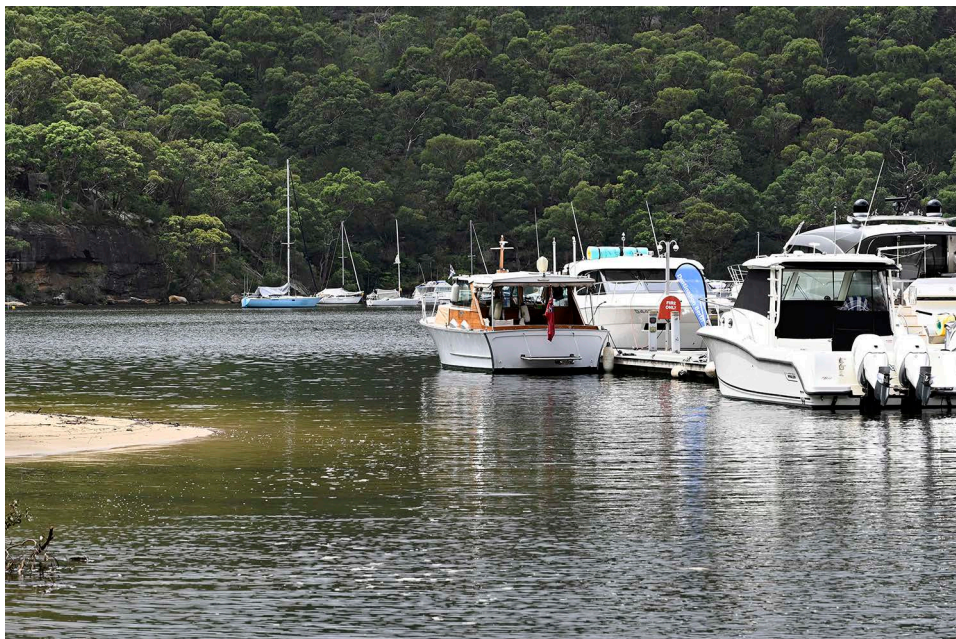
Sailfish moored alongside Roseville Bridge Marina during the Middle Harbour voyage of 27 February. Sadly, this will probably prove to be the last RUTUS expedition for some time as we battle the invading virus