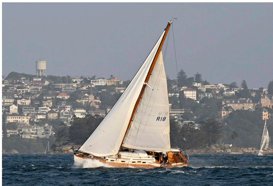
Ariel was well reefed for the conditions and finished second in Division 3