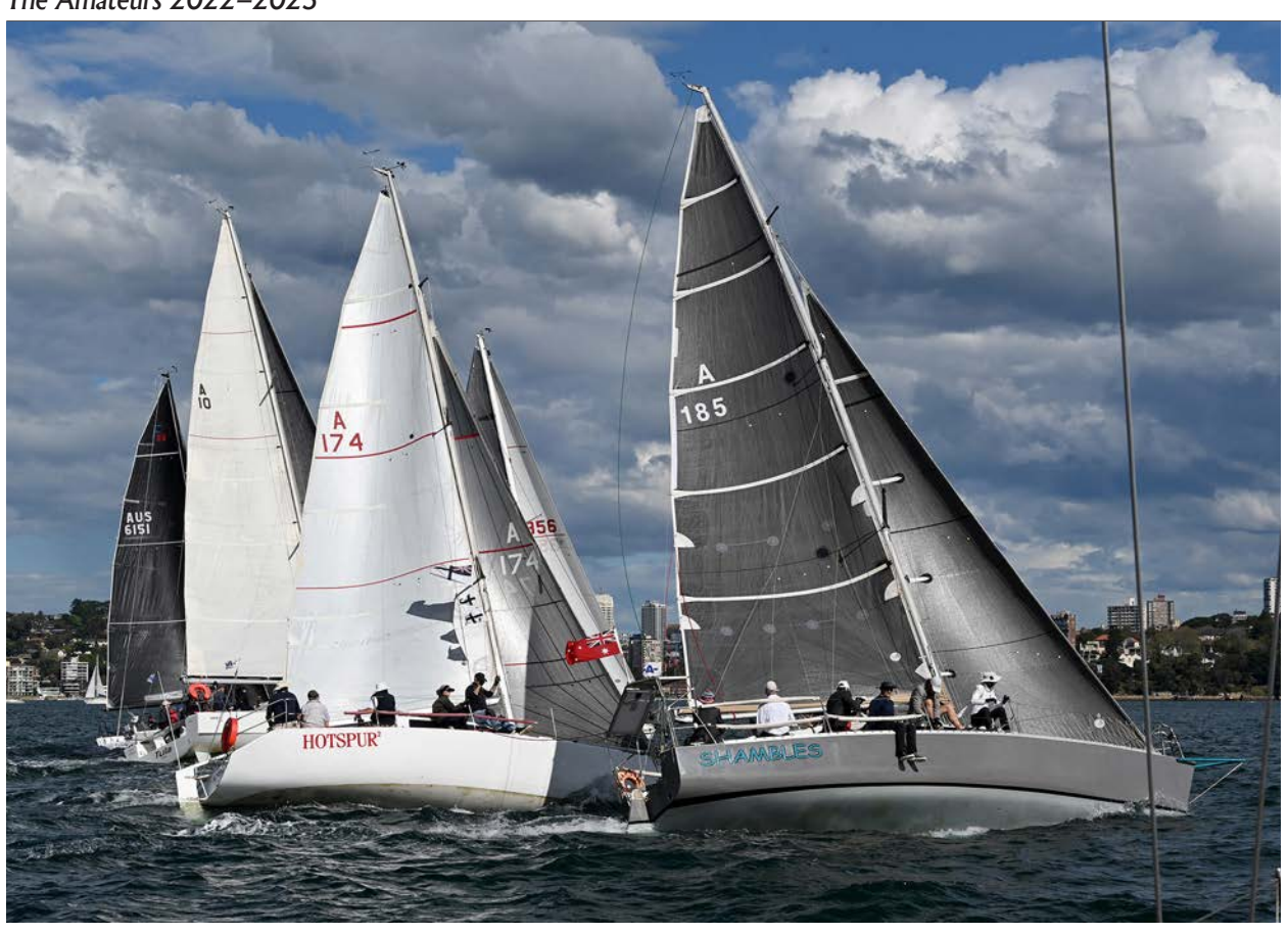
Shambles (A185), Hotspur² (A174), Tula (A10) and Clewless? (AUS 6151) shortly after the start in the 150th Anniversary Regatta held on 10 September 2022