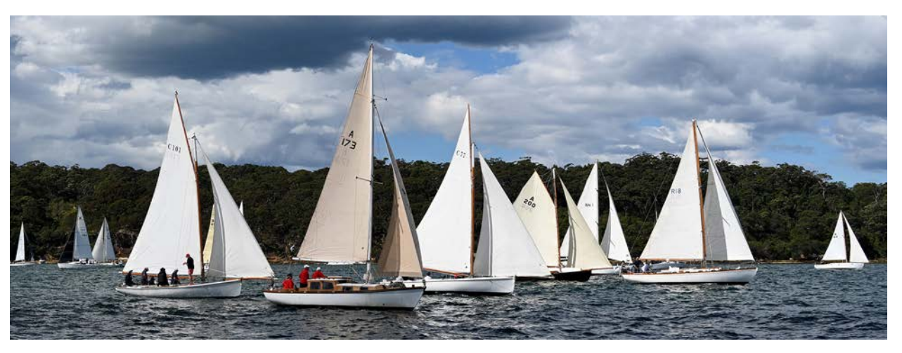
The start of the Classic Non-spinnaker Division 2 during the 150th Anniversary Regatta