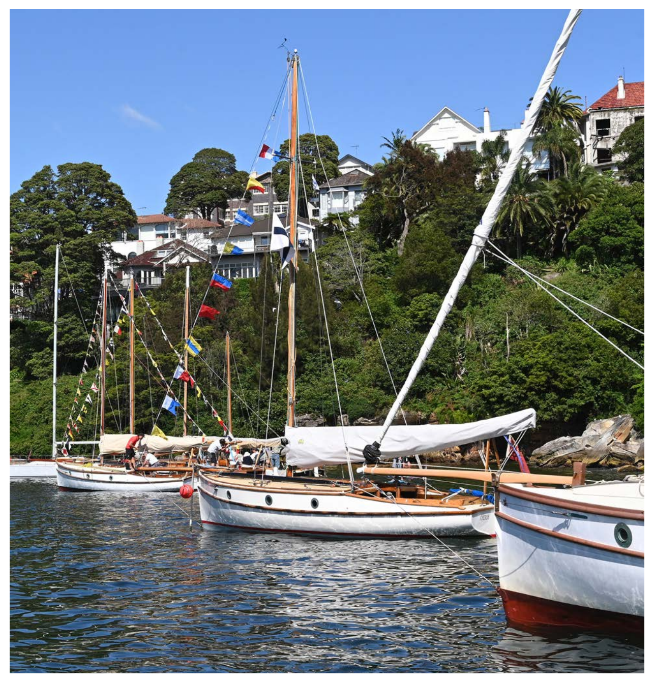
A gathering of Ranger-class yachts in Mosman Bay on Gaffers Day 2022

Front Cover: Kelpie in pride of place off the clubhouse on Gaffers Day on 16 October 2022