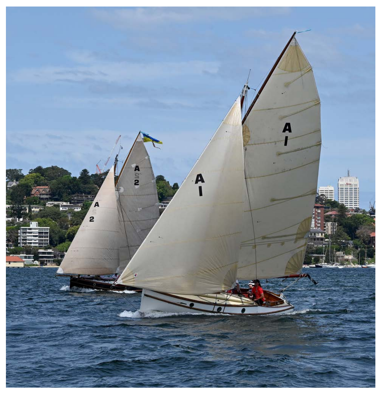
Ranger (A1) and Vanity (A2) during the 150th Anniversary Regatta on 10 September 2022