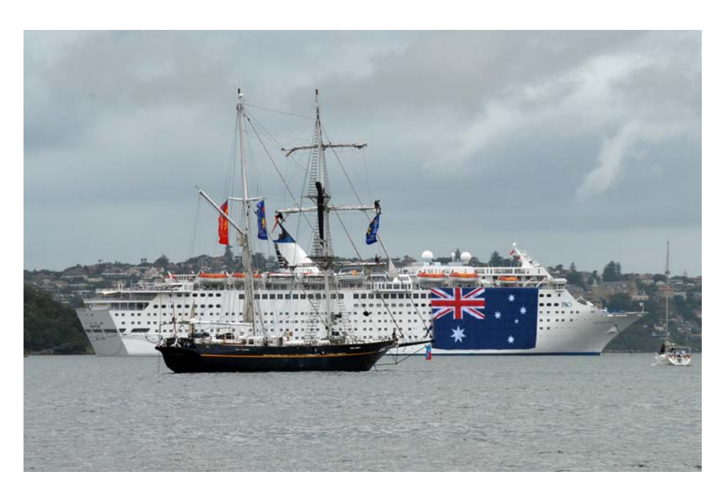
Colour and contrast — Young Endeavour and the cruise ship Pacific Sun on the Harbour on Australia Day (above)

HMAS Sydney, Flagship of the 176th Australia Day Regatta (below)