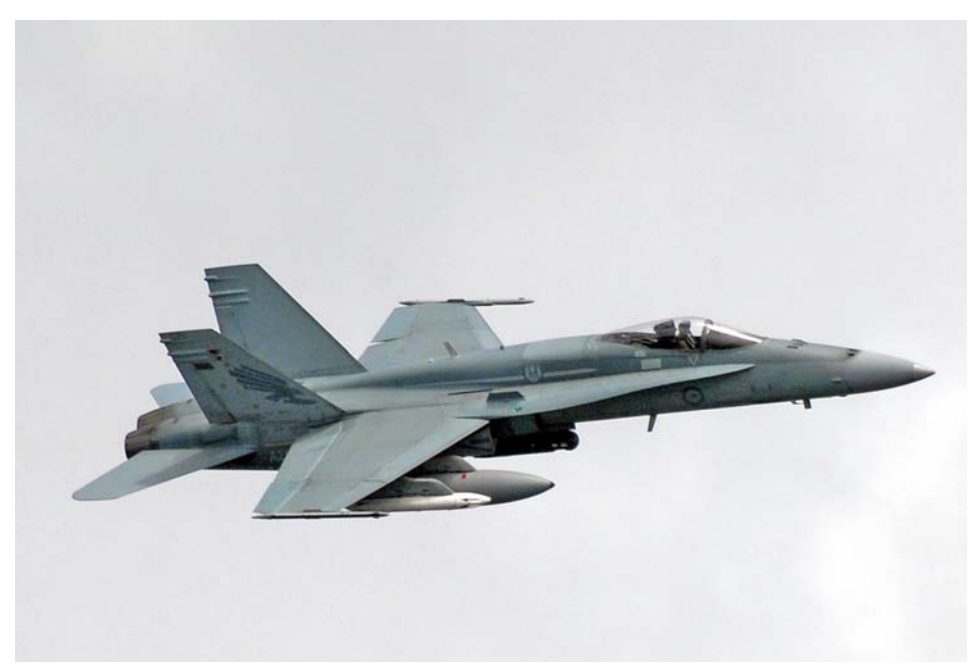
Three RAAF F/A 18s put on a spectacular and noisy display over the Harbour on Australia Day (above)

The jets were followed by three Tiger Moths, a glimpse of another era (below)