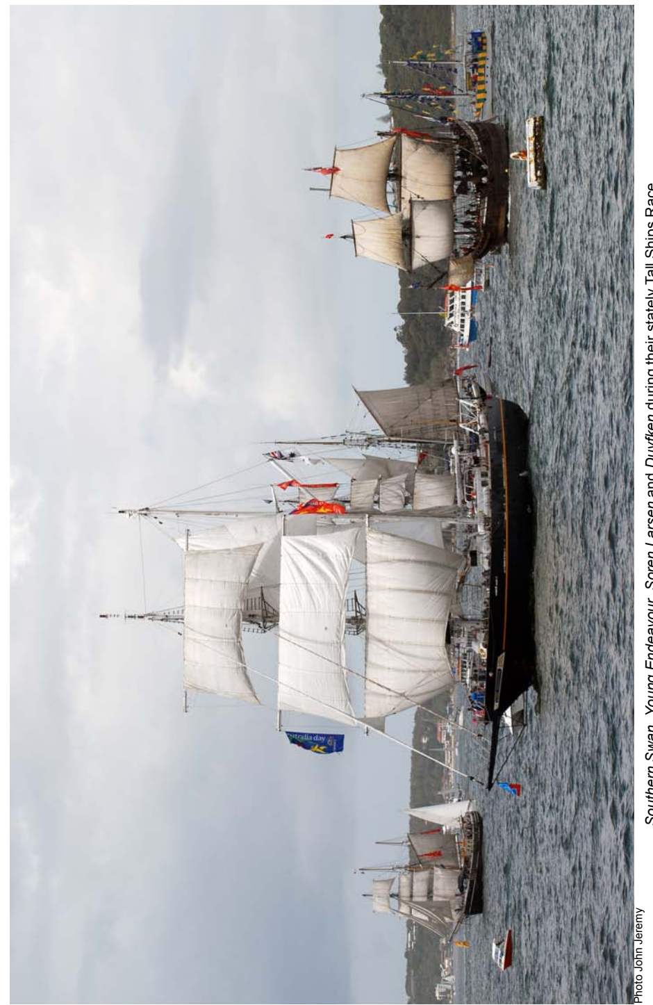
Southern Swan, Young Endeavour, Soren Larsen and Duyfken during their stately Tall Ships Race