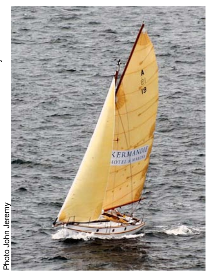
Maluka on the way to Hobart

to the fundamental principles of amateurism in sport by selecting a boat name founded on love, not money. With that in mind, during this Hobart race I found myself cheering on yachts like Aurora , Copernicus , Chutzpah , Lahana and Maluka of Kermandie . Gentlemen, I salute your loyalty to the Corinthian spirit. And how heartwarming it was that the overall winner, Loki , was one of the few entrants to compete without sponsorship of any kind.