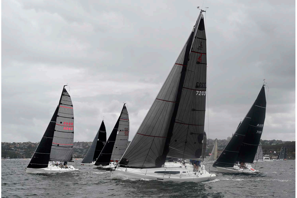
A Super 30 start on Sunday 8 March with Very Tasty , Zest and Optimum nearest the camera