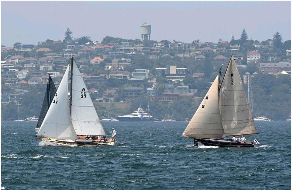
Warana and Vanity on the way after the start