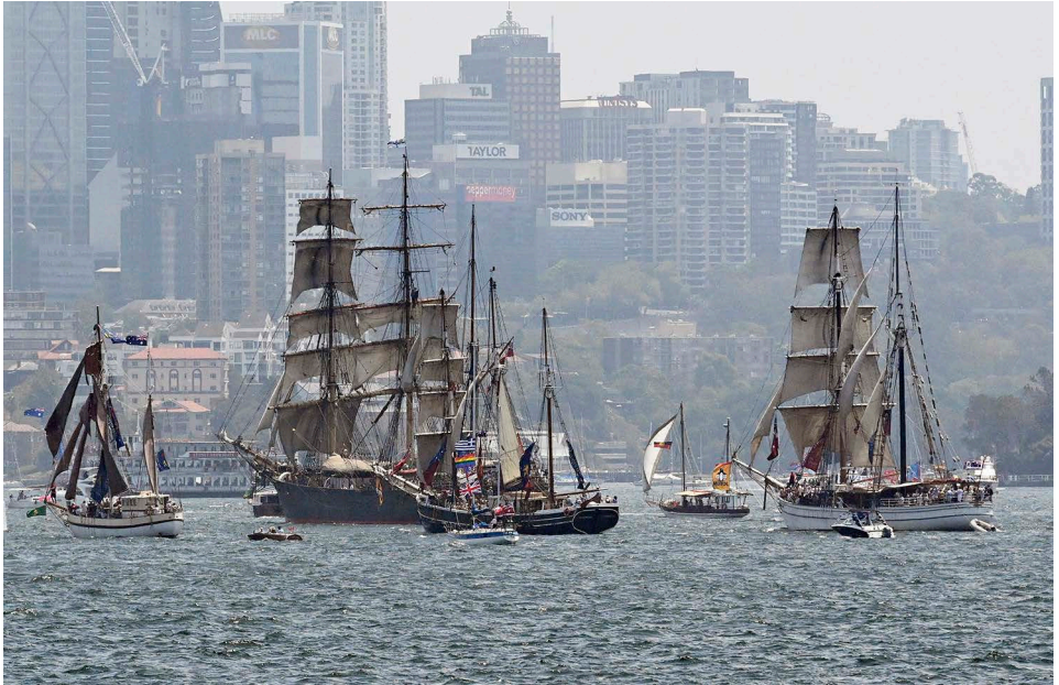
Despite the light wind the Tall Ships Race provided the usual spectacle of traditional sail on Sydney Harbour