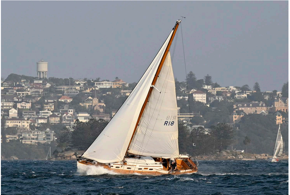
Ariel was well reefed for the conditions and finished second in Division 3