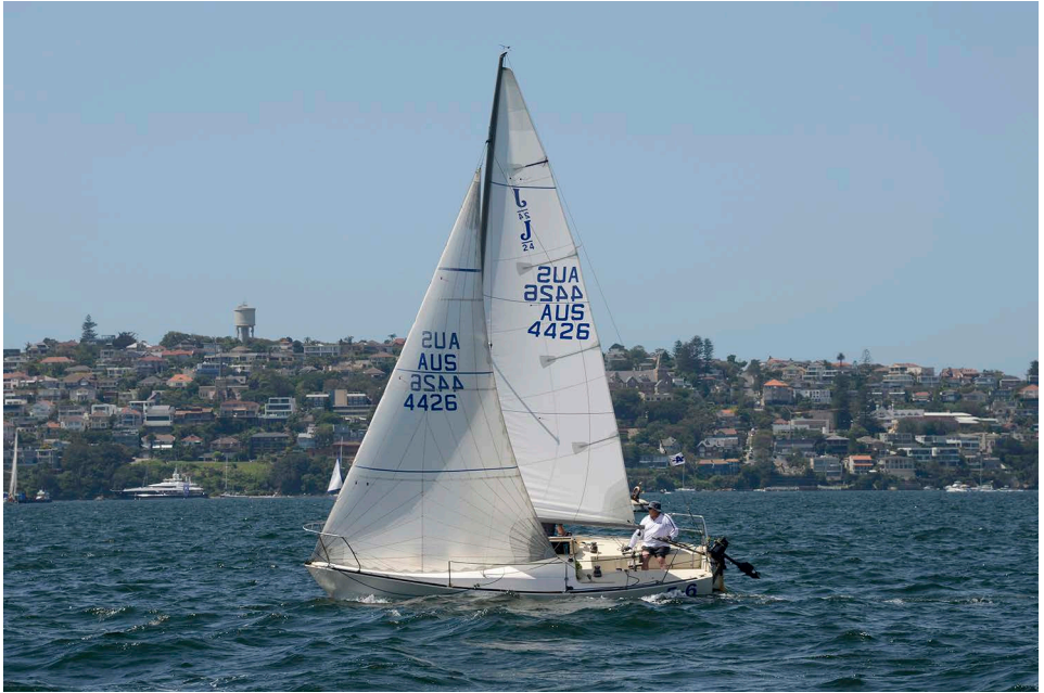
5 to 6 was sailed by guest skipper Captain Chris Manion on 1 March