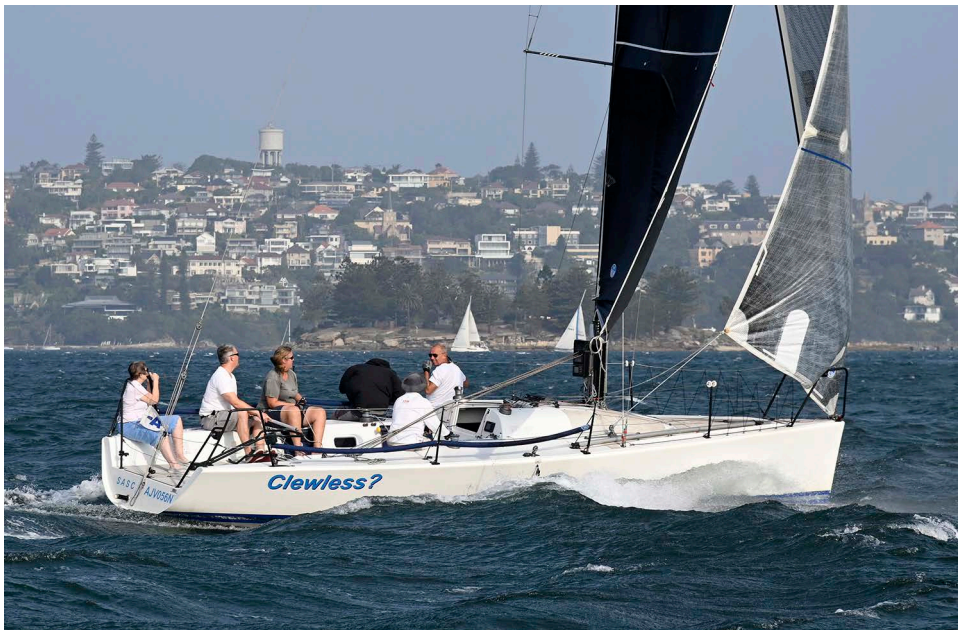
Clewless? was first to finish in Division 1 and took third place on handicap