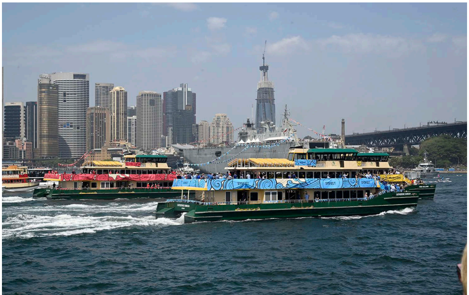
The Ferrython was as popular as ever with a large number of power boats following the ferries as they made their way to the finish at the Bridge