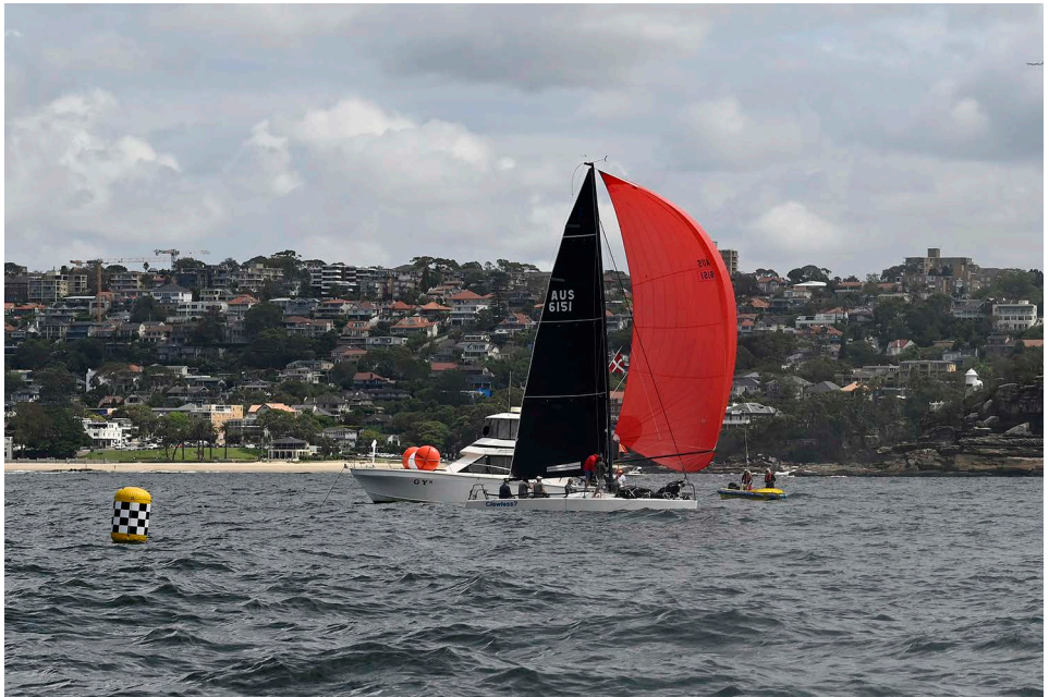
Clewless? finishing a Super 30 race on Course Area E during the Sydney Harbour Regatta on Sunday 8 March