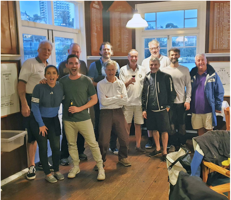
The Friday evening stalwarts after the race on 7 February