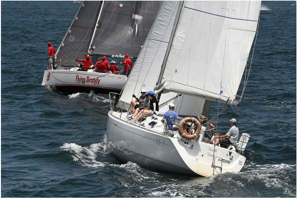
Double Dutch and Flying Brandy were both competitors in the Australia Day Regatta