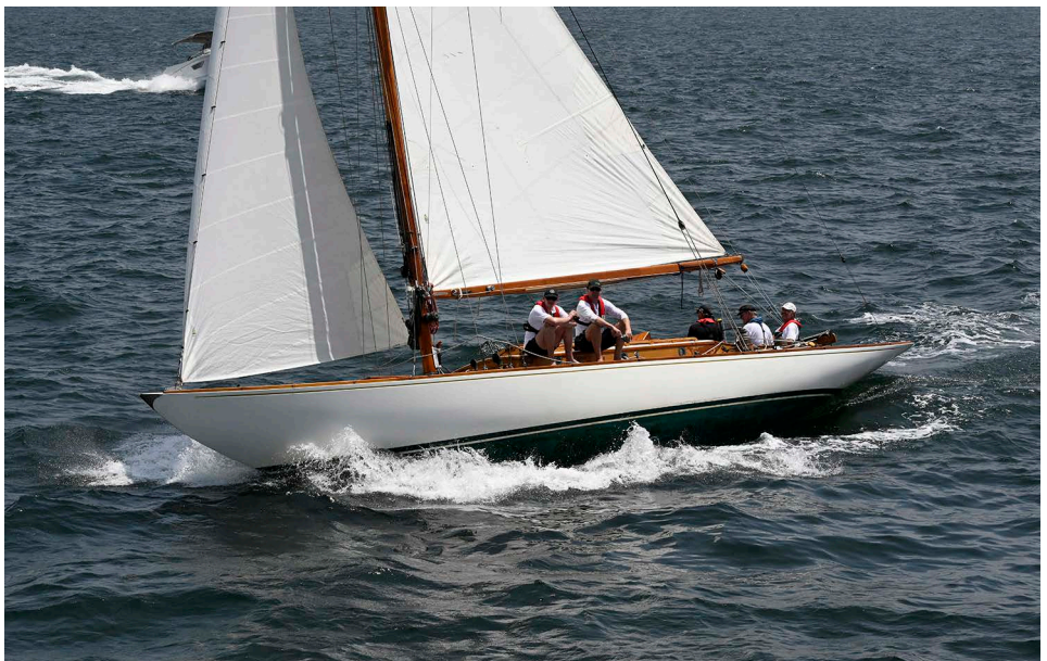
Josephine passing astern of the Regatta Flagship HMAS Yarra