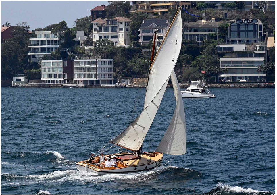
Cherub arriving at the starting area for the 184th Australia Day Regatta