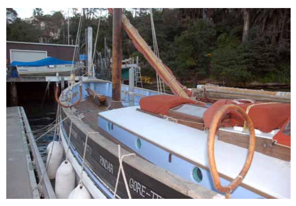
The simple deckplan of Spirit of Mystery (above)

Spirit of Mystery's lived-in cabin (below)