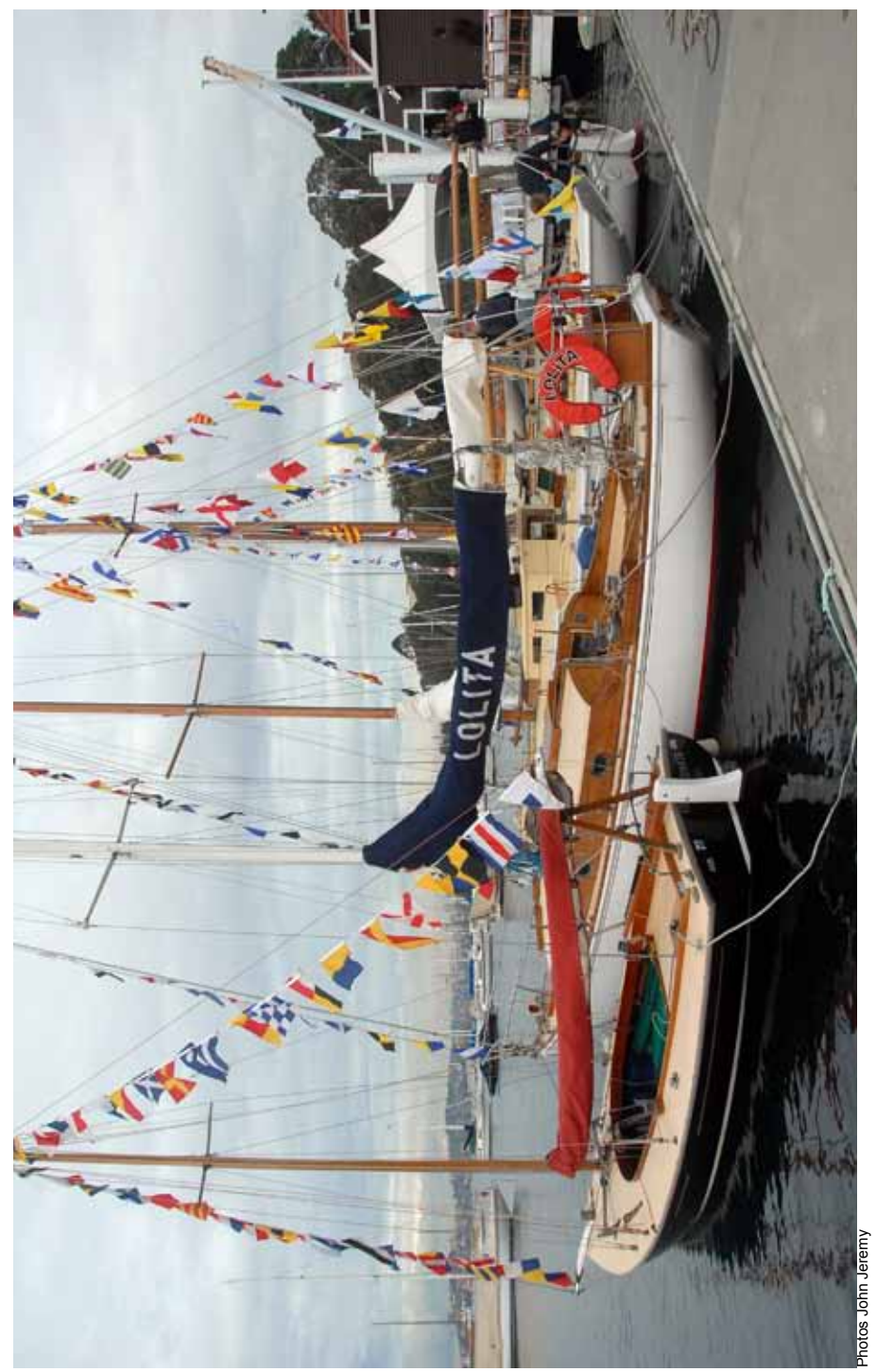
An otherwise grey day was brightened by the yachts alongside for the annual prizegiving. Yeromais, Lolita and Hoana were moored at the pontoon