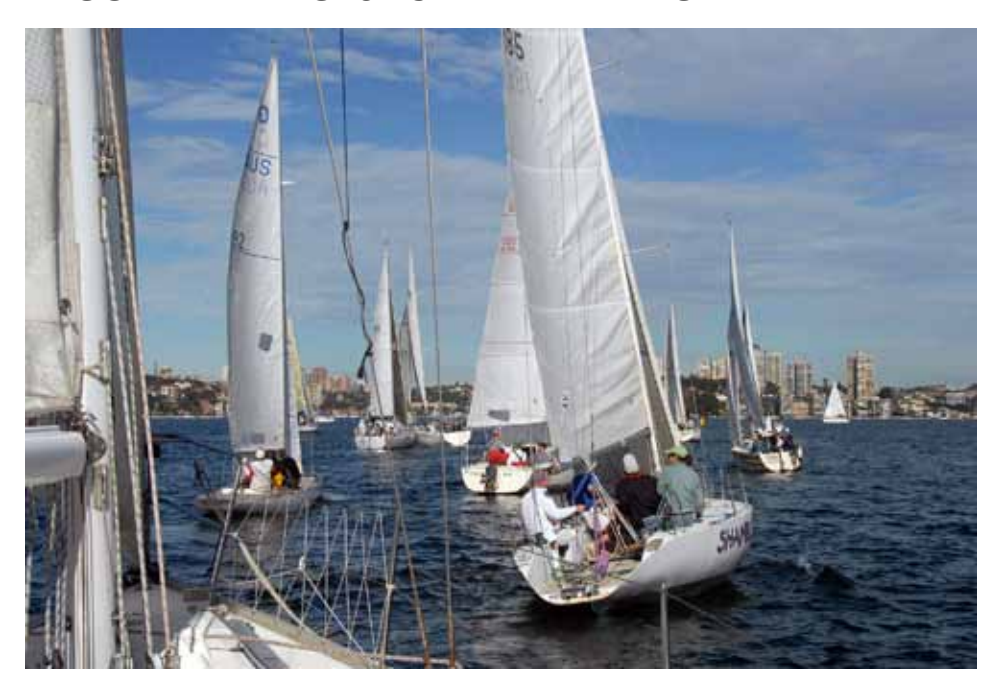
Shambles in the midst of the fleet for the start of Division 2 (above) Sayonara looking magnificent, as usual (below)