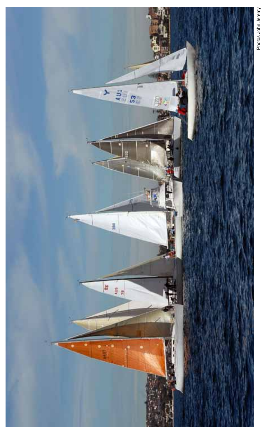
The start of Division 1 in the combined SASC/RSYS/RANSA winter race on Saturday 13 June. Many yachts took part in the race on a beautiful Sydney winter's day