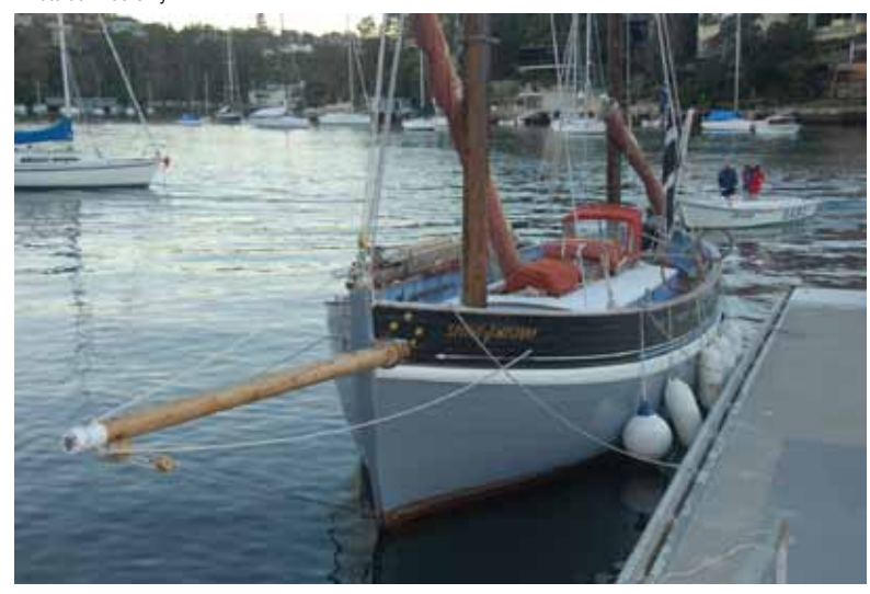
Spirit of Mystery at the SASC pontoon