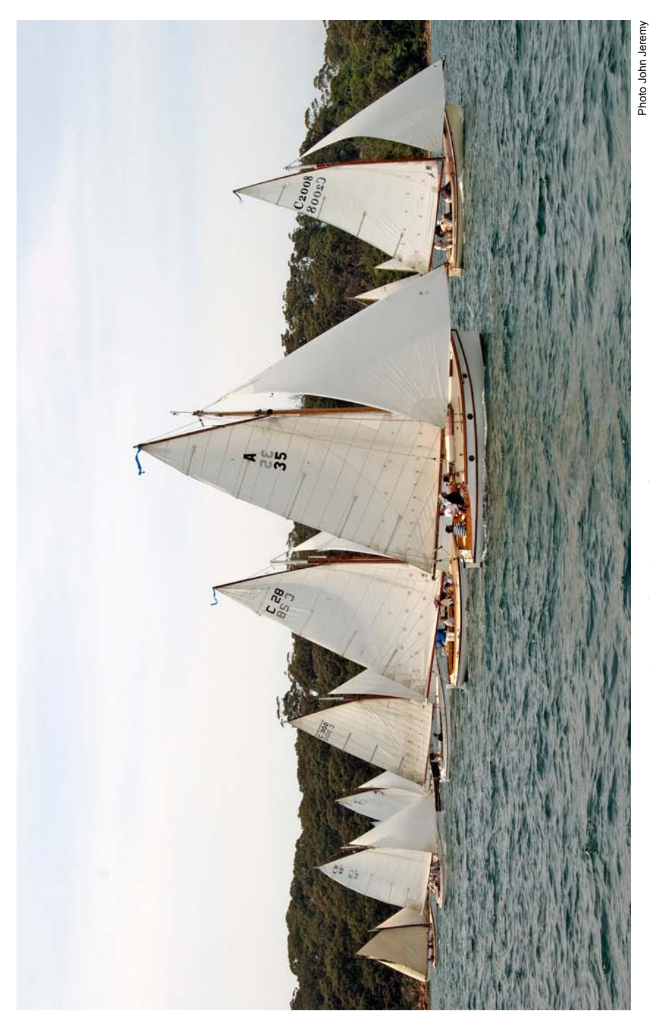
The start of the Ranger and Couta Boat Division