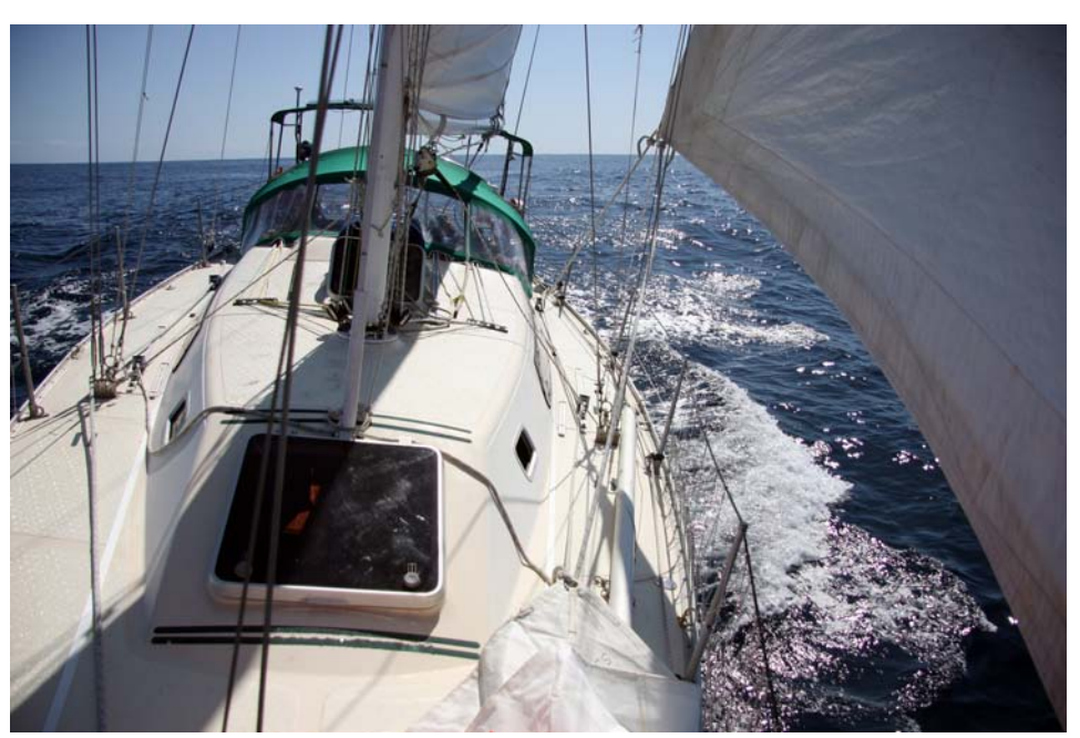
Much of the passage to Lord Howe was one long reach

Still, this was a cruise, not a race. Without the pressure of constant sail changes to push the boat to its maximum performance, there wasn't much to go wrong. Trim the rig into balance, steer 060° from North Head and we'd eventually get there. And the key word was "eventually". After a series of early scrappy rain squalls on our departure day the breeze evaporated into 0-4 knots from the NE and we had to set The Indefensible up for motor-sailing: main strapped on hard and 2000 rpm on the donk. "Everyone happy with that? Great. Jeeves can take over from here. Press the bloody button!" Jeeves — the ever-reliable autohelm — was the hardest working member of our crew. For the next four days he steered tirelessly, keeping a far truer course than any of us could have managed on the helm. His unflinching efforts also allowed us to adopt a very generous watch system through the nights: two hours on and eight hours off. This was luxury compared to racing schedules,