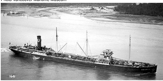
The tanker Montebello