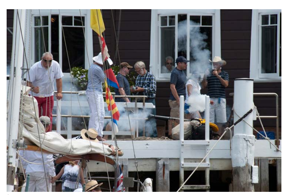
A school of Coutas at the wharf (above) The firing of the Les Ardouin Trophy signalled the start of sailing (below)