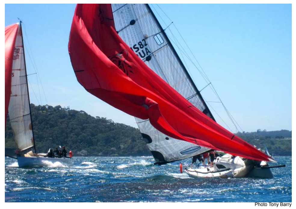
Tigger having some spinnaker fun allowing Shere Khan to overtake on a run