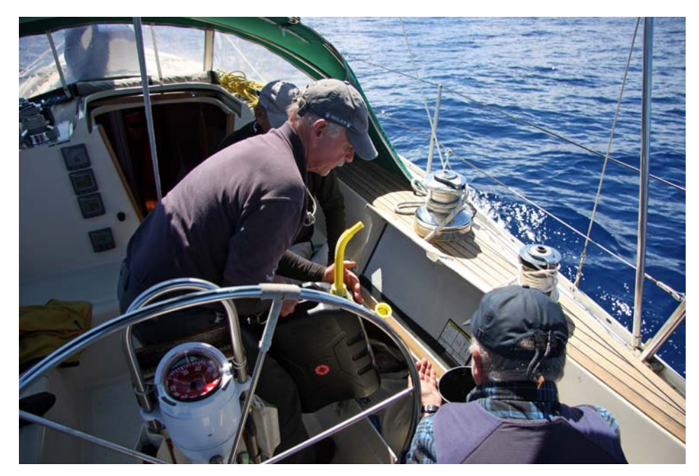
Re-fuelling mid-Tasman became something of a ritual