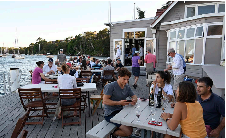
The first Friday Twilight race on 29 October was abandoned because of a nasty westerly, but those present enjoyed dinner on the wharf