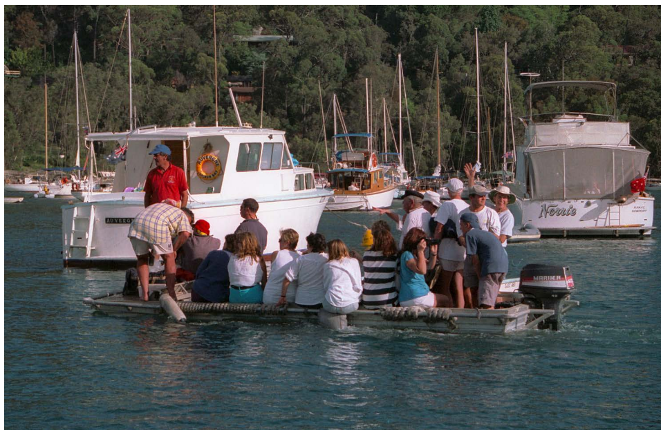
Where are the lifejackets!. The SASC tender service at Coasters Retreat on Good Friday 1997