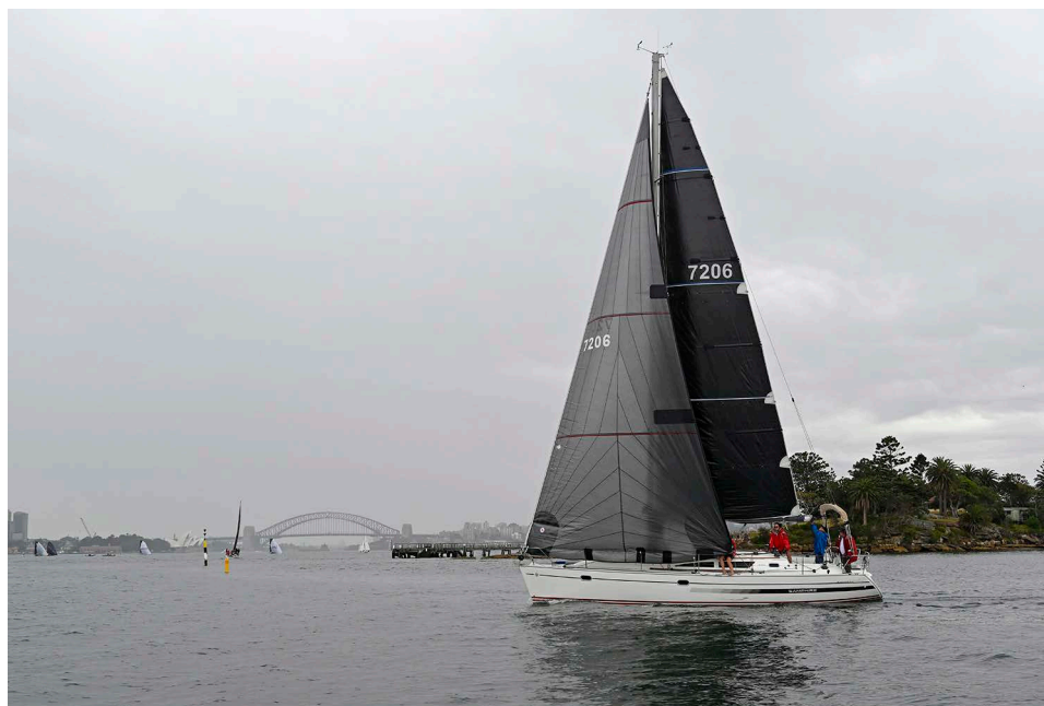
Just back from Port Stephens, Samphire found enough wind to finish the shortened course at Shark Mark and win her division