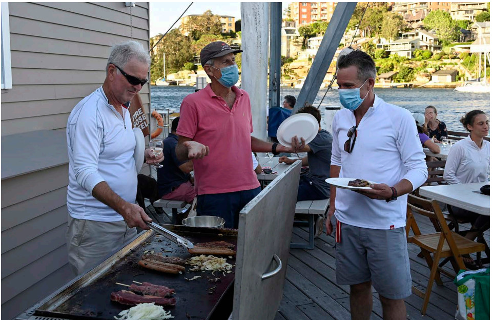
The barbeque in action again, at last!