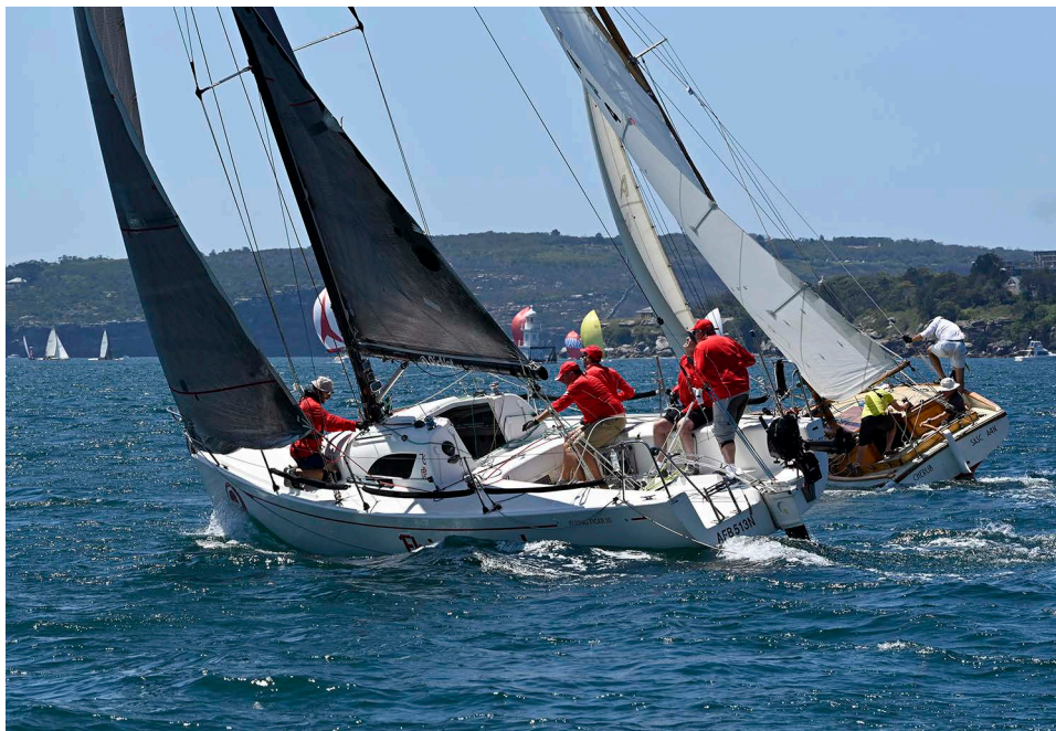
Flying Brandy and Cherub after rounding the Nielsen Park mark