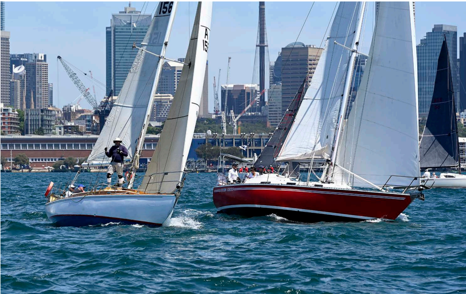
Lolita and Huon Chief starting in the Idle Hour Trophy race on 23 October, the first race day after the lockdown