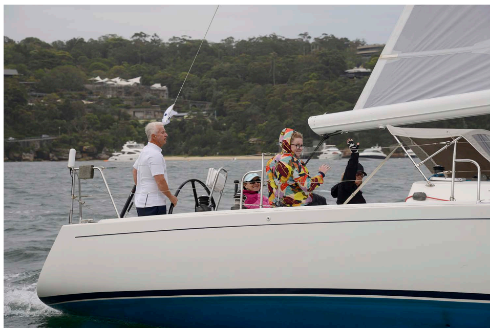
Everything was under control in As You Do