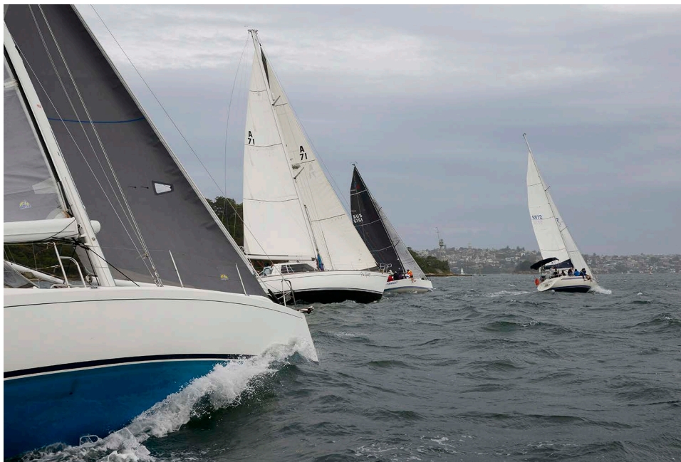
Division 1 on the way into the southerly under familiar grey skies