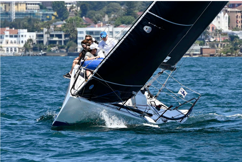
Clewless? revelling in the perfect conditions