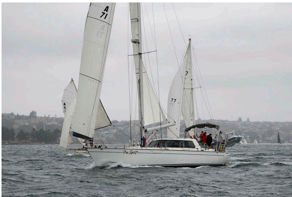
Free Spirit , Cherub and Anitra V about to finish. Free Sprit finished second after As You Do in Division 1