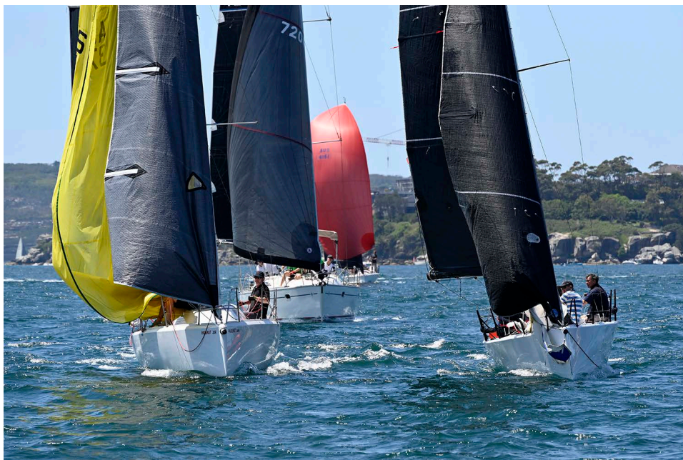
Wilding 3, Samphire, Clewless? and Rapid Transit approaching the Nielsen Park mark