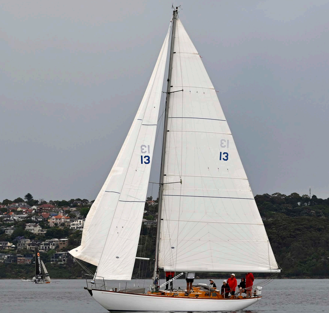
Caprice of Huon trying to make the best of the very light and flukey wind to get to the finish of the Sunday race on 7 November