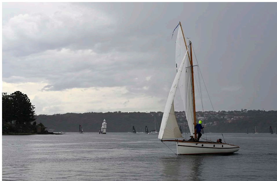
Cherub drifting towards the finish in a fading easterly. Just after she finished the wind came in from the NW at about 8 knots. The storm in the background may have been responsible