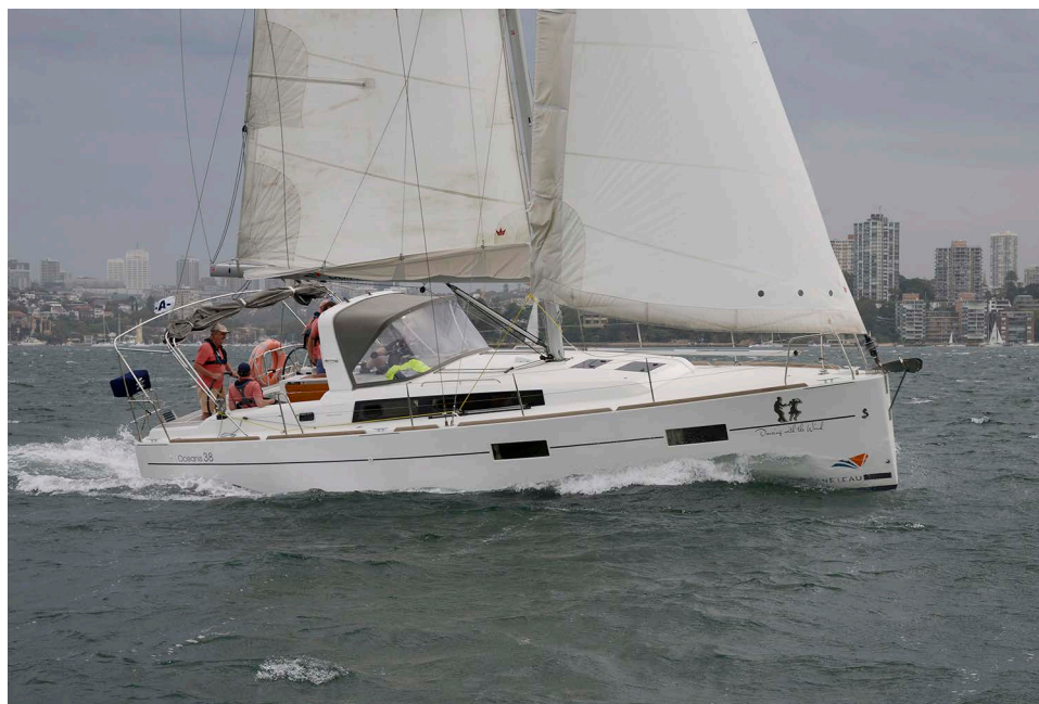
A brisk southerly arrived for the start on Friday 19 November. Dancing with the Wind seemed to enjoy it